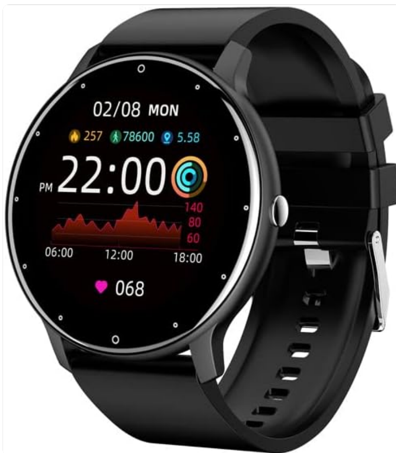
Figure 1.1: Dafit ZL02CPRO Smart Watch (Black Silicone Strap)

The Dafit ZL02CPRO Smart Watch is a versatile wearable device designed for health monitoring, fitness tracking, and smart notifications. It features a 1.28-inch round TFT screen, Bluetooth call functionality, and multi-sport modes. This manual provides detailed instructions for setup, operation, and maintenance of your smart watch.