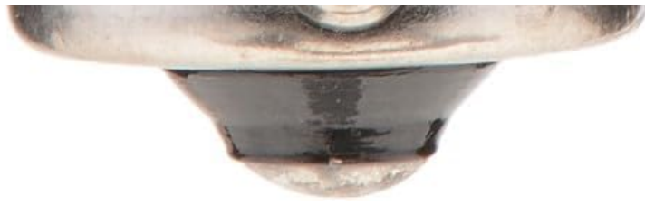
Image: A side view of the PartCatalog rear fog light bulb, illustrating its base and filament structure, which aids in proper installation.