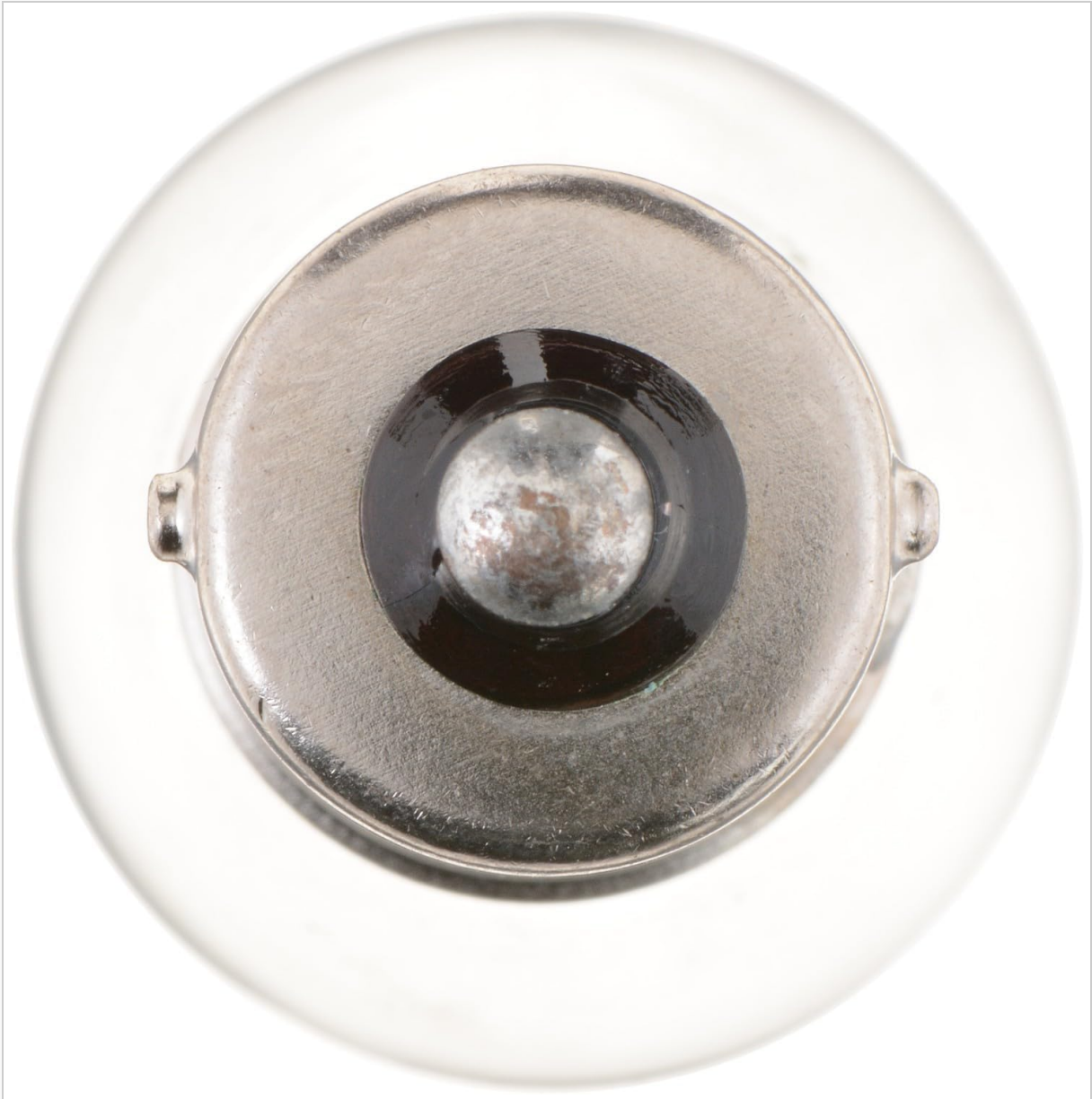
Image: A view of the base of the PartCatalog rear fog light bulb, showing the contact points for electrical connection within the vehicle's socket.