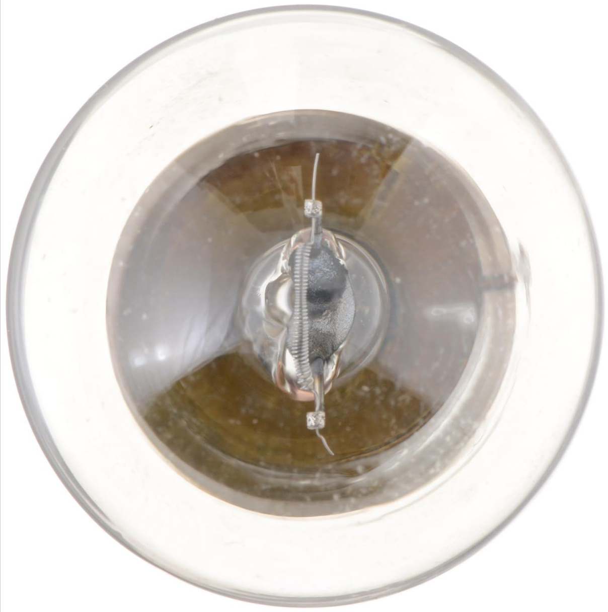
Image: A close-up view of the filament inside the PartCatalog rear fog light bulb, highlighting the component responsible for light generation.