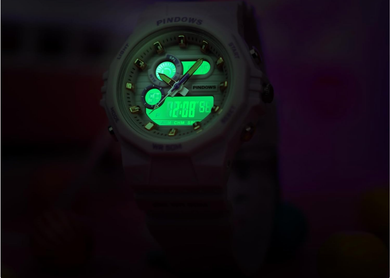
Image: The watch display illuminated by its LED backlight, showing clear visibility in dark conditions.