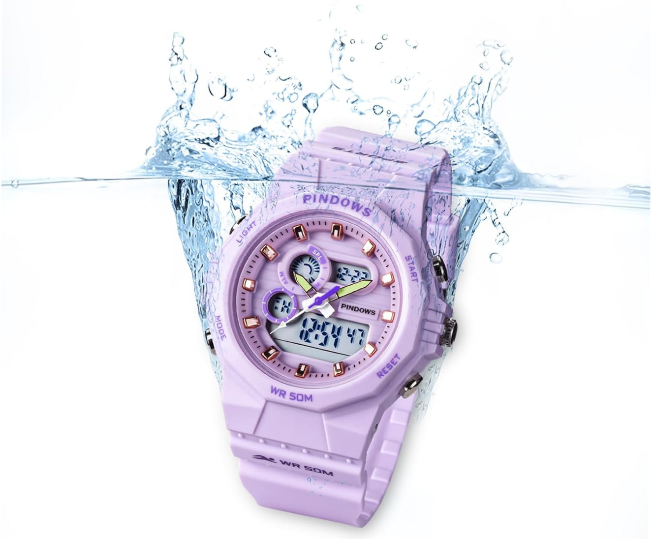
Image: The watch partially submerged in water, illustrating its 50M water resistance feature.