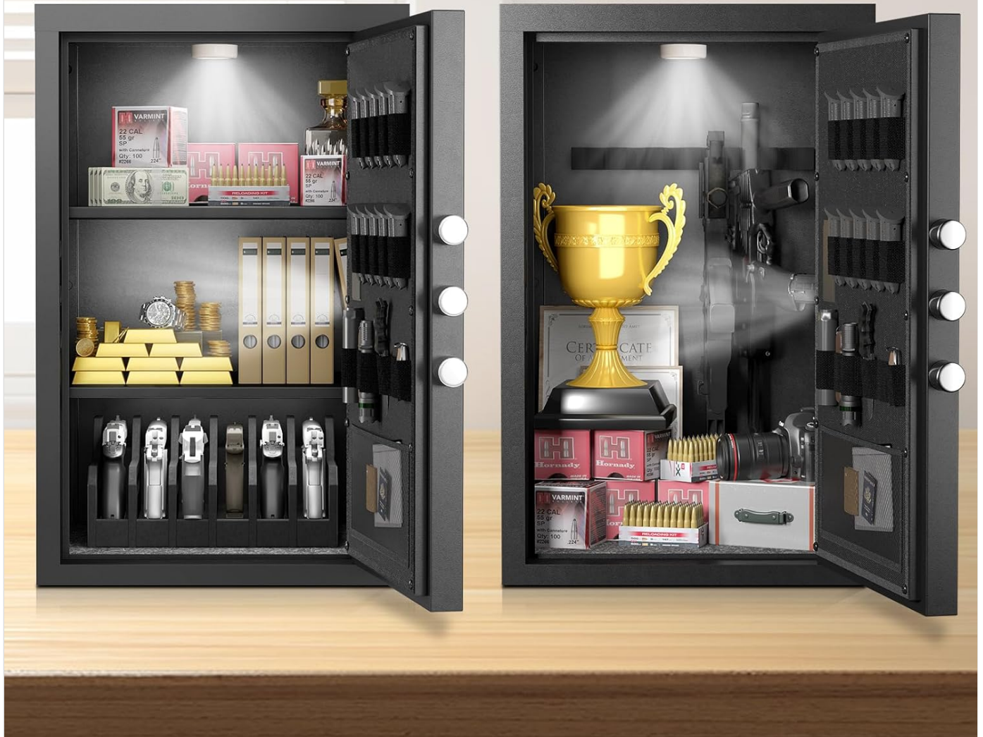
Figure 7: Multifunctional Storage Space