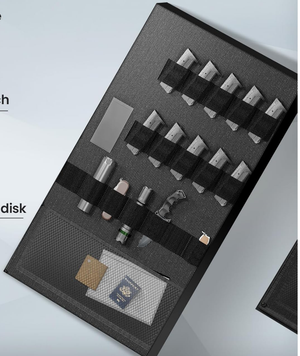
Figure 8: Multifunctional Gun Organizer on Door