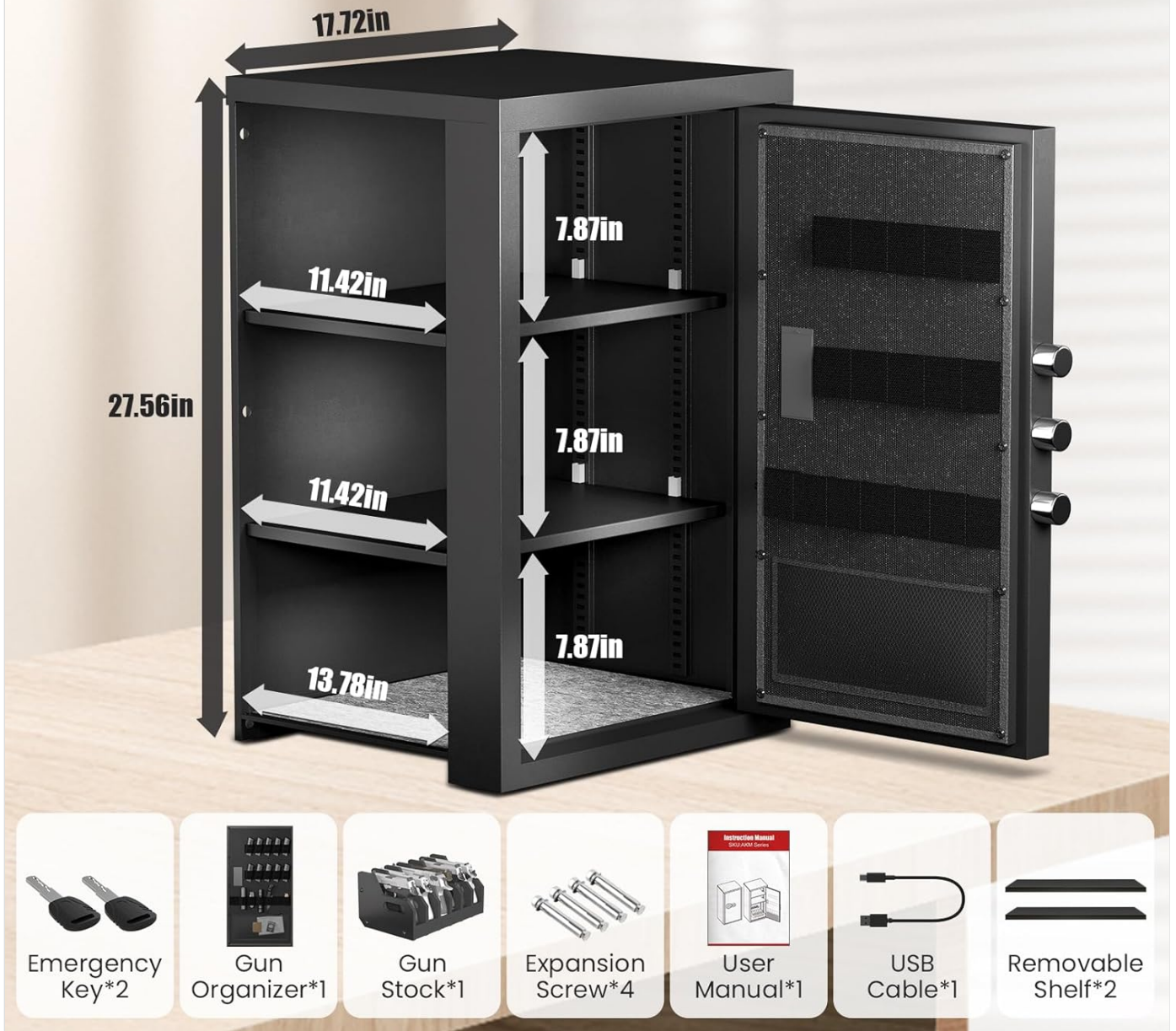
Figure 2: All Included Components