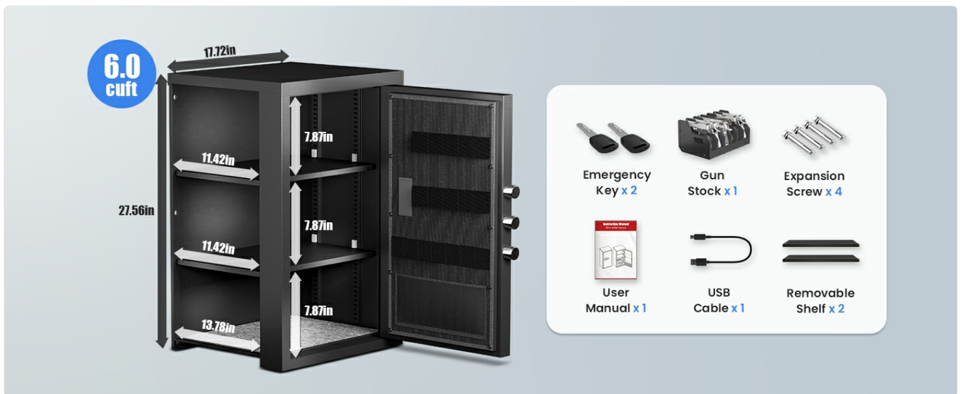
Figure 3: Safe Assembly Diagram