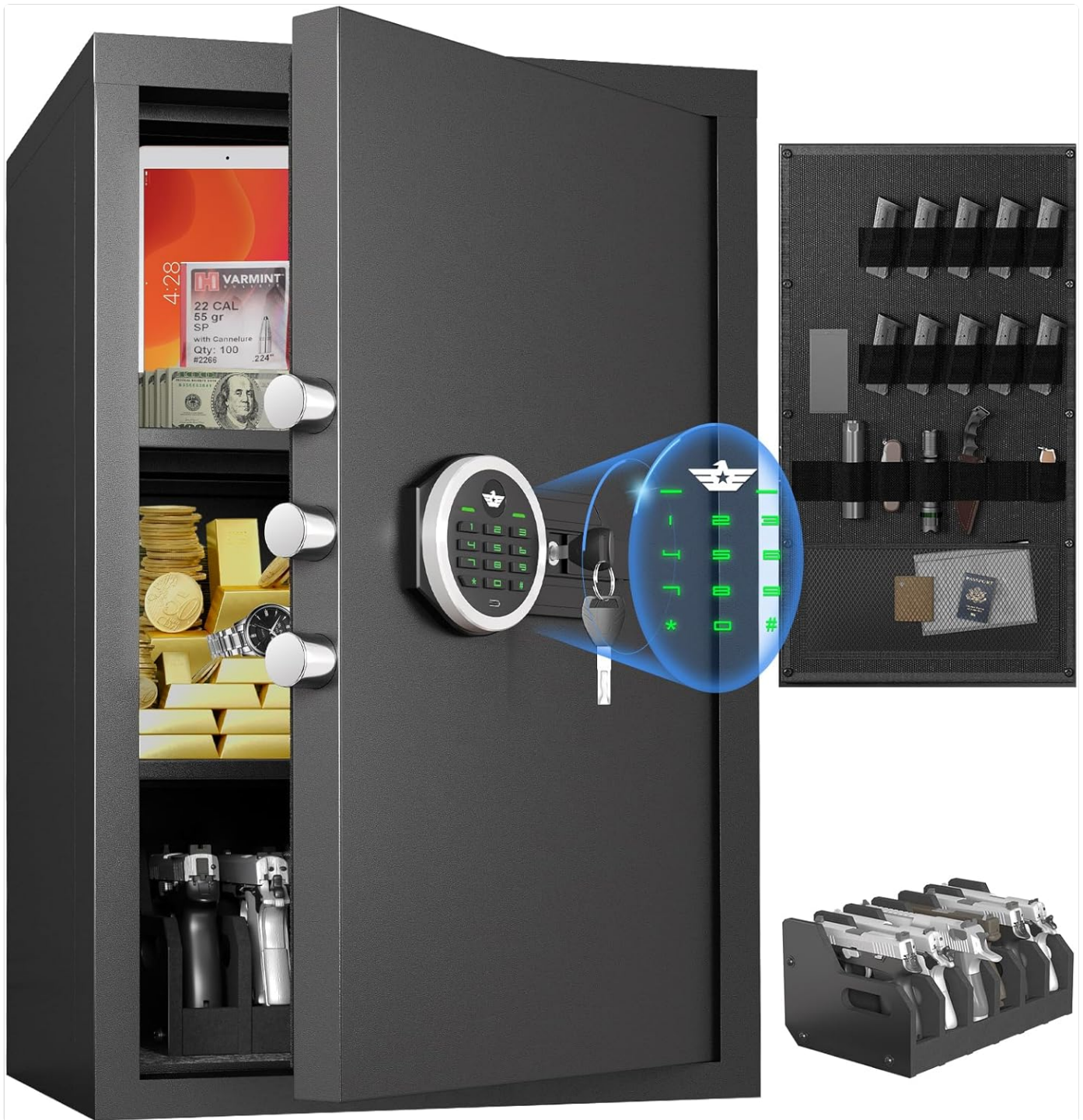
Figure 1: Riflevault 6.0 Cu ft Digital Money Safe