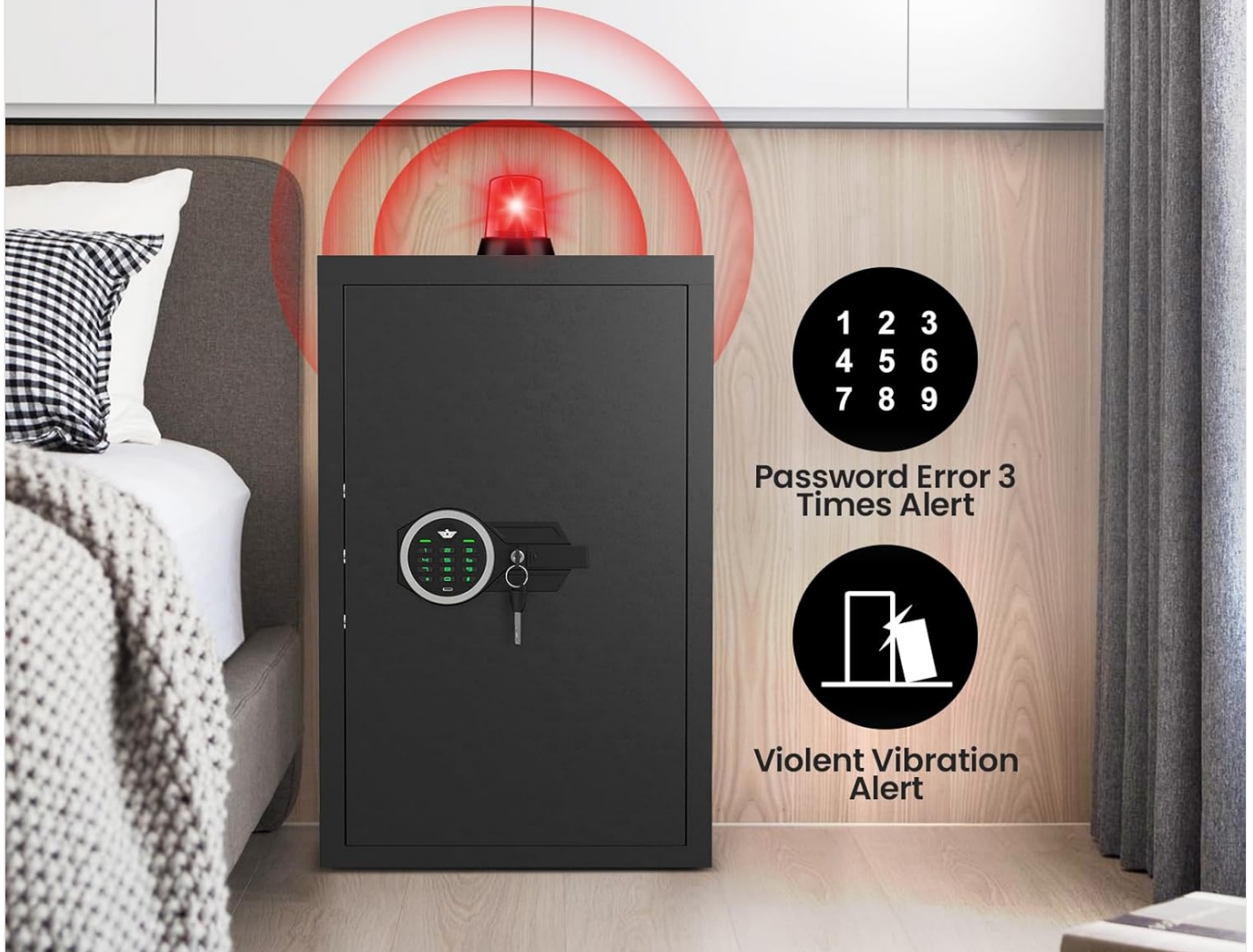
Figure 5: Dual Alarm System