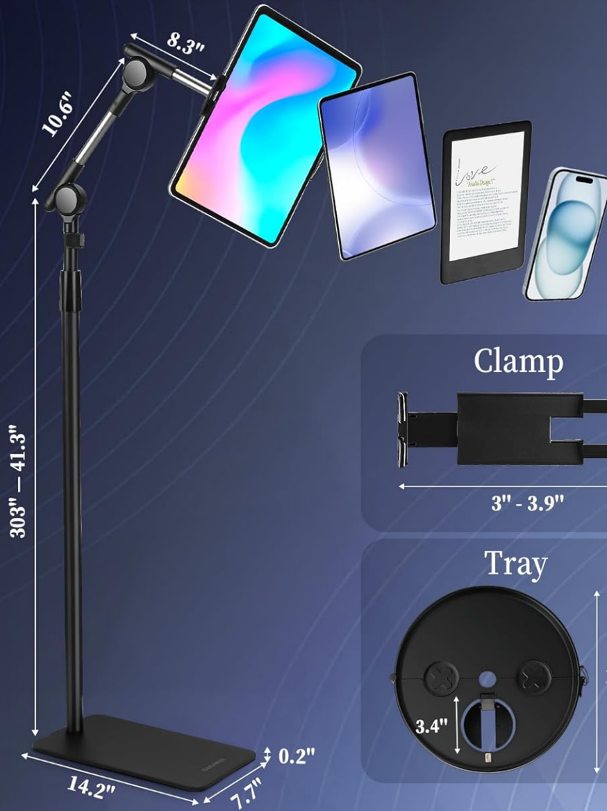
Image: A detailed view of the SHUWEI Tablet Floor Stand with the tray attached, highlighting its dimensions and compatibility.