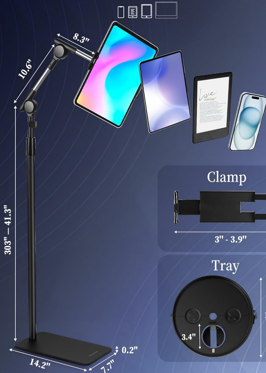
Image: A detailed view of the SHUWEI Tablet Floor Stand with the tray attached, showing its utility for holding small items.