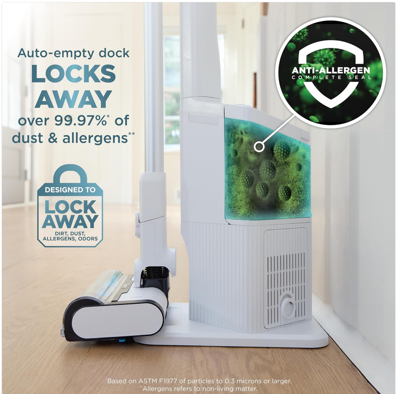
Image: An illustration of the Auto-Empty Dock's Anti-Allergen Complete Seal, demonstrating how it locks away over 99.97% of dust and allergens, ensuring cleaner air.