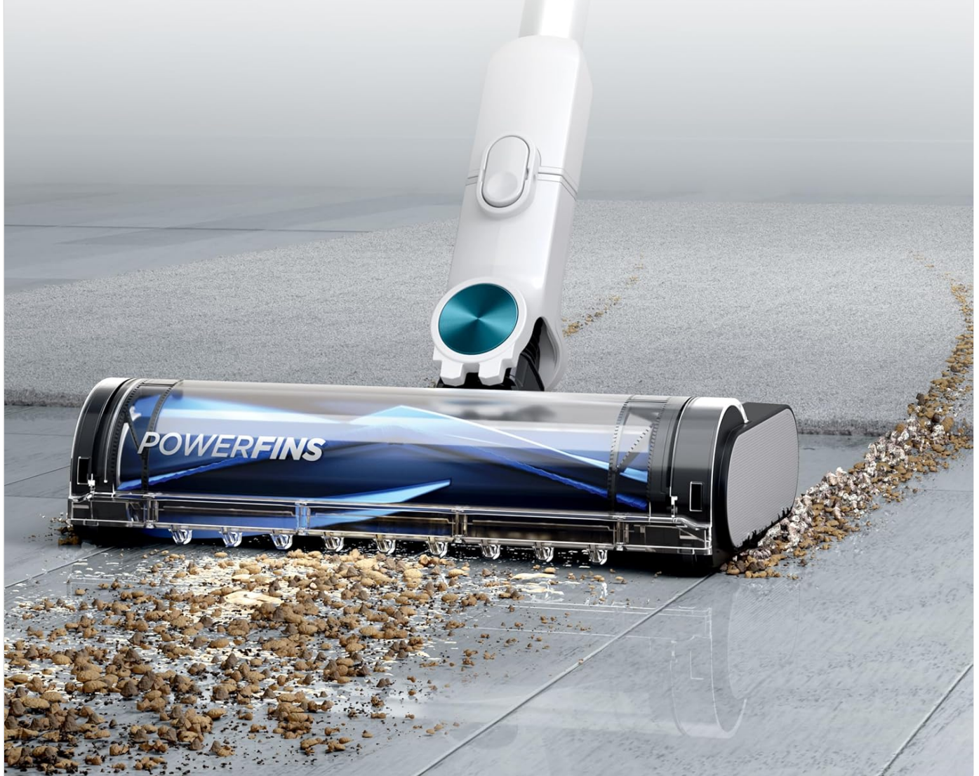
Image: The vacuum's PowerFins™ brushroll is shown cleaning both a carpeted area and a hard floor, illustrating its multi-surface cleaning capability and automatic brushroll speed adjustment.