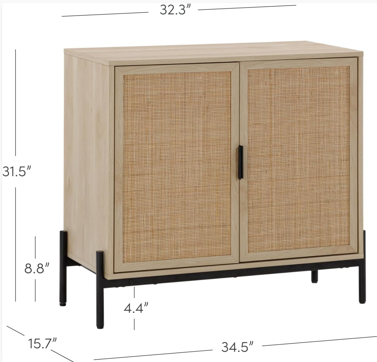
Image: Detailed dimensions of the Andrew Accent Cabinet.