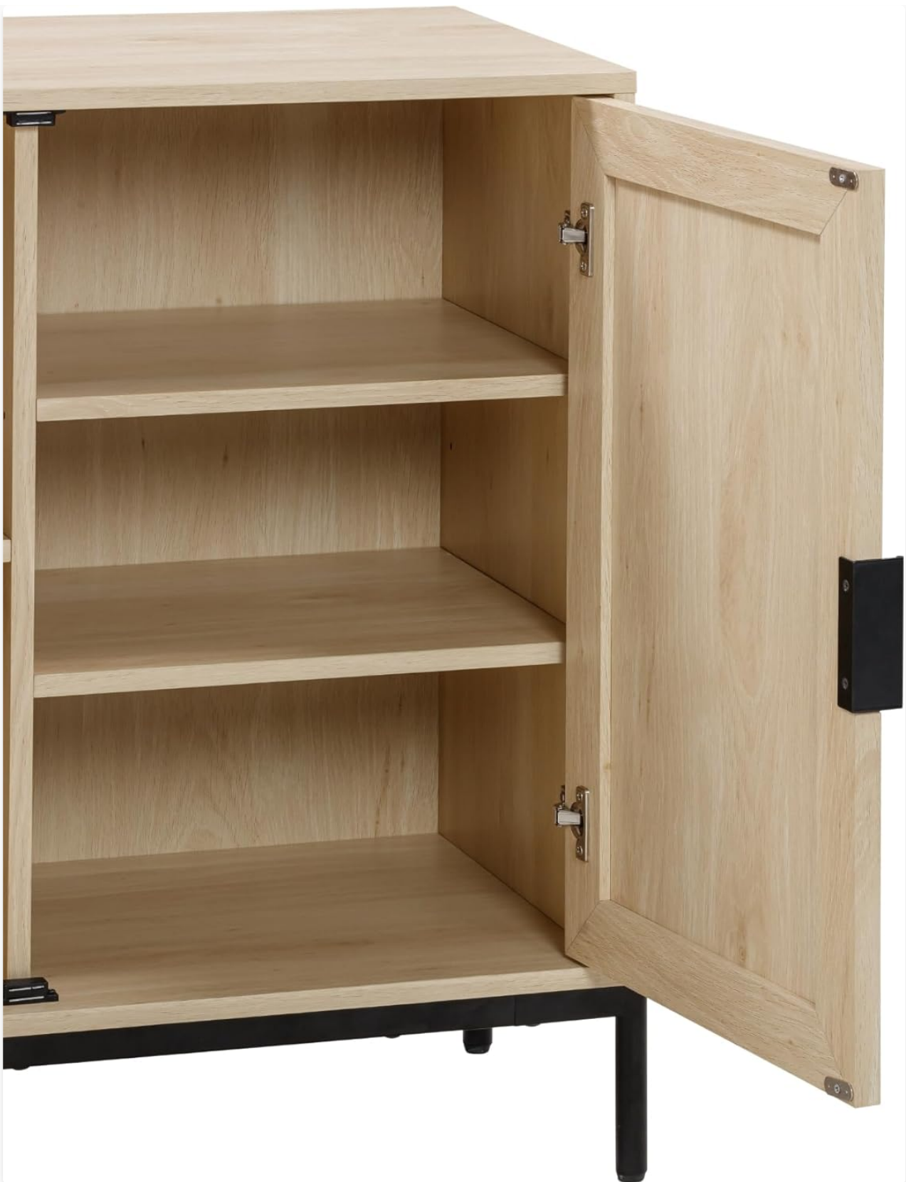
Image: The interior of the Andrew cabinet, demonstrating the adjustable shelf configuration.