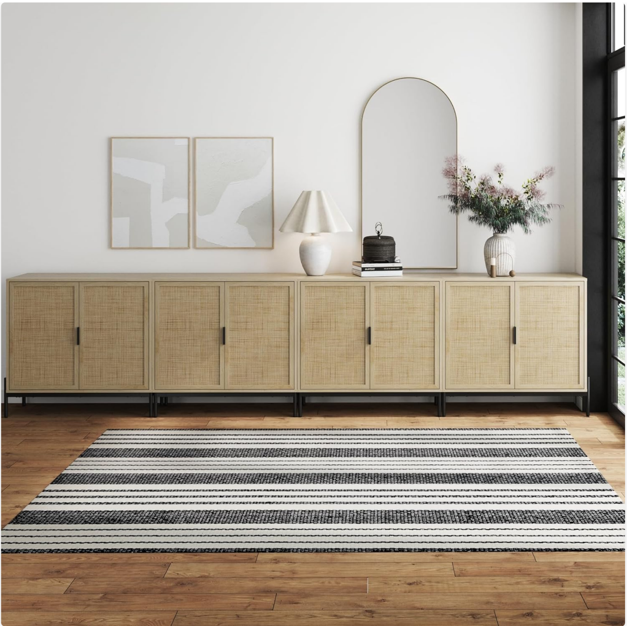
Image: The Andrew Bohemian Console Table, showcasing its design and potential use as a long console unit.