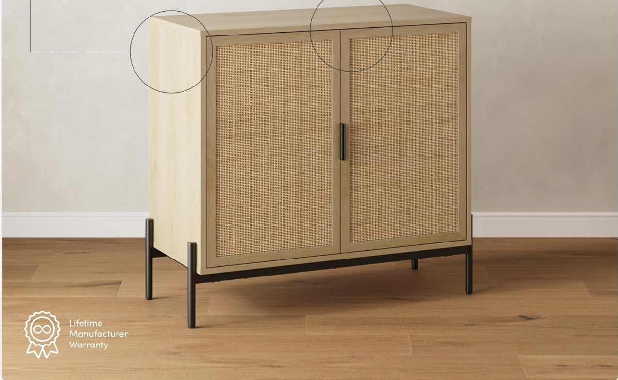
Image: Details of the Andrew cabinet's frame and features, including the sturdy metal base and natural rattan doors.