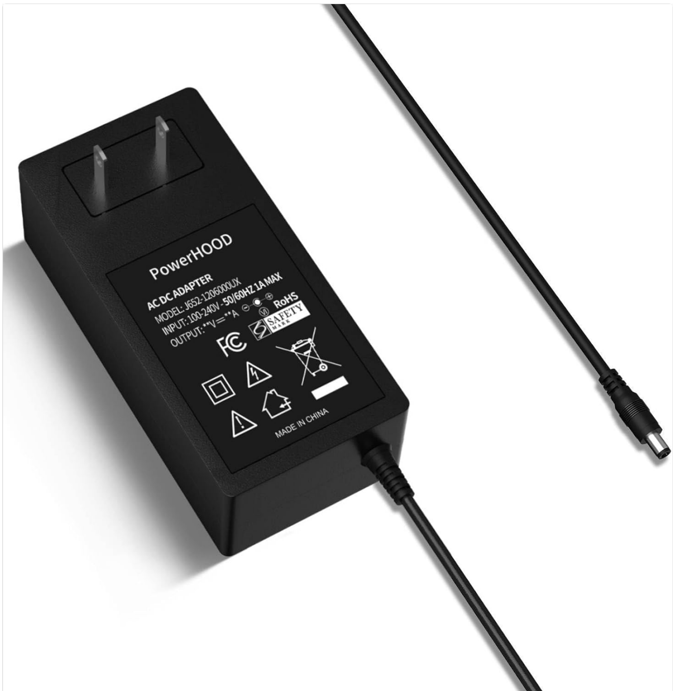
Figure 1: PowerHOOD 19V AC/DC Adapter with its power cord.

The adapter features a compact design and is equipped with multiple safety protections to ensure stable and secure power delivery.