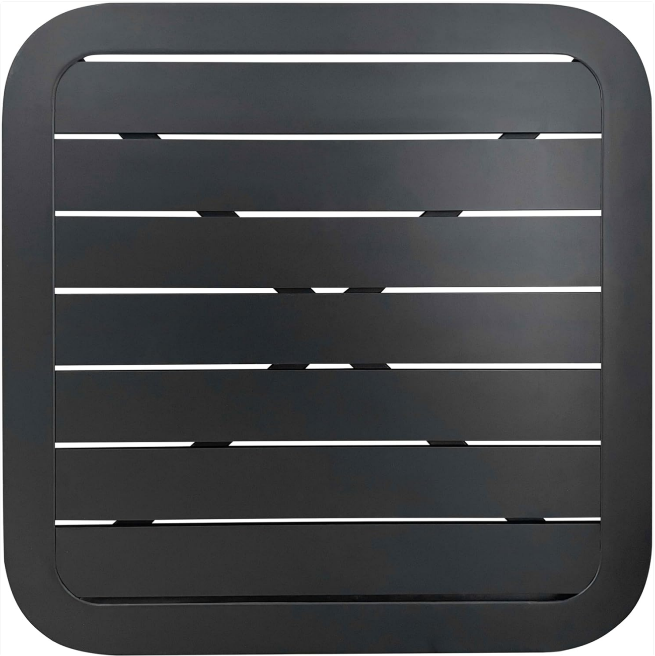
Image 1: Top view of the Oviala Almada 70x70 cm Black Aluminum Tabletop, showcasing its slatted design and rounded corners.