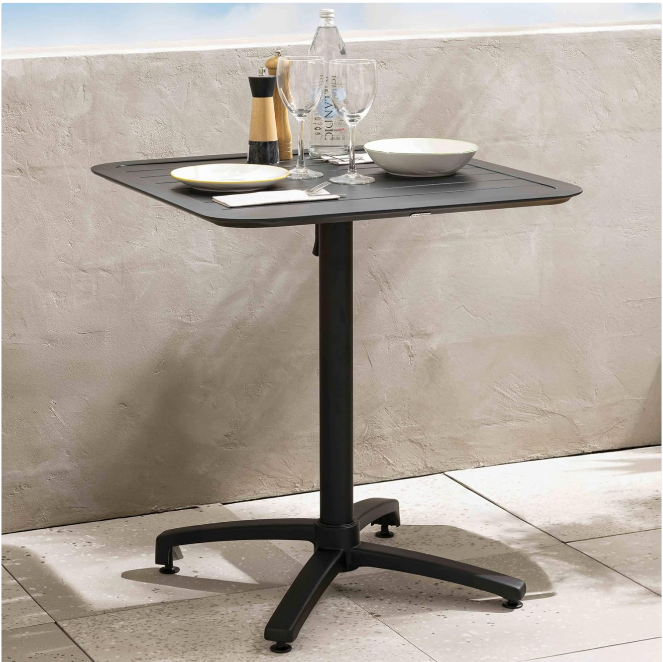
Image 3: The Oviala Almada tabletop assembled on a compatible table base, shown in an outdoor patio environment.