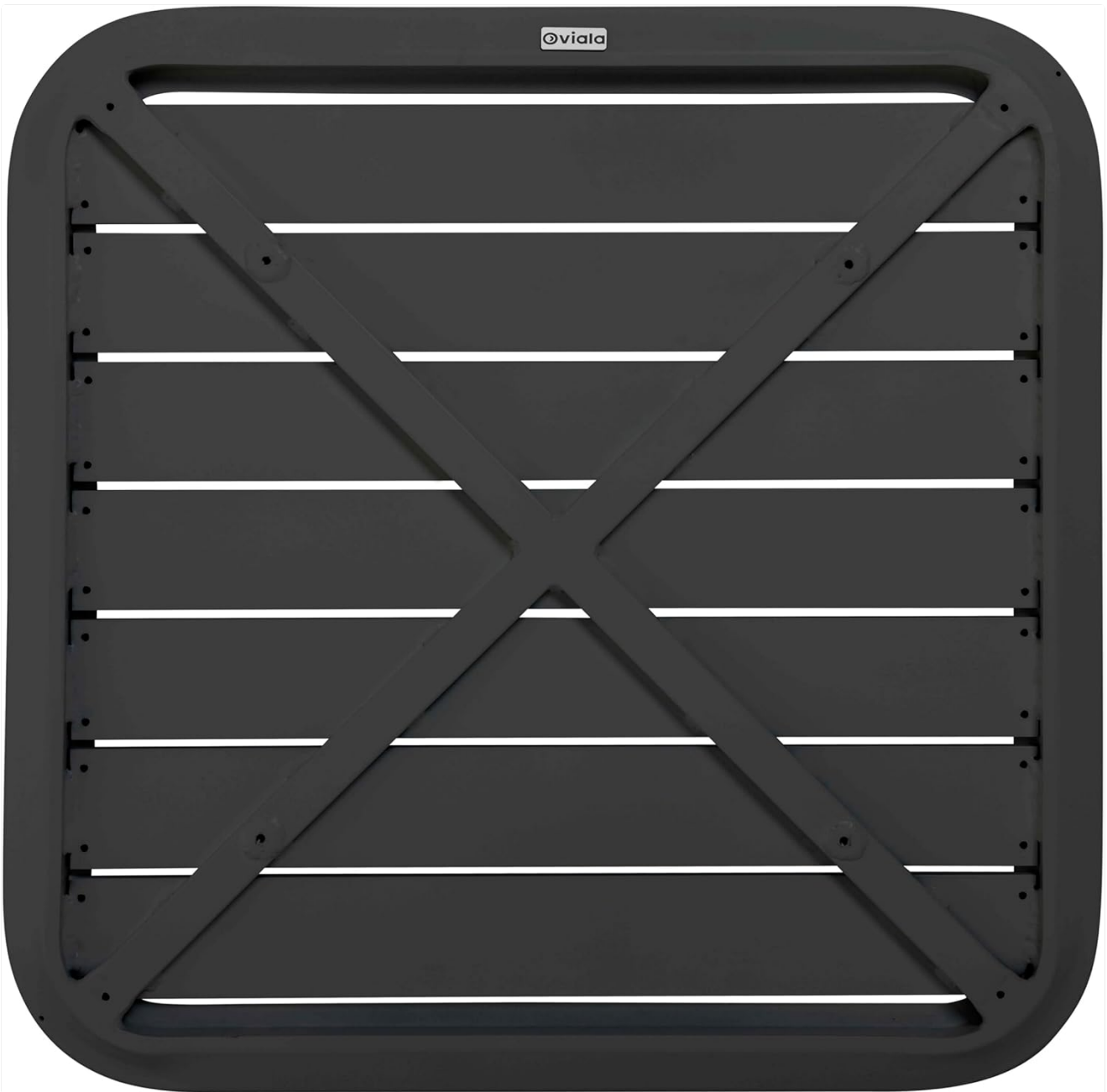
Image 2: Underside view of the Ovia Almada tabletop, illustrating the cross-brace structure for base attachment and the Ovia logo.