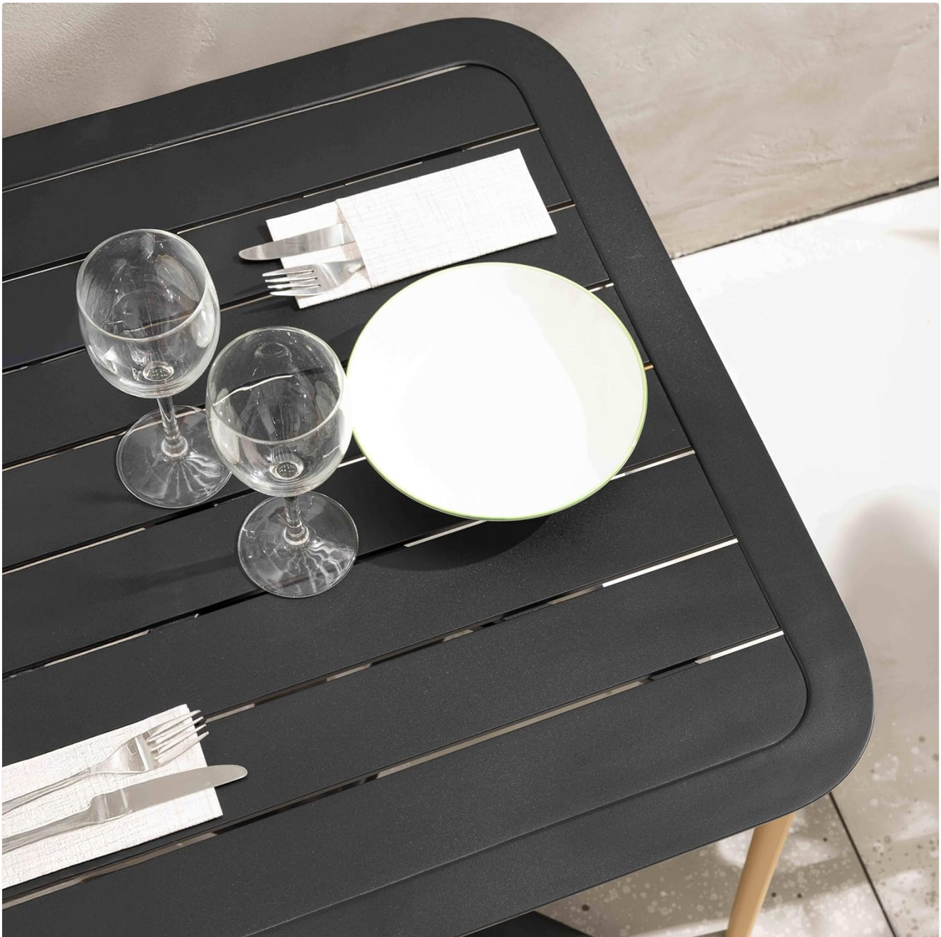
Image 4: Close-up view of the Oviala Almada tabletop surface, demonstrating its texture and appearance with place settings.