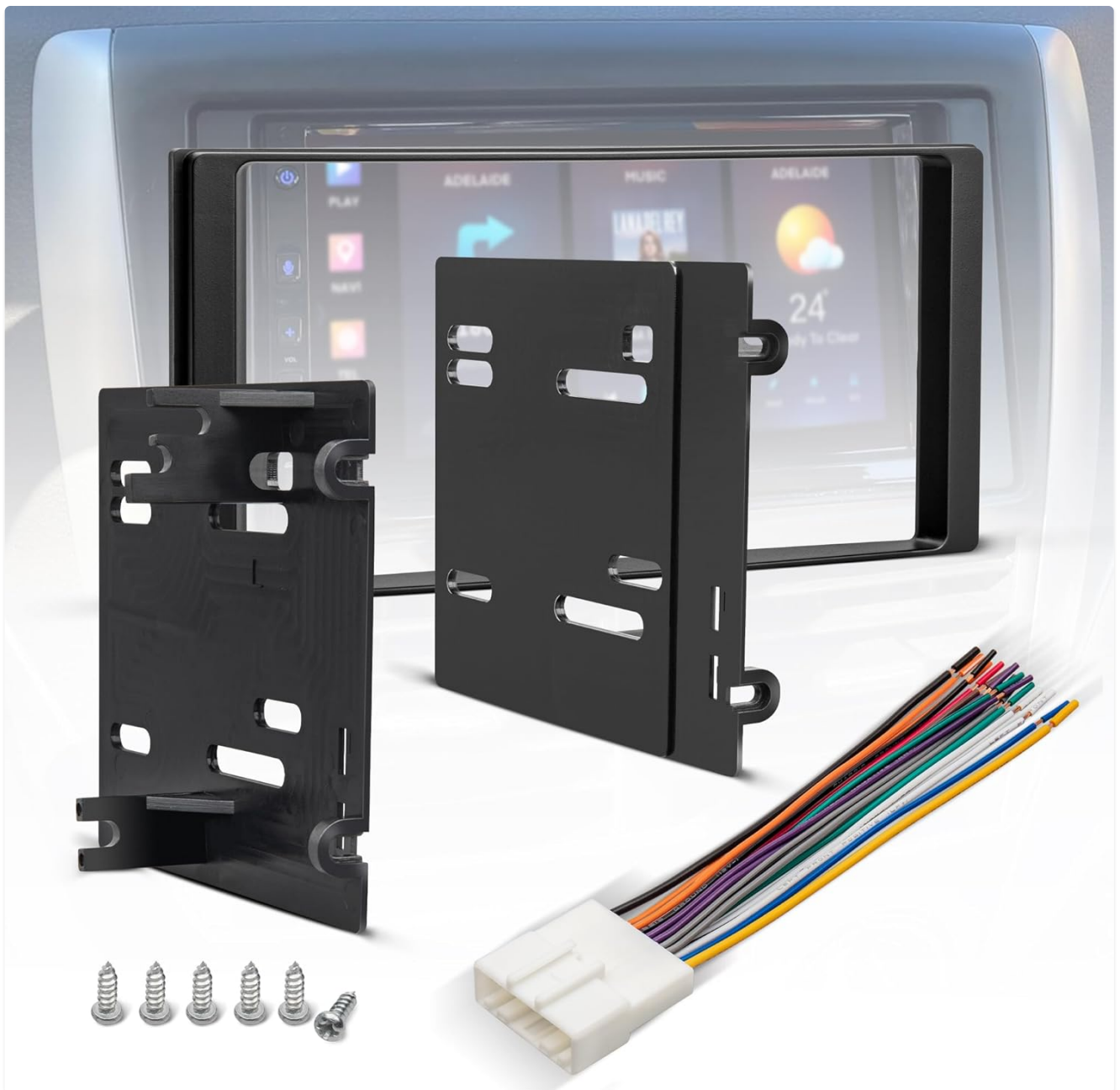
Image 2.1: Overview of the Nulth Double DIN Radio Installation Dash Kit components, including the dash bezel, mounting brackets, wiring harness, and screws.