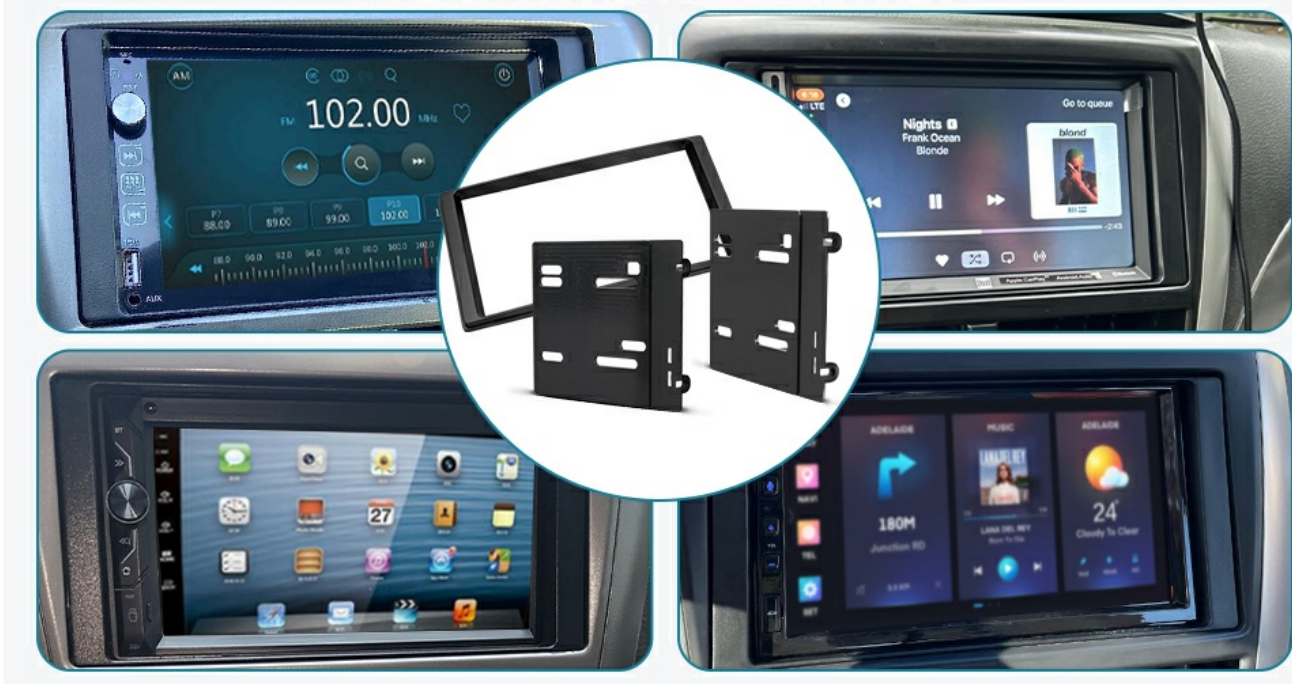
Image 5.5: Various examples demonstrating how the dash kit integrates seamlessly with different aftermarket radios in Subaru dashboards.