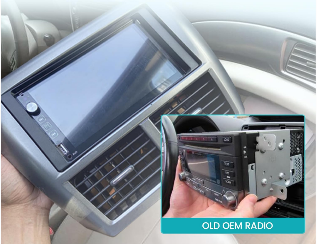
Image 5.2: The new aftermarket radio mounted onto the provided installation brackets, replacing the old OEM radio housing.

Specially designed for double din aftermarket radio