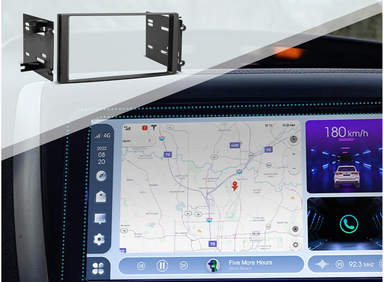
Image 5.1: The black double DIN trim bracket, designed for precise contour matching and color integration with the factory dashboard.