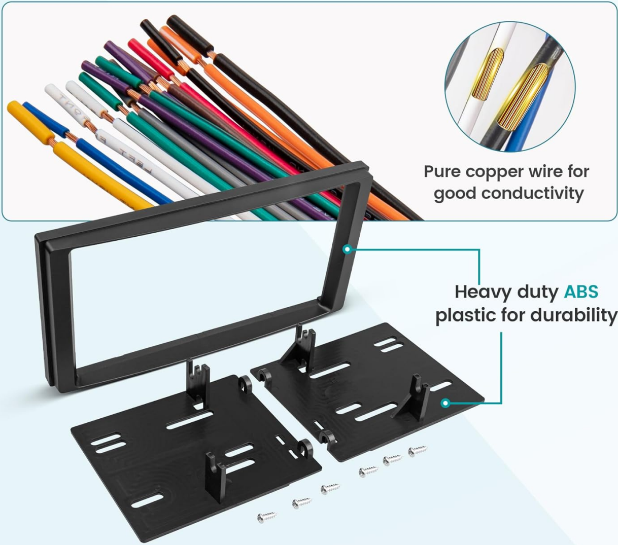
Image 4.2: Illustration of the high-quality materials used, including pure copper wire and heavy-duty ABS plastic.