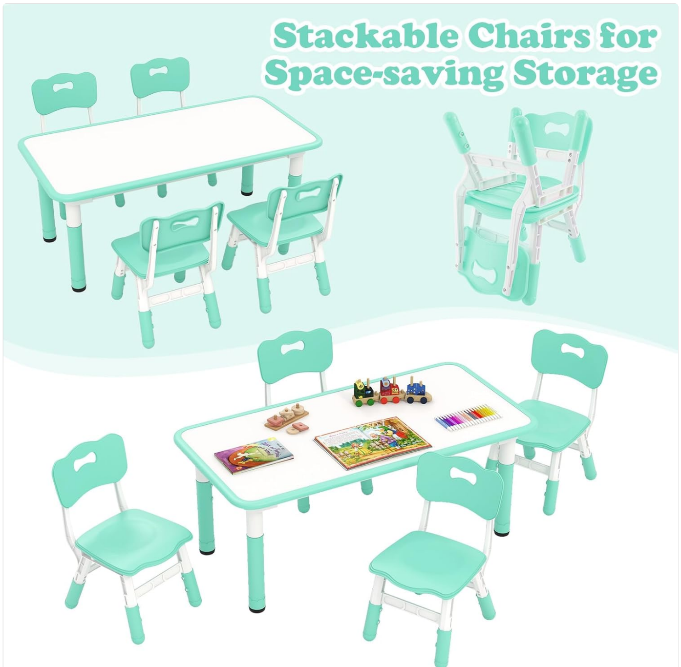
Figure 6.1: Illustration demonstrating how the chairs can be stacked for efficient, space-saving storage, ideal for smaller rooms or when the set is not in active use.