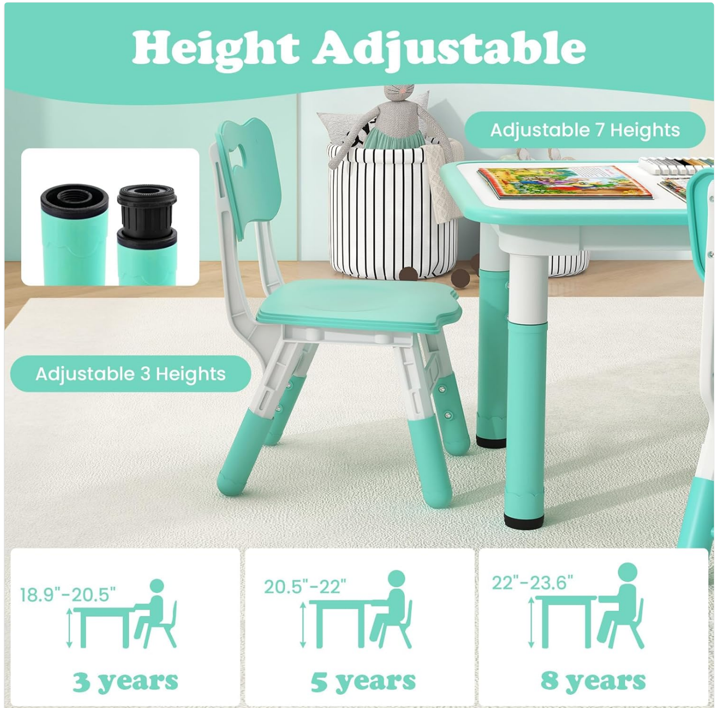
Figure 5.1: Illustration of the height adjustment feature for both the table (7 heights) and chairs (3 heights). The image shows close-ups of the leg adjustment mechanisms and diagrams indicating suitable ages for different height settings (e.g., 3 years for 18.9"-20.5" table height).