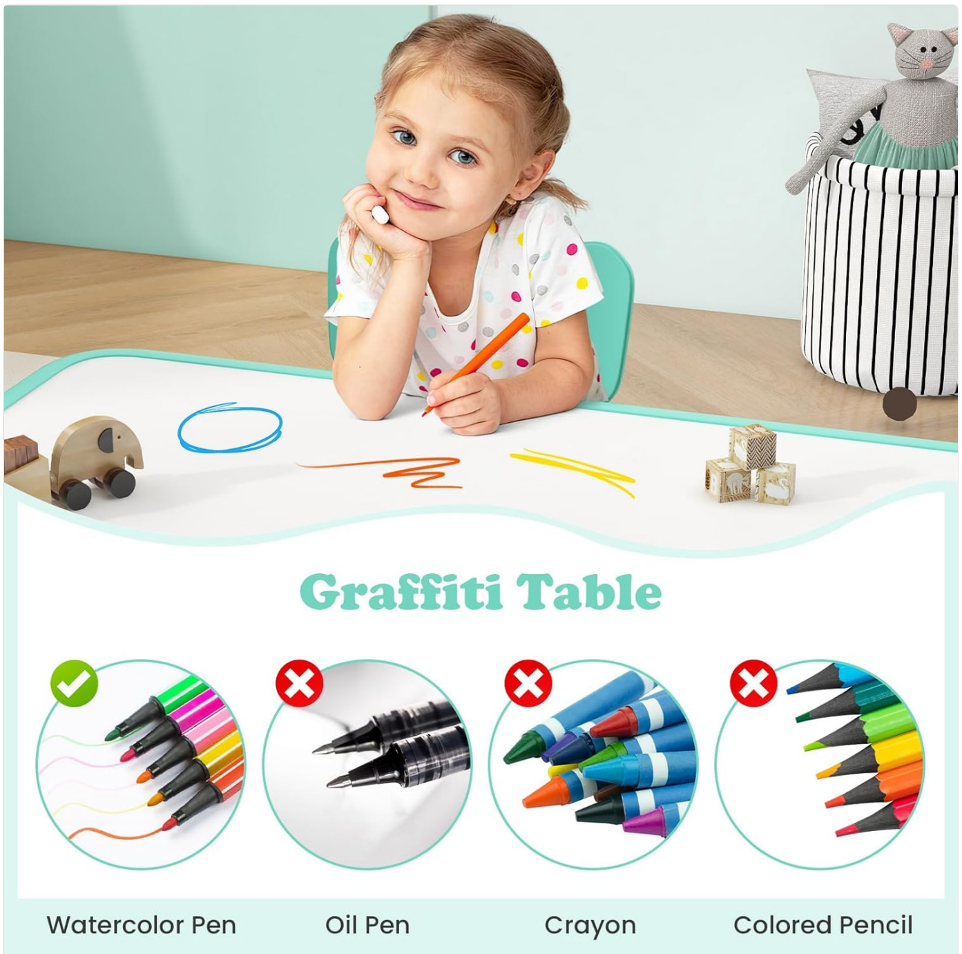
Figure 5.2: A child drawing on the graffiti tabletop. The image clearly indicates that only watercolor pens are suitable for use on the surface,