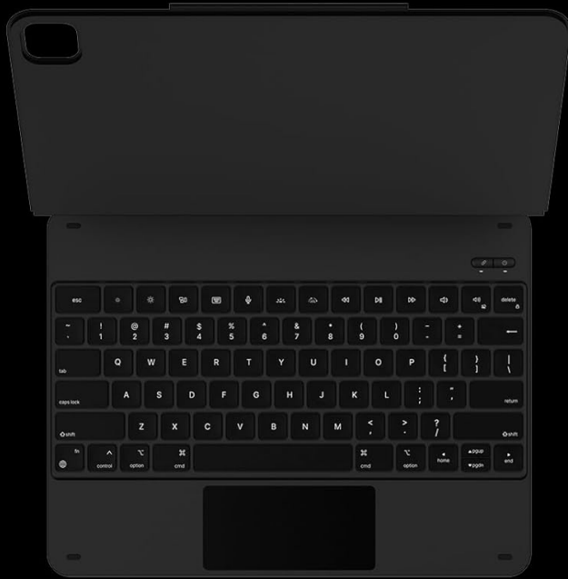
Typecase Edge Keyboard