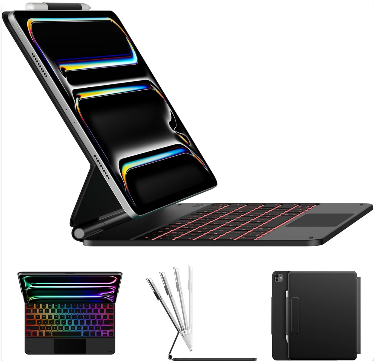
Figure 5.2: Adjustable viewing angles with the magnetic stand.