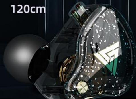
Figure 5: Product parameters for the AK6 PRO earbuds.