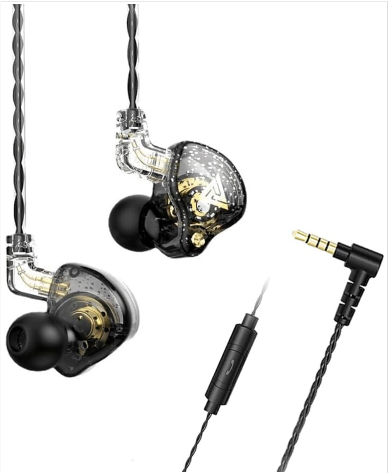
Figure 1: Yeabomy QKZ AK6 PRO Wired Gaming Earbuds, showing the earbuds, detachable cable, and 3.5mm audio jack.