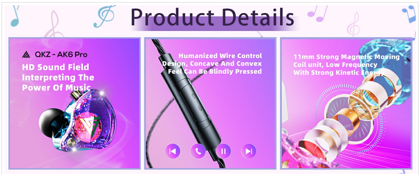
Figure 2: Detailed view of the earbud's internal components, wire control, and sound technology.