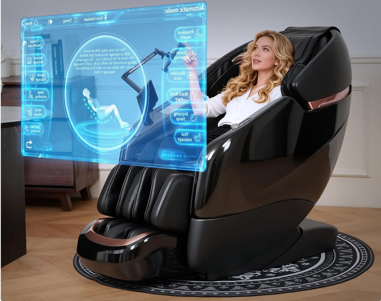
Figure 8: Comprehensive Full-Body Massage Options