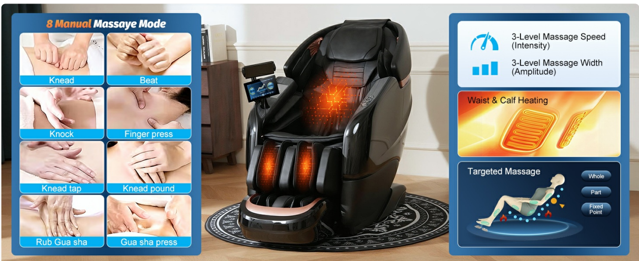
Figure 9: 8 Manual Massage Modes and Heating Zones