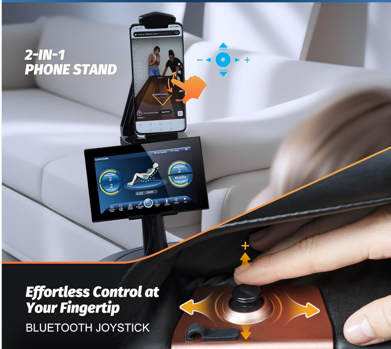
Figure 5: Bluetooth Joystick and Phone Mount