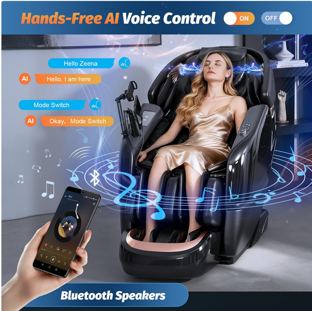
Figure 3: AI Voice Control in Action