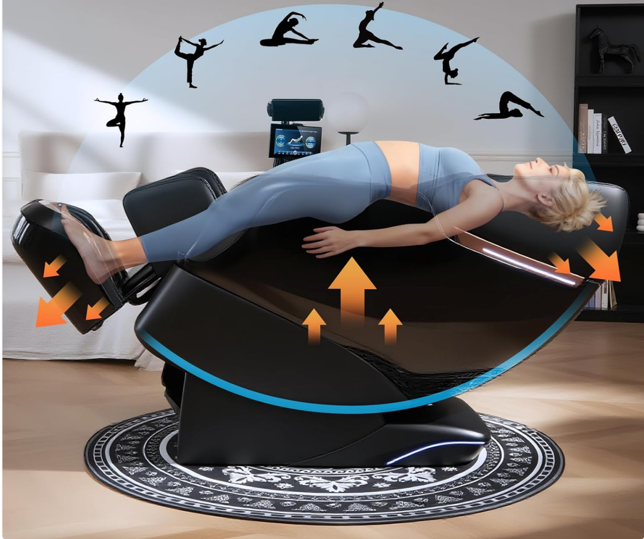
Figure 12: Thai Yoga Stretching Mode