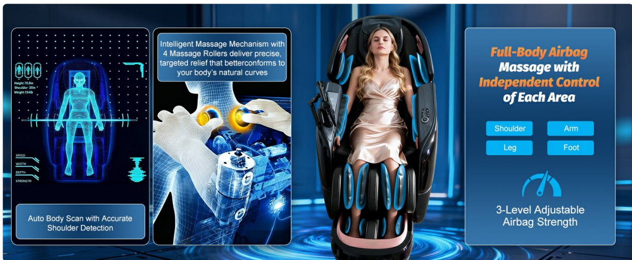
Figure 10: Full-Body Airbag Massage