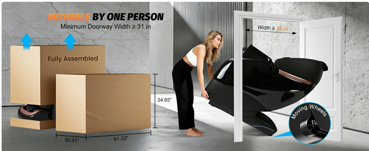
Figure 2: Moving the Massage Chair