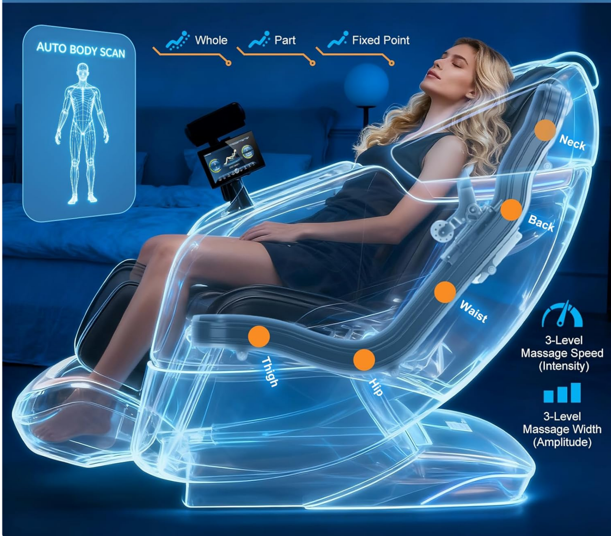
Figure 7: SL-Track and Auto Body Scan

Adjustable Rollers • Full Spine Coverage