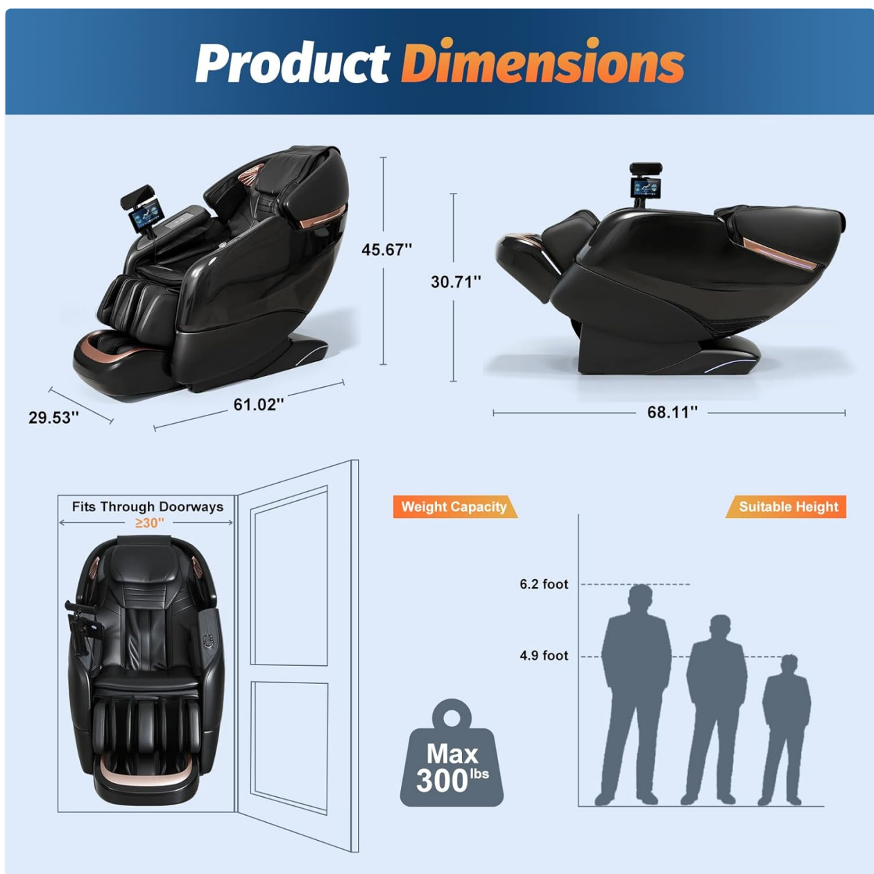
Figure 1: Product Dimensions and Entry Requirements