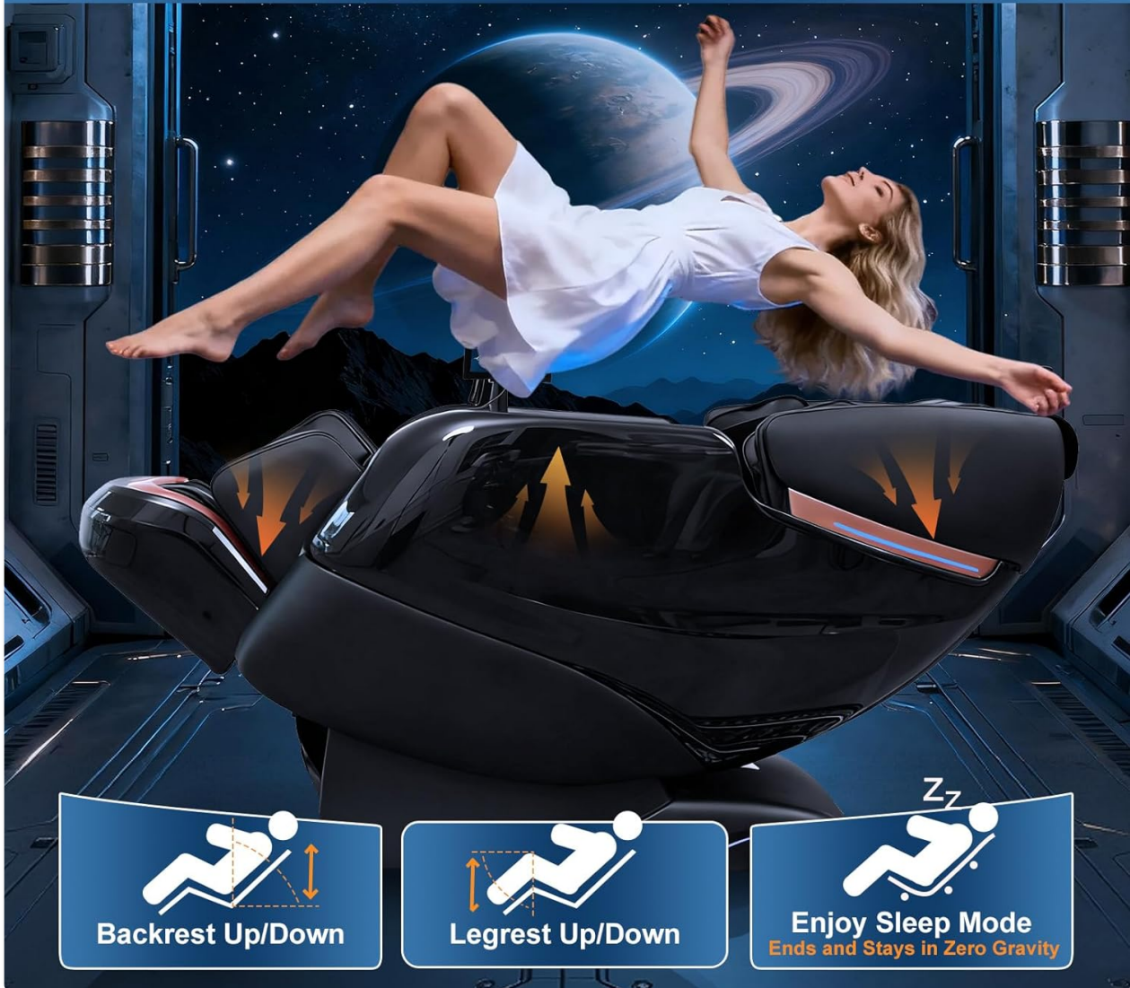
Figure 6: One-Touch Zero Gravity Recline