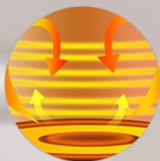
360° Heat Conduction