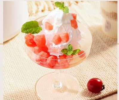
Yogurt ice cream

Image: The included strainer, designed to separate whey for thicker Greek yogurt.