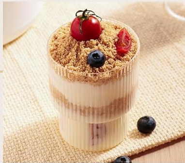
Yogurt bran cup