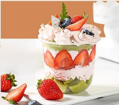
Yogurt fruit cup