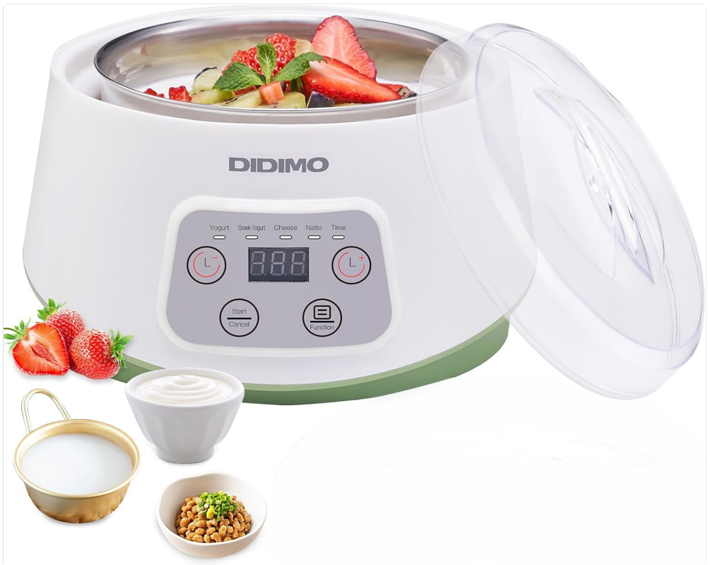
Image: The DiDimo Yogurt Maker with its main components and examples of finished products.