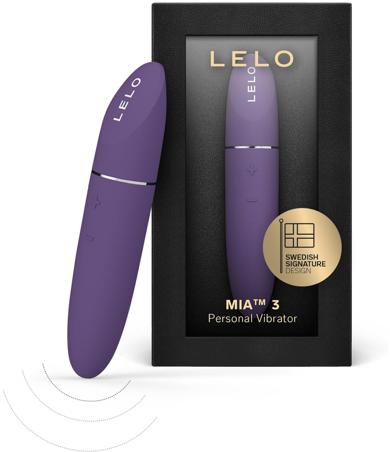
Image: The LELO MIA 3 Personal Massager in purple, displayed alongside its elegant black packaging.