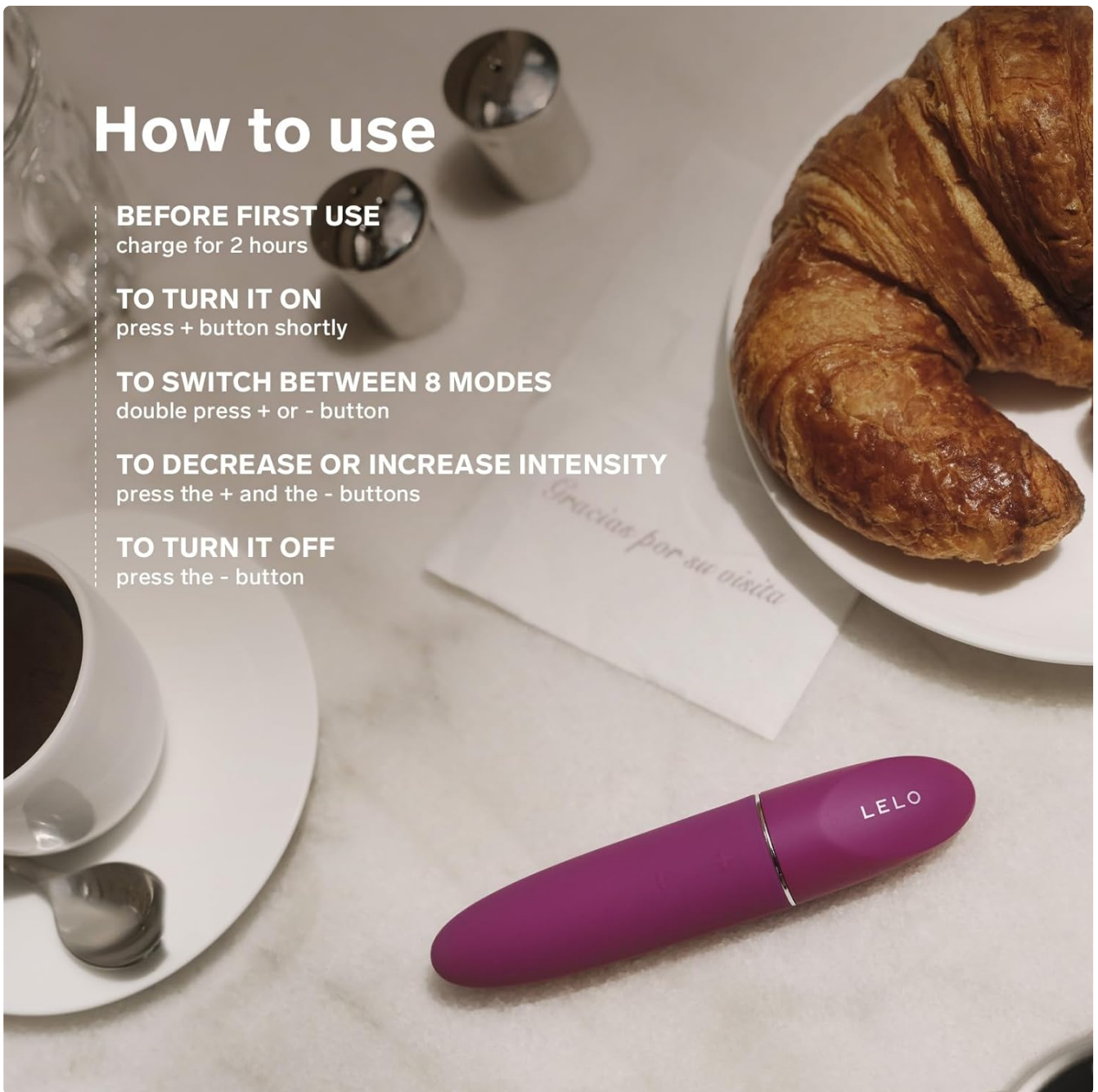
Image: Step-by-step visual guide on how to operate the LELO MIA 3, including power and mode controls.