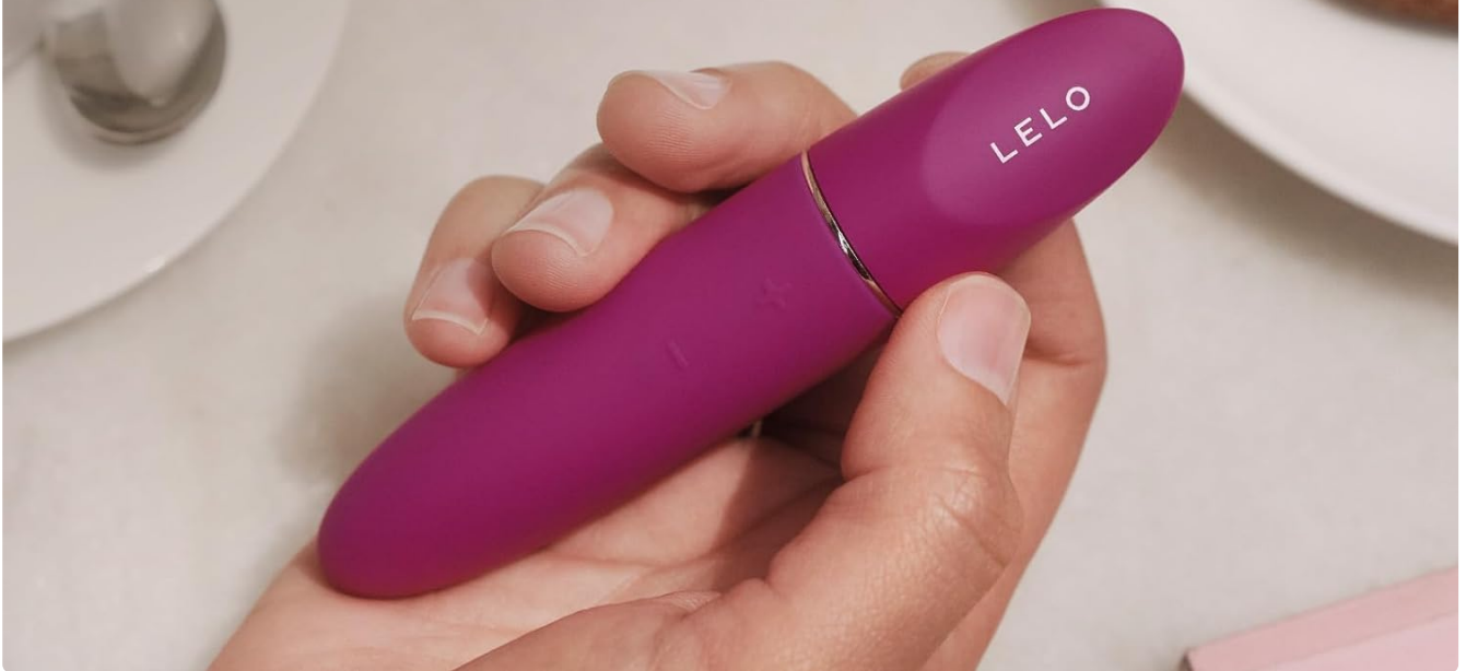
Image: Key information regarding charging, use time, travel lock, and USB rechargeable feature of the MIA 3.