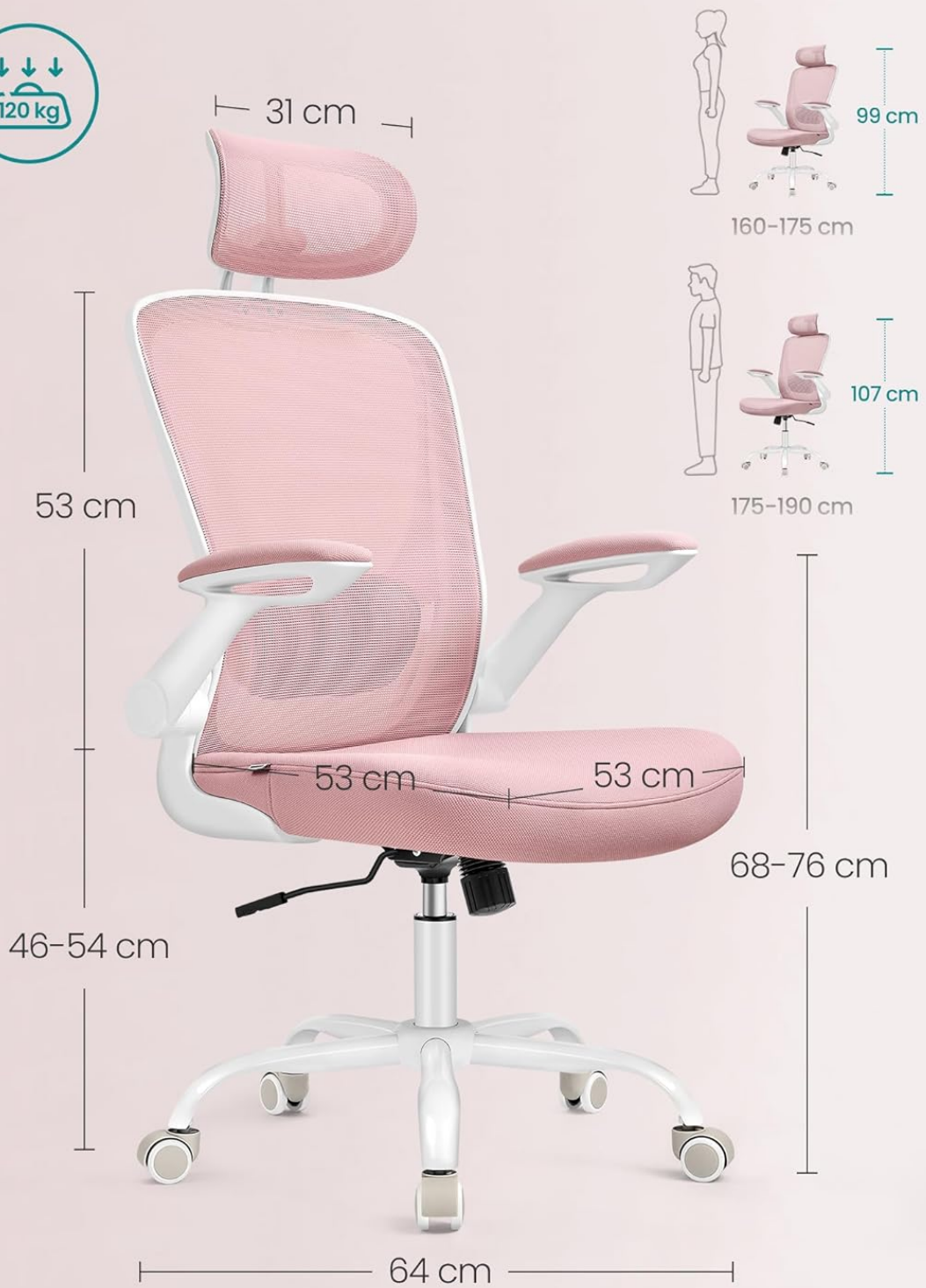
Image: A diagram illustrating the key dimensions of the SONGMICS OBN047R01 office chair in centimeters, along with its maximum weight capacity of 120 kg.