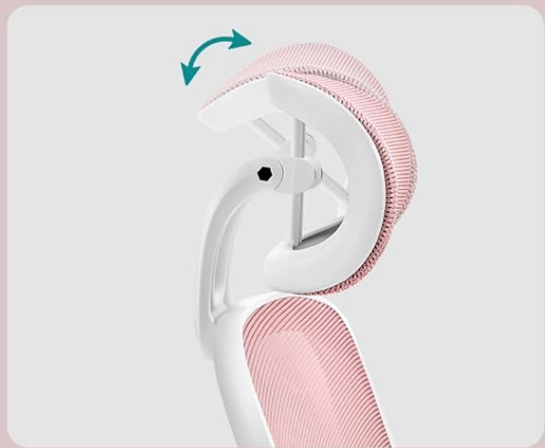
Image: A detailed view of the adjustable headrest, demonstrating its ability to tilt and move vertically for personalized neck and head support.