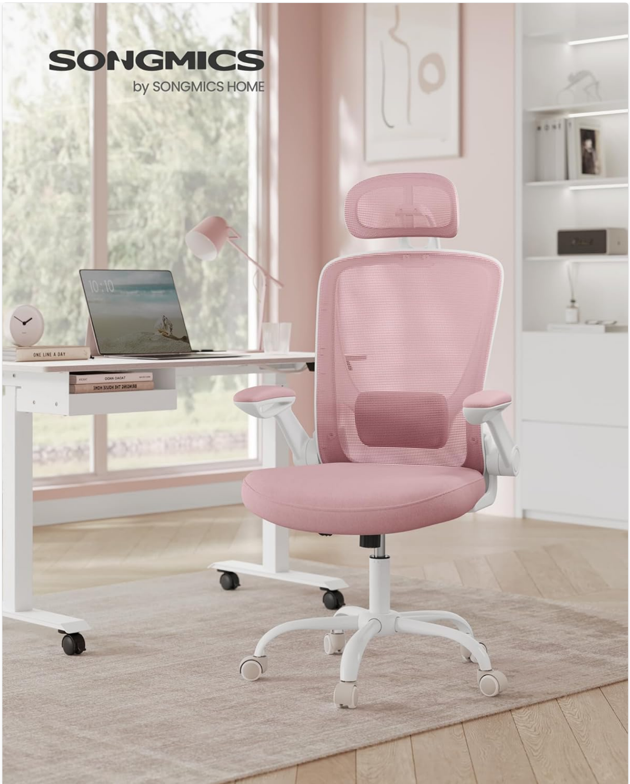
Image: The SONGMICS OBN047R01 office chair, Jelly Pink, positioned in a contemporary office environment, showcasing its design and color.