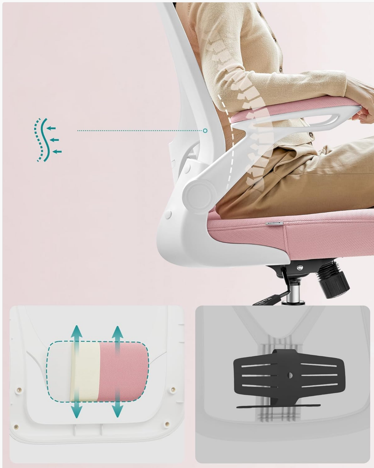
Image: A close-up view illustrating the adjustable lumbar support mechanism on the backrest of the chair, showing how it can be moved to fit the user's back.

The padded lumbar support can be adjusted to fit the curve of your lower back. Locate the adjustment mechanism on the backrest. Adjust it vertically or horizontally as needed to provide optimal support to your lumbar region.