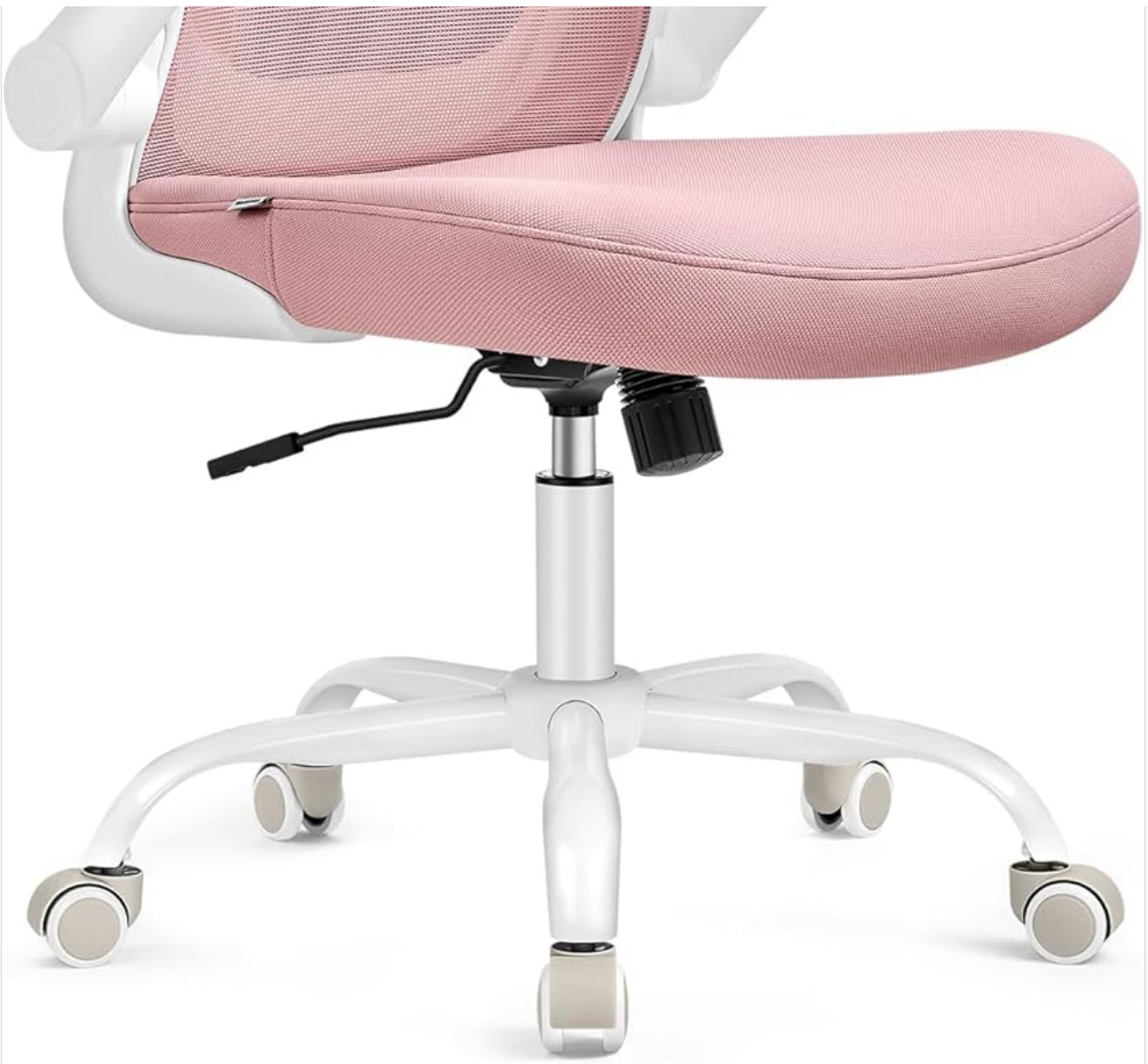
Image: The SONGMICS OBN047R01 office chair in Jelly Pink, illustrating the flip-up armrest feature, which is relevant during assembly and for space-saving.