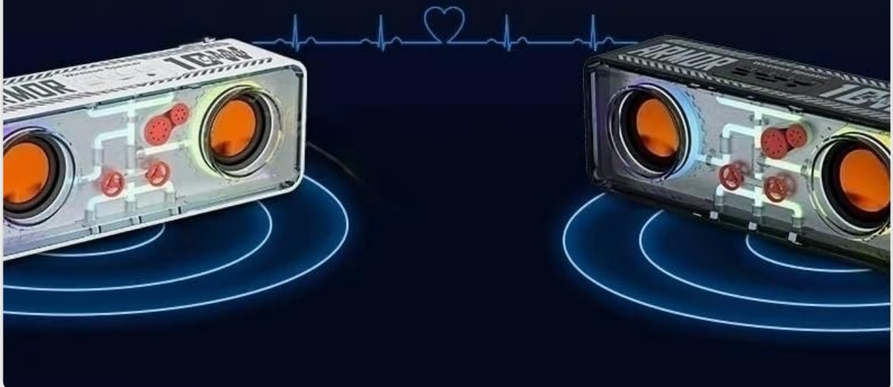
Image: Two speakers connected via TWS for a stereo audio experience.

Your browser does not support the video tag.