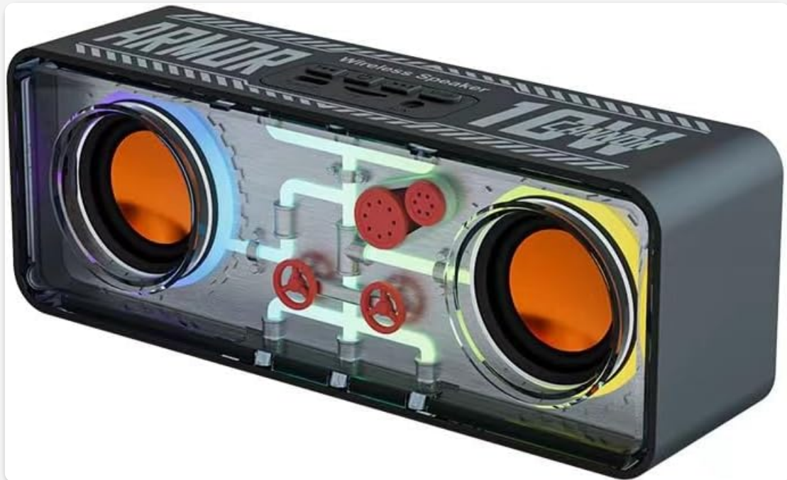
Image: The Wireless Bluetooth Speaker (Black model) with its transparent casing and illuminated internal components.

Thank you for purchasing the Generic Wireless Bluetooth Speaker. This speaker features dual acoustic units, vibrating film technology for deep bass, Bluetooth 5.3 connectivity, synchronized LED streamer lights, and support for TF card and FM radio. This manual provides detailed instructions for setup, operation, and maintenance to ensure optimal performance and longevity of your device.