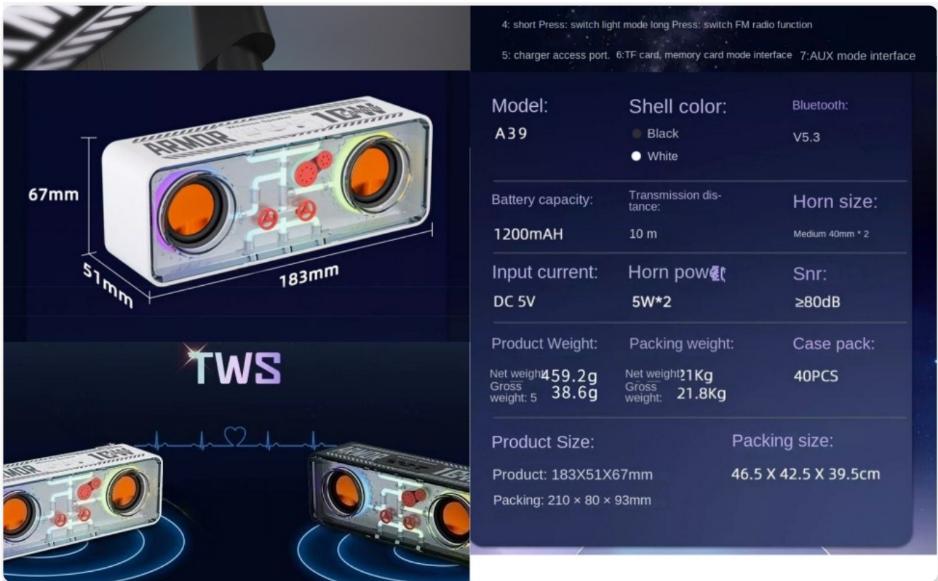
Image: Speaker dimensions and key technical specifications.