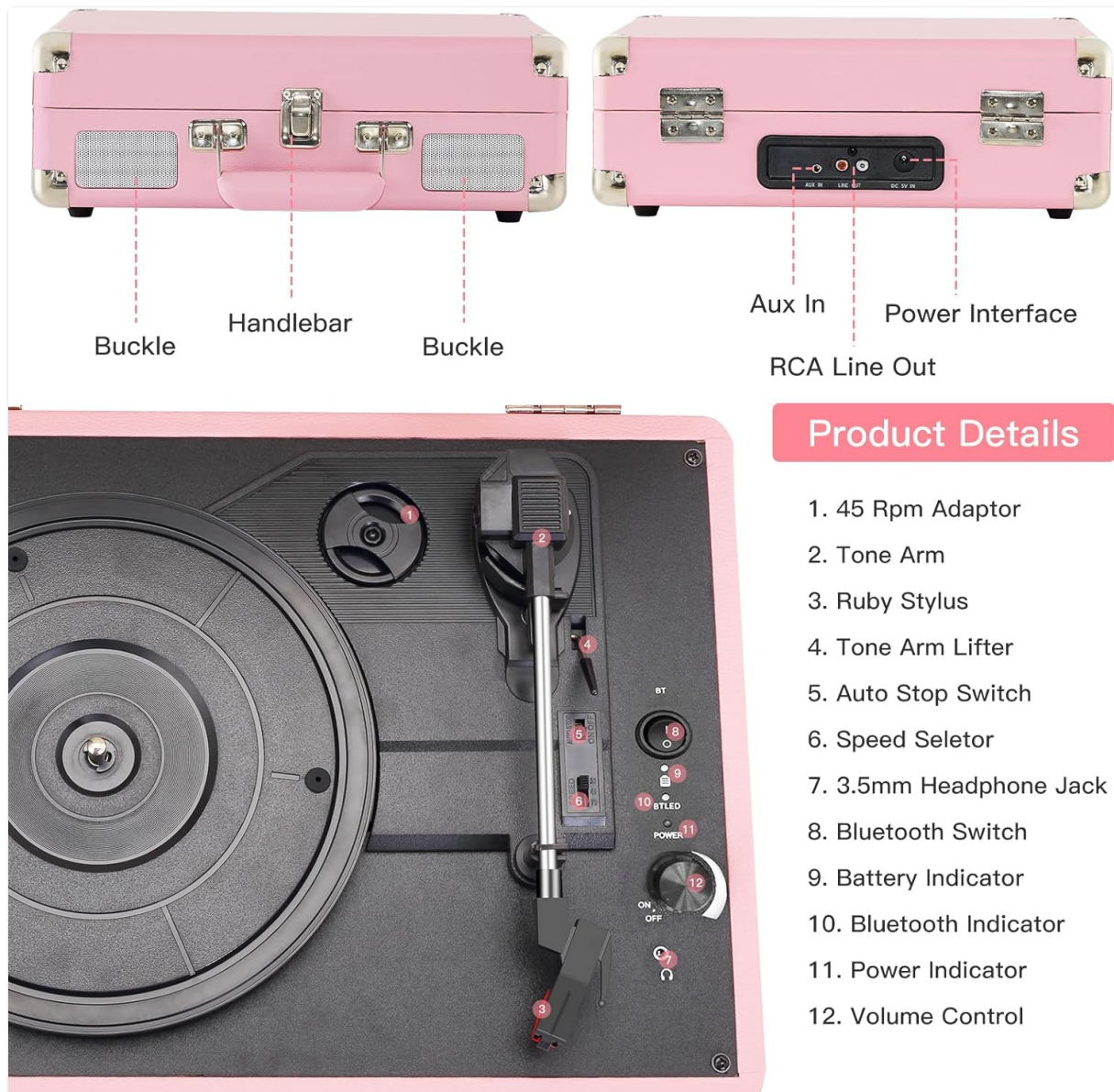
Figure 3.1: Product Details. This image highlights key components including the 45 RPM Adaptor, Tone Arm, Ruby Stylus, Tone Arm Lifter, Auto Stop Switch, Speed Selector, 3.5mm Headphone Jack, Bluetooth Switch, Battery Indicator, Bluetooth Indicator, Power Indicator, and Volume Control.