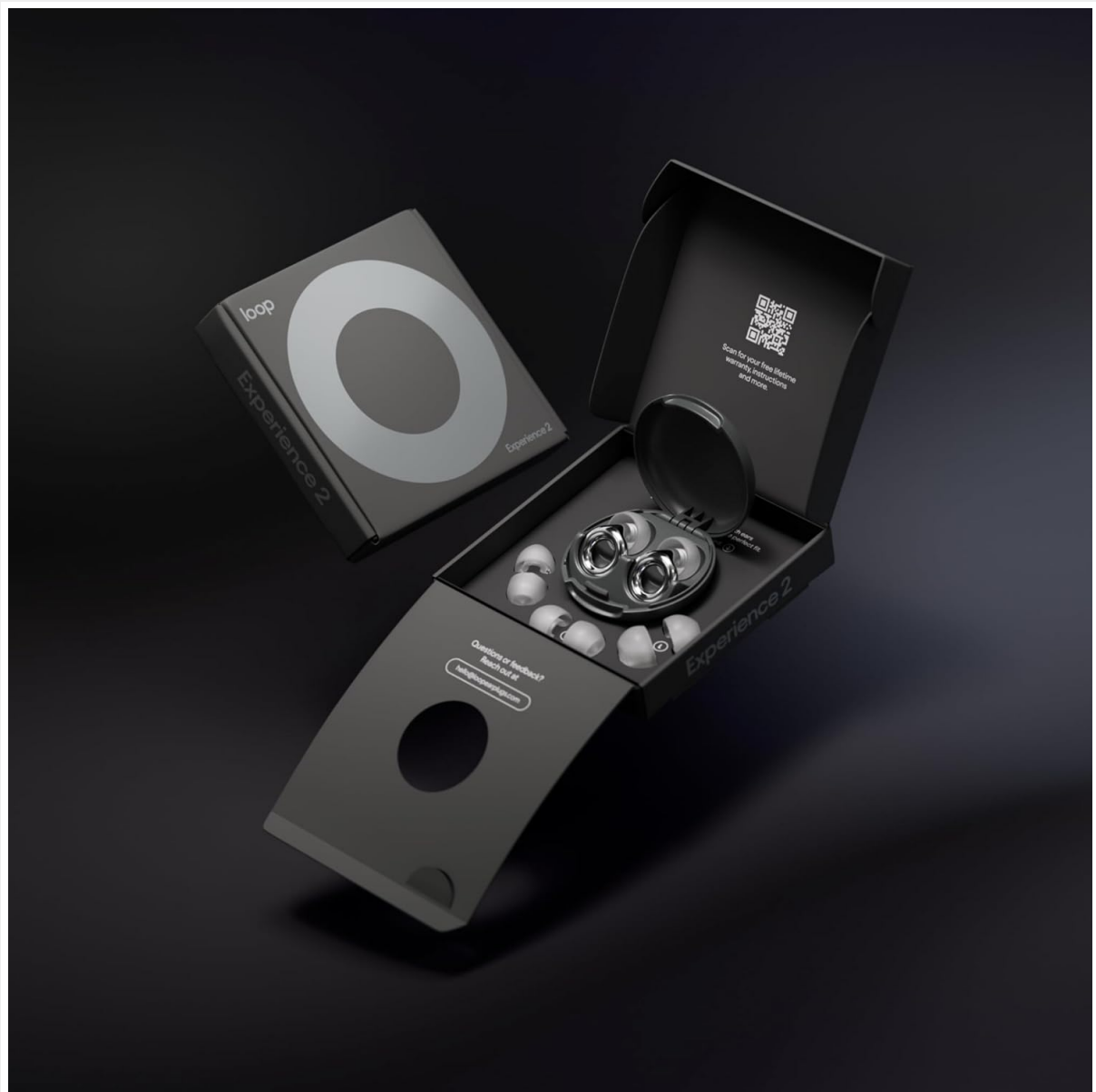
Figure 2.1: Contents of the Loop Experience 2 Ear Plugs package, including the earplugs, various ear tip sizes, and the carrying case.