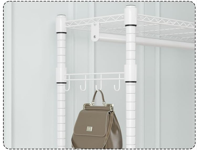
Double Side Hooks