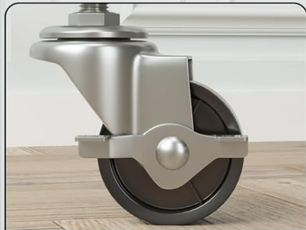
Wheels for mobility