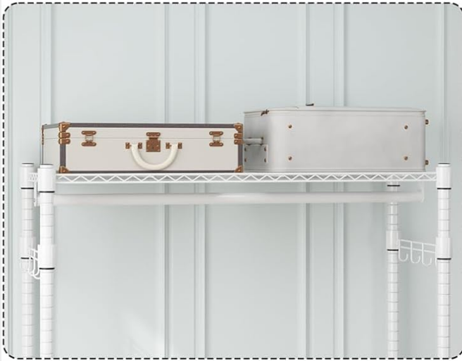
Extra Space on the Top