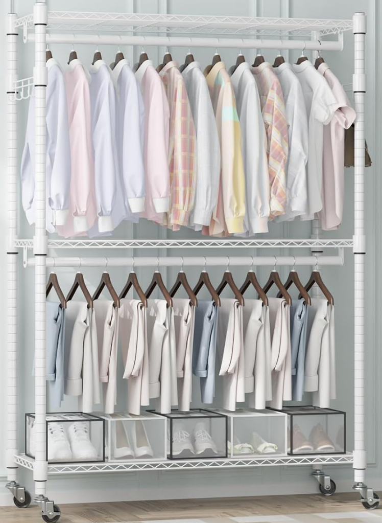
Figure 5: Wheels provide mobility, with lockable options for stability.