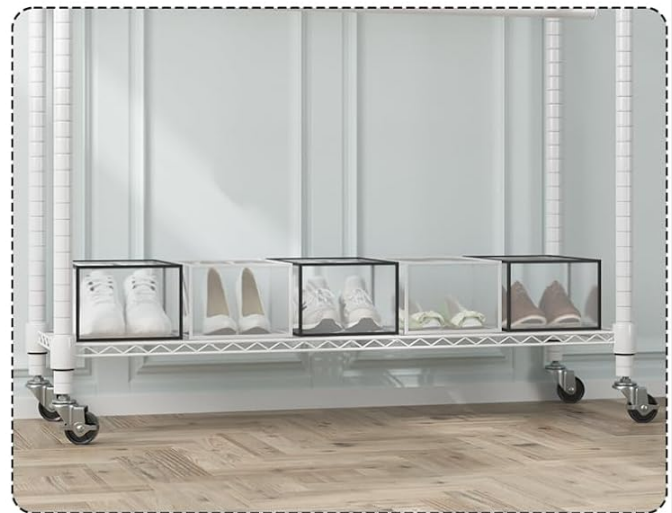
Sturdy Shoe Racks