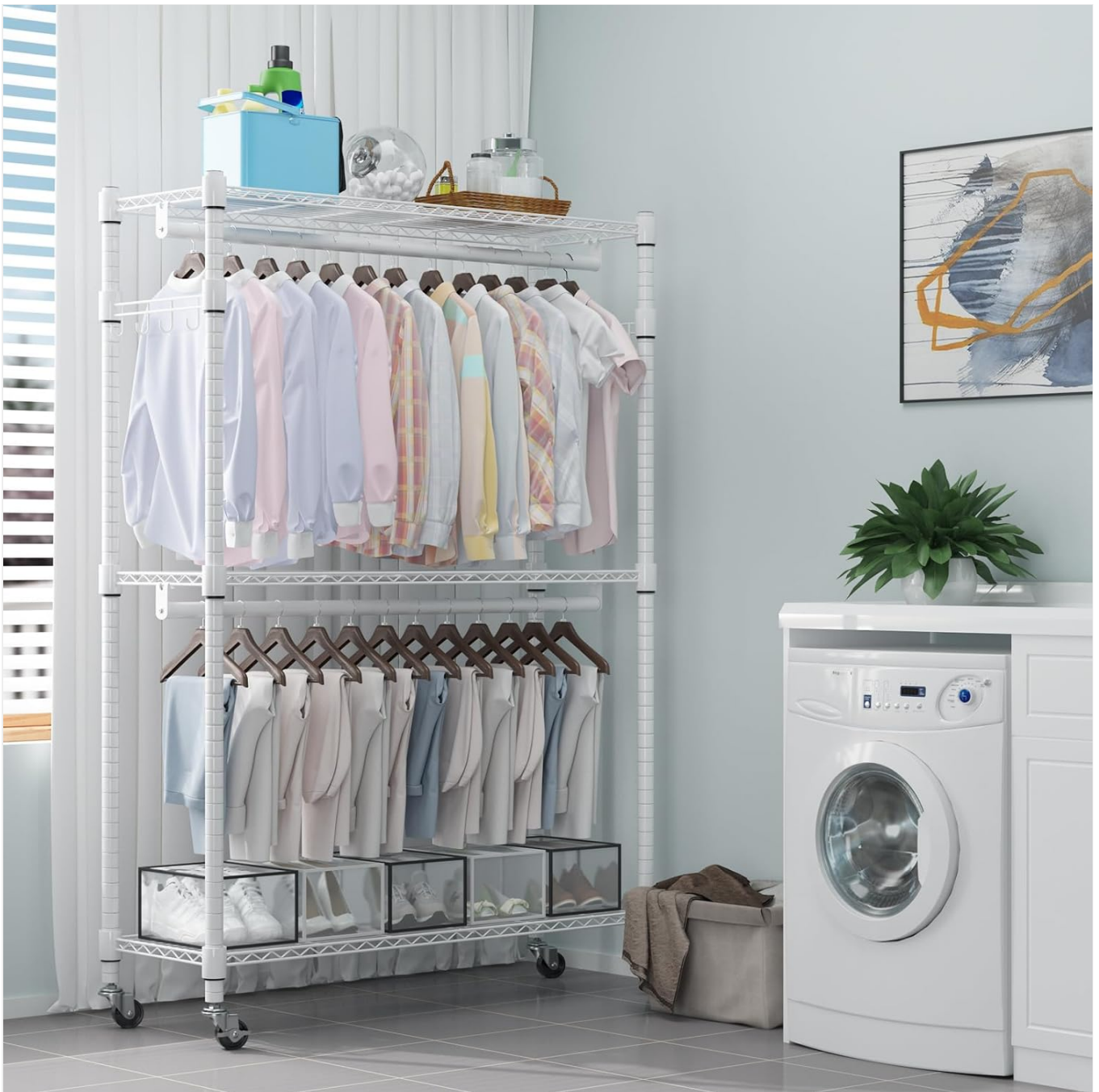
Figure 7: The garment rack is also suitable for laundry rooms.