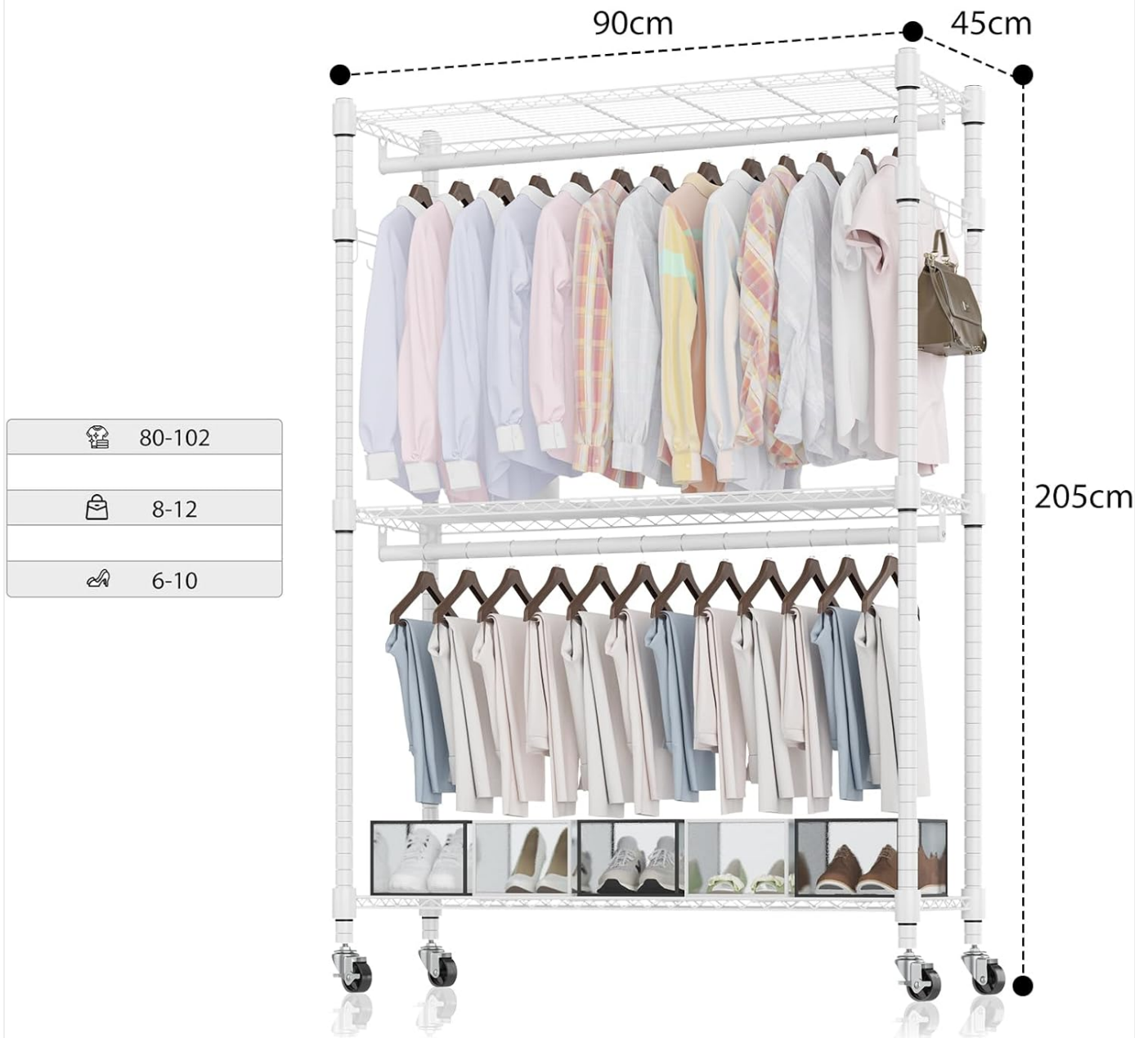
Figure 8: Product dimensions overview.