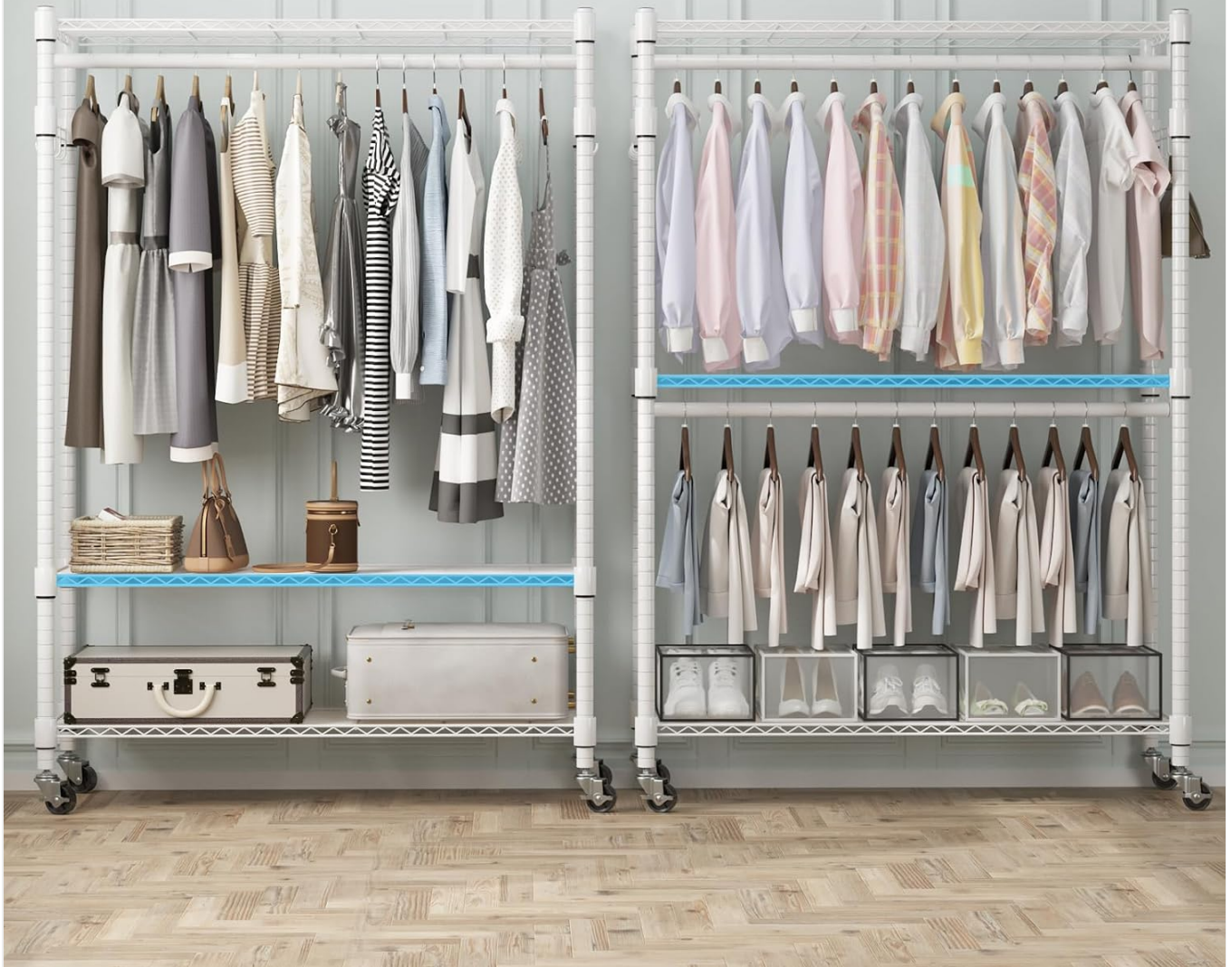
Figure 3: Adjustable storage shelves allow for customized organization.