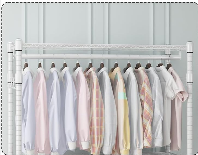
Double Hanging Rods