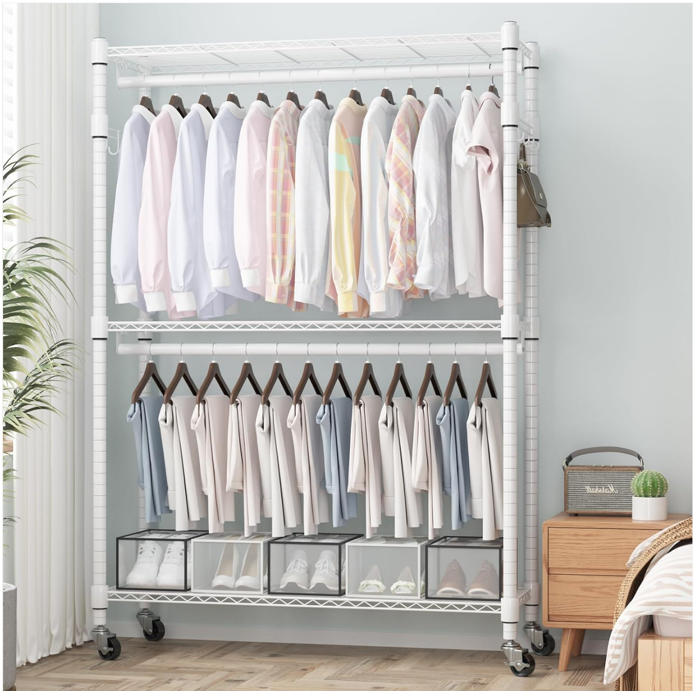
Figure 6: The garment rack seamlessly integrates into a bedroom environment.