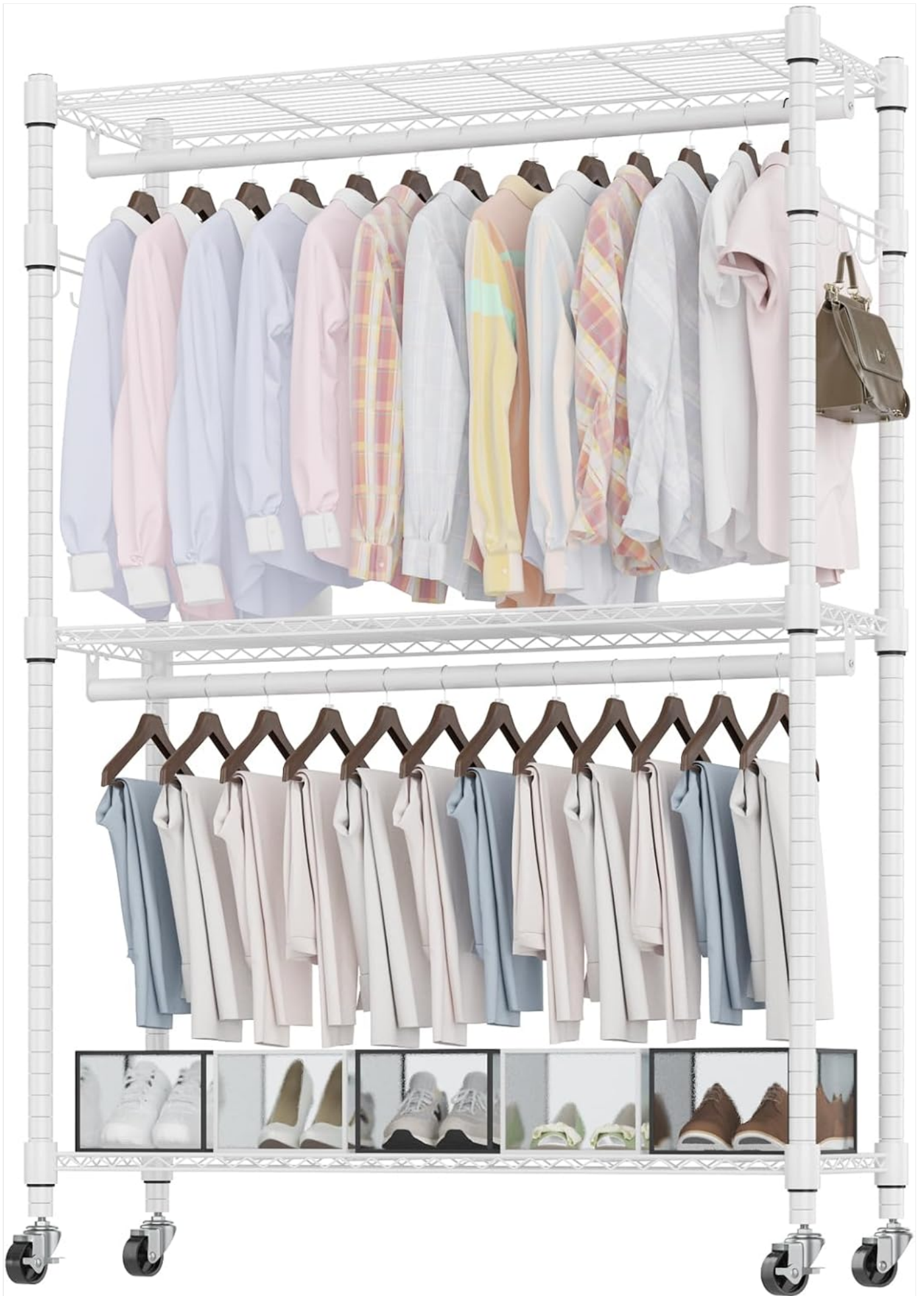
Figure 1: Fully assembled Himimi Double Rod Garment Rack.