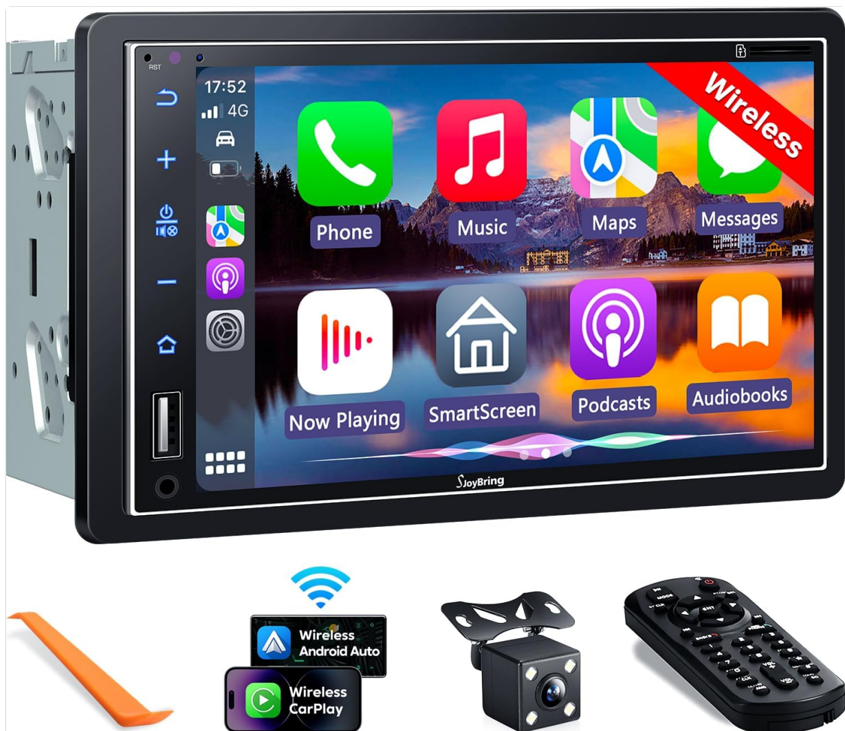
Image 1.1: Front view of the SJOYBRING car stereo displaying the CarPlay interface.