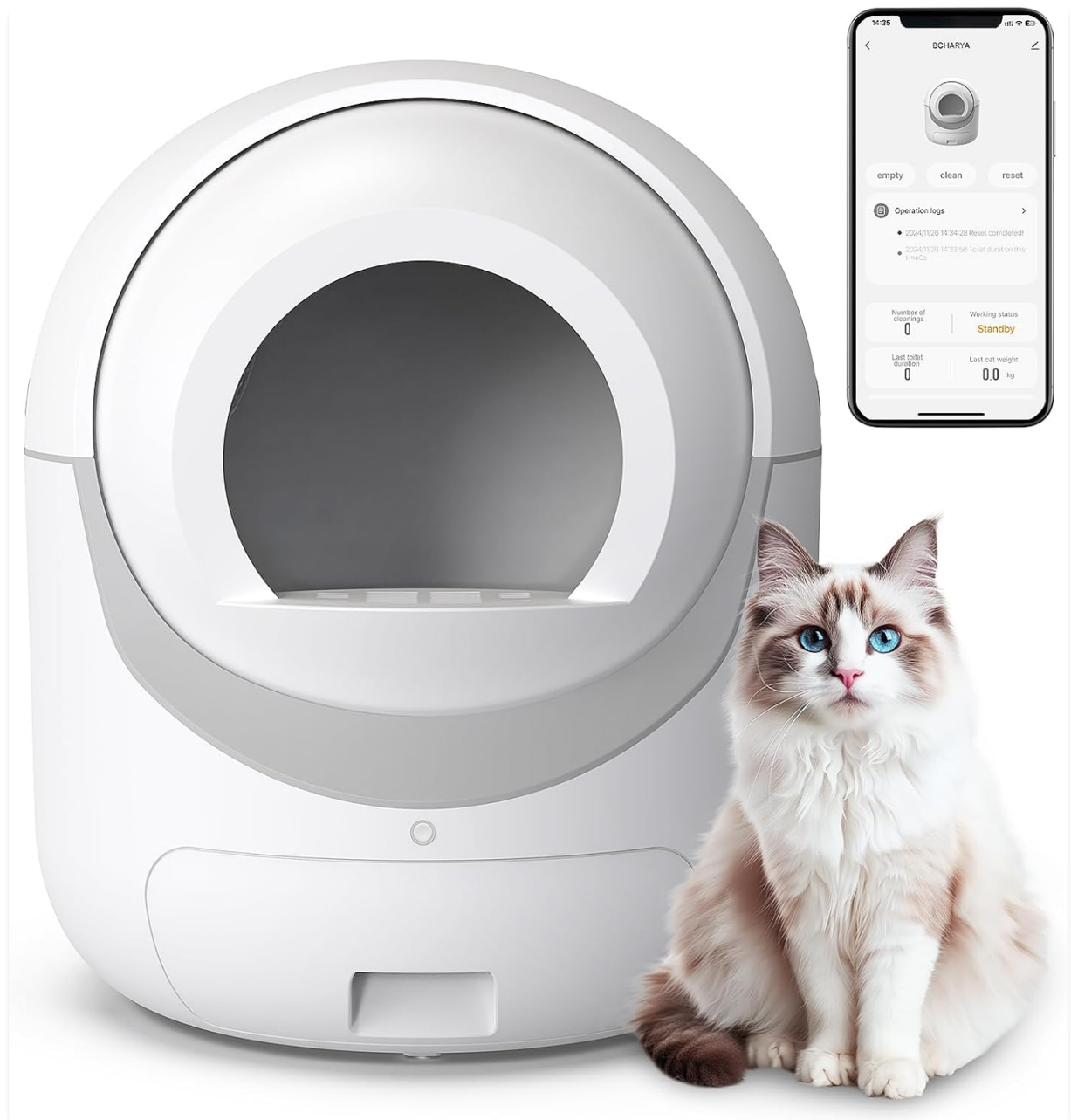
Figure 1.1: BCHARYA Self Cleaning Cat Litter Box. A white, spherical self-cleaning cat litter box with a cat sitting beside it, and a smartphone displaying the control app.