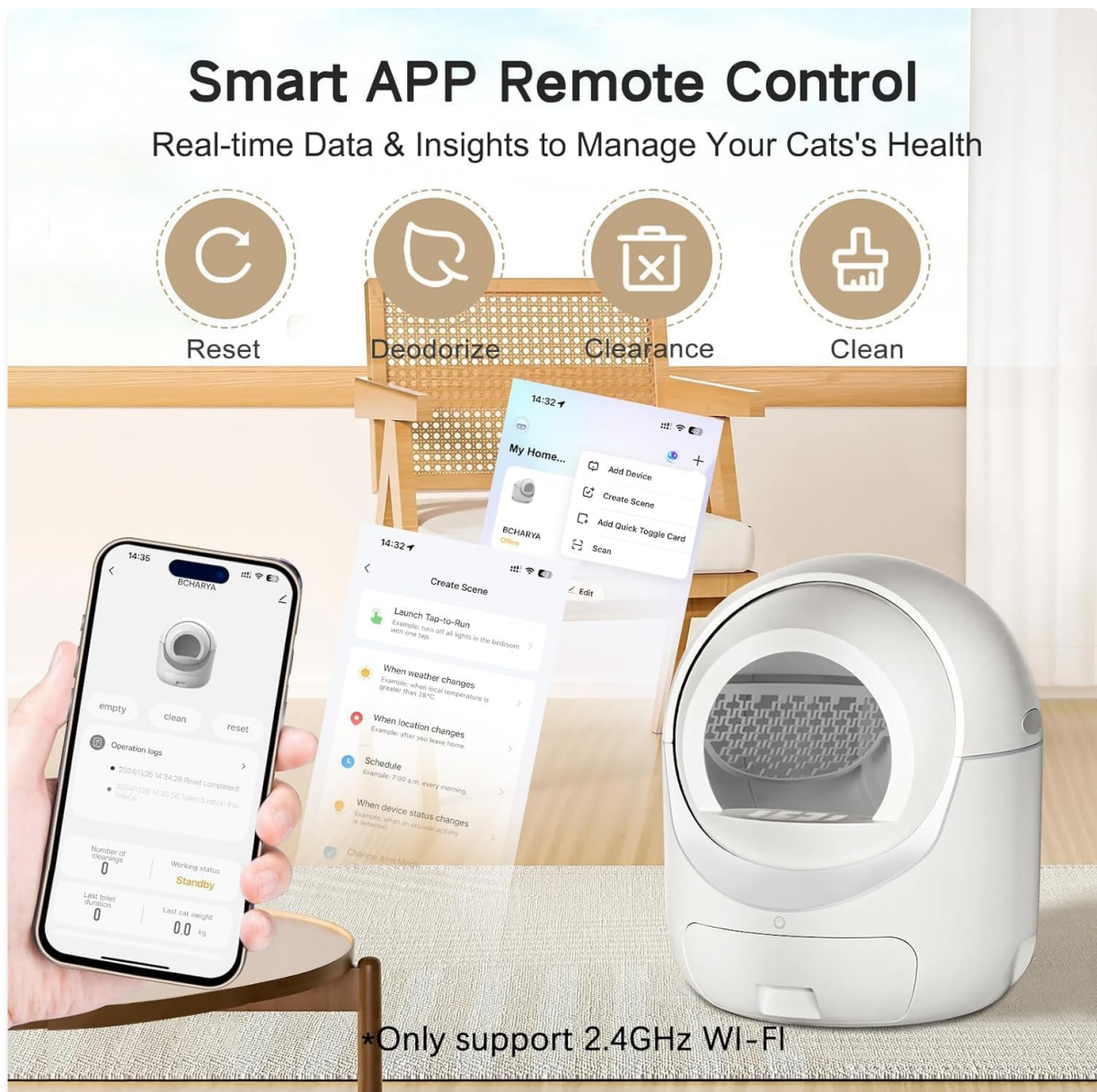
Figure 5.1: Smart APP Remote Control. A smartphone screen showing the litter box control application with options for Reset, Deodorize, Clearance, and Clean. The app allows real-time data and insights to manage cat health.