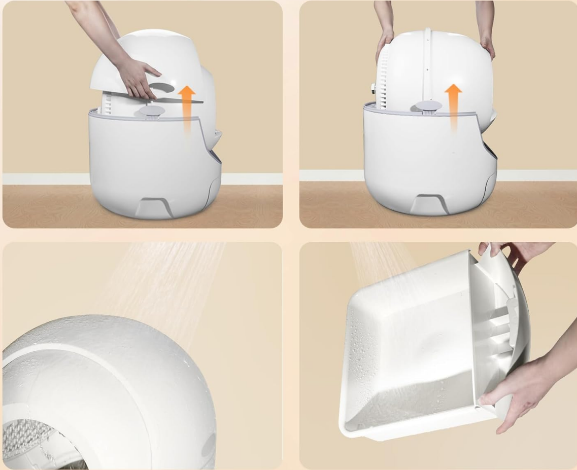
Figure 6.1: Detachable and Washable Design. A series of images demonstrating how the litter box components can be detached and washed, including removing the cover and drum, and rinsing them with water.

It can be removed in just a few steps and can be directly washed with water.