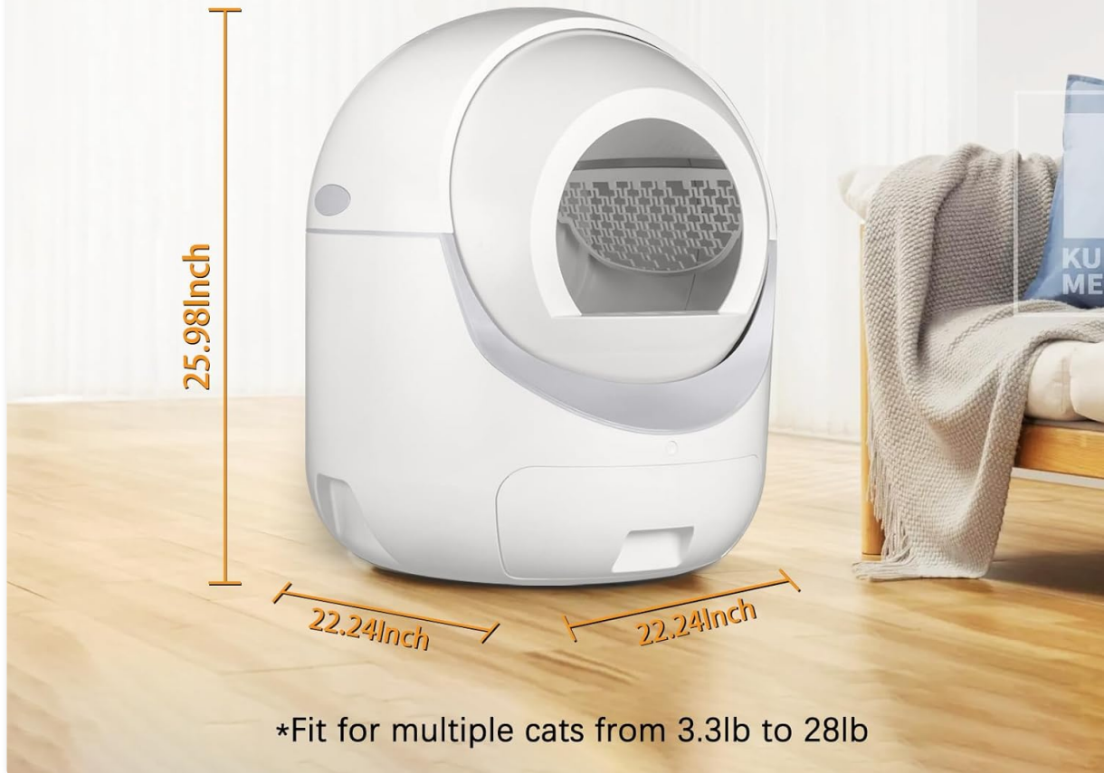
Figure 4.1: Product Dimensions. An image illustrating the dimensions of the litter box: 25.98 inches in height and 22.24 inches in both length and width, highlighting its extra-large capacity suitable for multiple cats.

70L drum space, 10L drawer capacity. Up to 15-25 days of free scooping, allowing you peace time to travel.