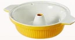
1.5L Ceramic Pot