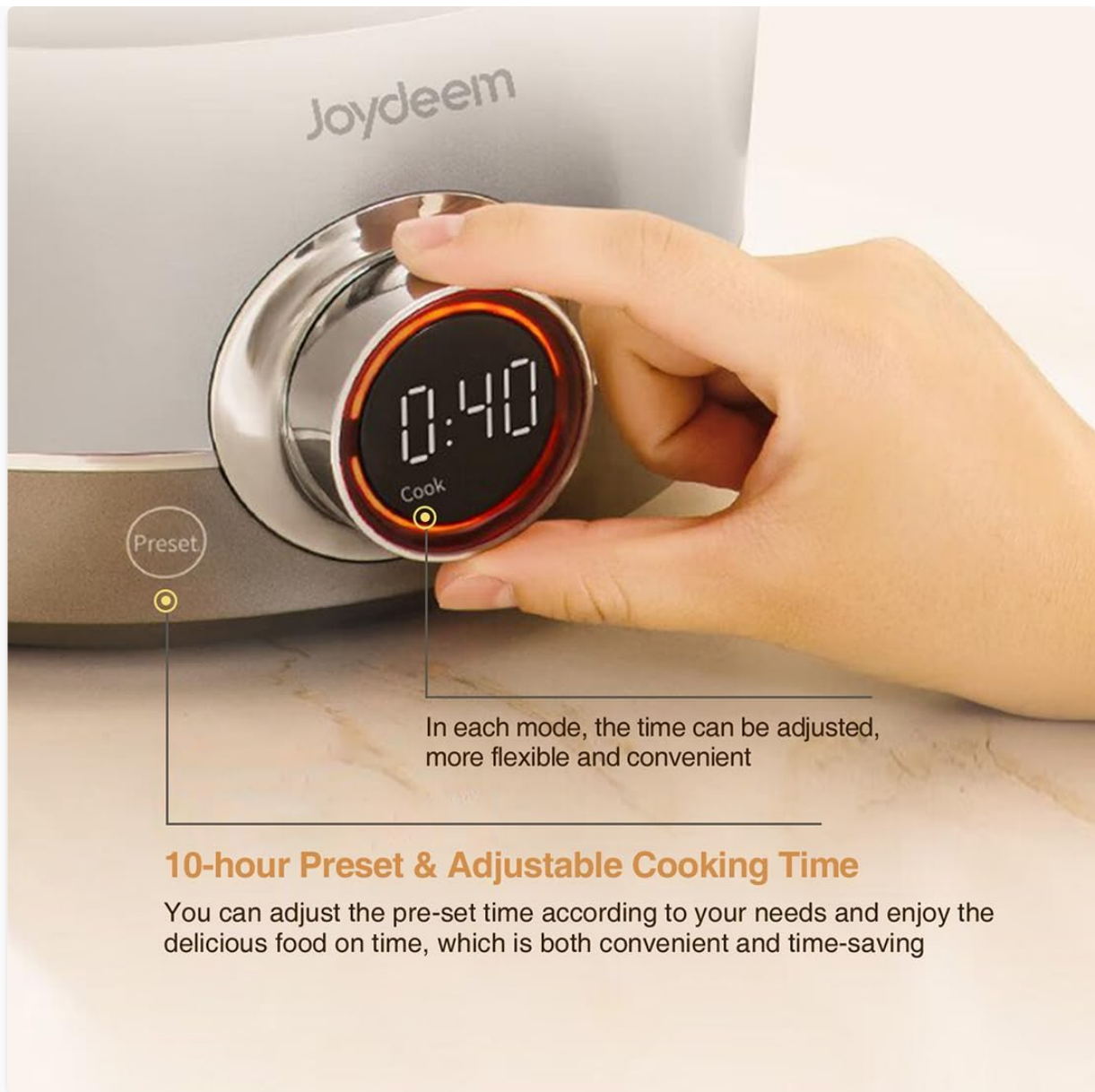
Image 5.1: Control panel with preset and adjustable cooking time features.