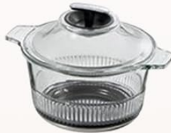
2L Soup Pot