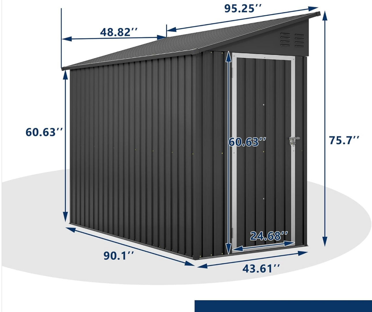
Image: A diagram illustrating the precise dimensions of the shed, including height, width, and depth, crucial for planning its placement.