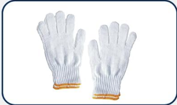
■ 2 Pairs of Gloves