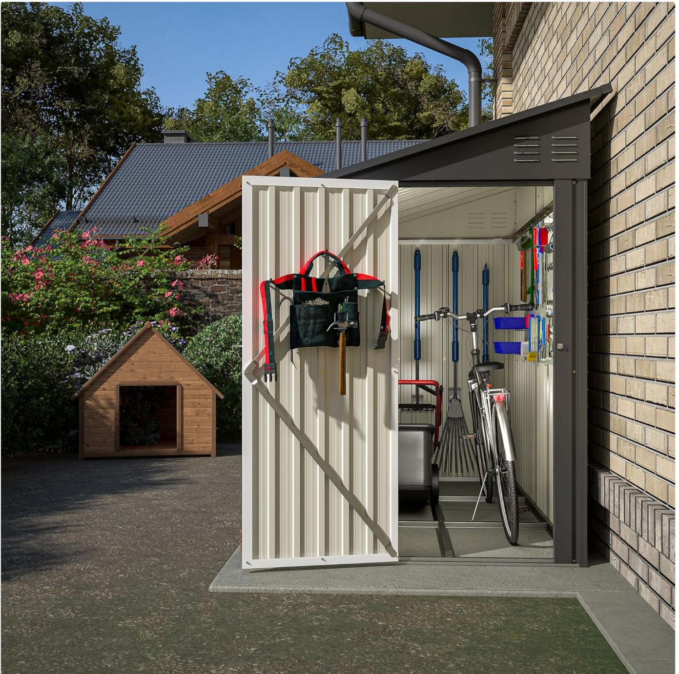
Image: An interior shot of the shed, illustrating its capacity to store various items like tools and a bicycle, with a clear view of the internal structure.