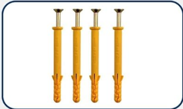
■ 4 Expansion Screws