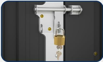
■ 1 Lock