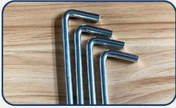
■ 4 Ground Nails