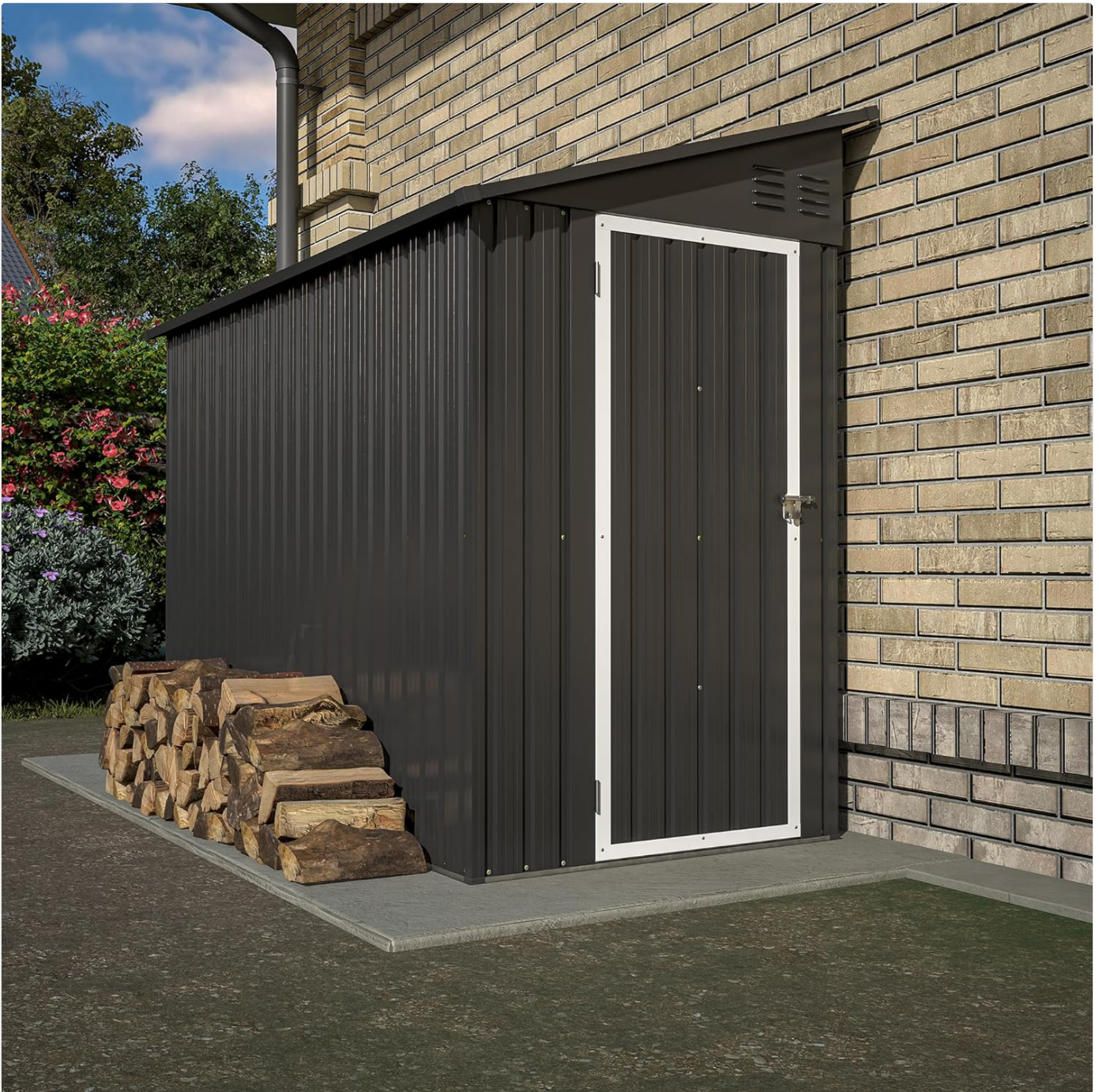
Image: The LZBEITEM 4x8ft Lean-to Storage Shed, showcasing its compact design and placement against a building wall, with firewood stacked nearby.