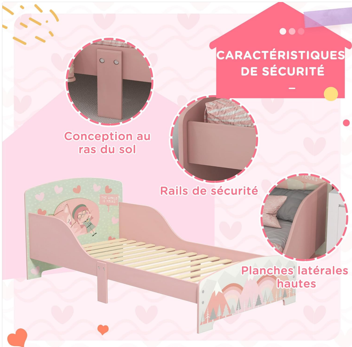
Image: Close-up view of the bed's construction, highlighting the secure attachment points of the side rails and the low-to-ground design.

Warning: Do not use power tools for assembly as this may damage the wood or strip screws.