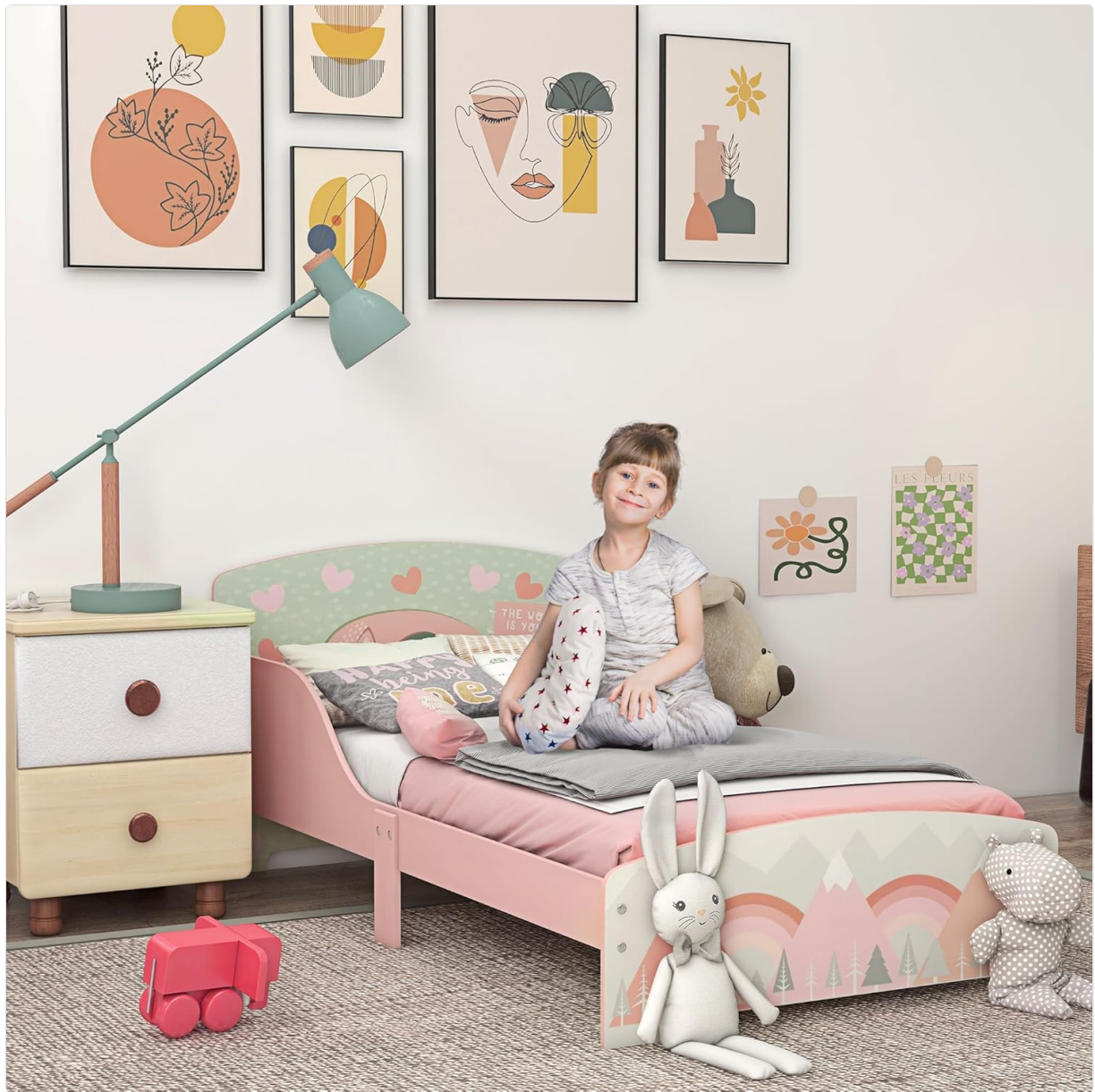
Image: A child sitting comfortably on the assembled ZONEKIZ Children's Floor Bed, demonstrating its low profile and accessibility.