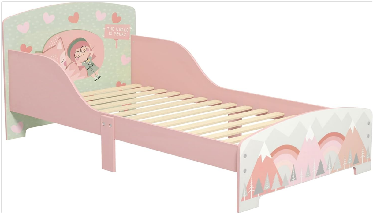
Image: A complete view of the ZONEKIZ Children's Floor Bed, showcasing its design and color.