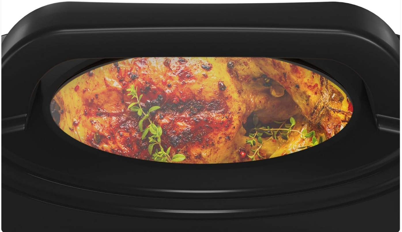
Figure 5: The self-basting lid helps retain moisture during cooking.