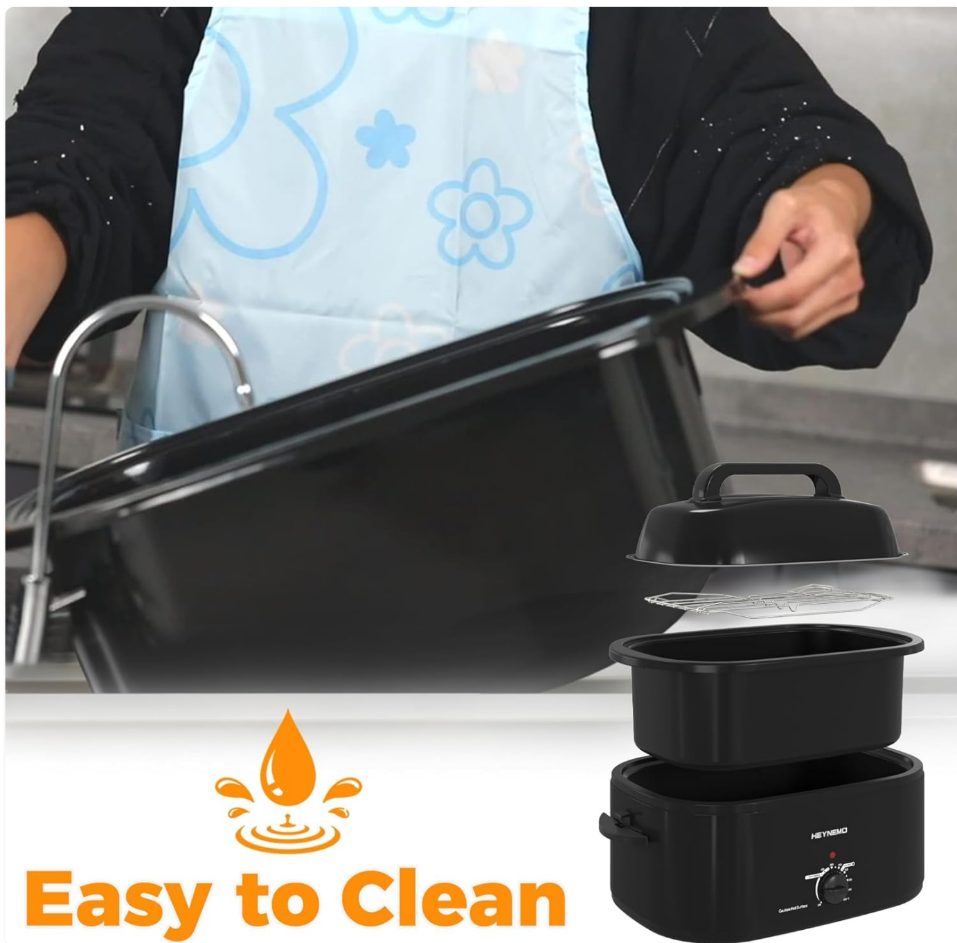
Figure 8: Easy cleaning of the removable pan.