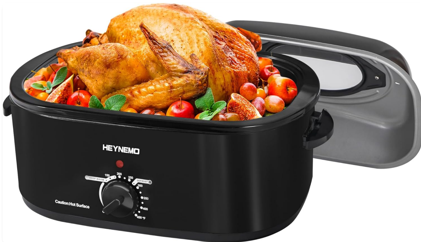
Figure 1: HEYNEMO 24QT Electric Roaster Oven with a roasted turkey.

Thank you for choosing the HEYNEMO 24QT Electric Roaster Oven. This appliance is designed to provide efficient and versatile cooking for various dishes, including roasting, baking, and slow cooking. Please read this manual thoroughly before first use to ensure safe operation and optimal performance.