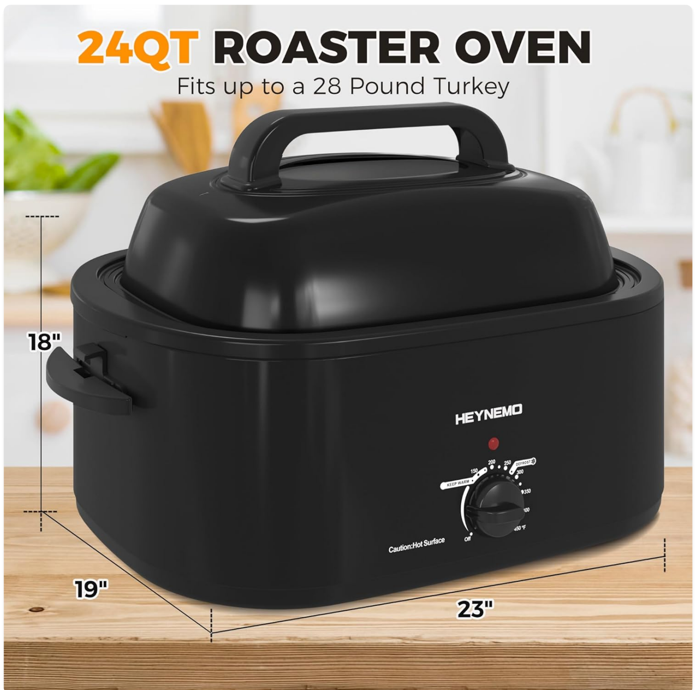
Figure 9: Product dimensions for the 24QT model.