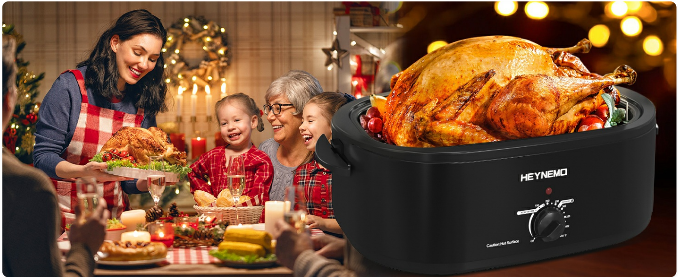
Figure 4: Illustration of using the defrost function for a turkey.