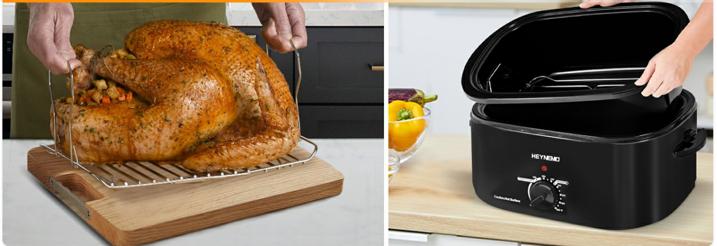
Figure 6: Overview of Defrost, Roast, and Keep Warm settings.