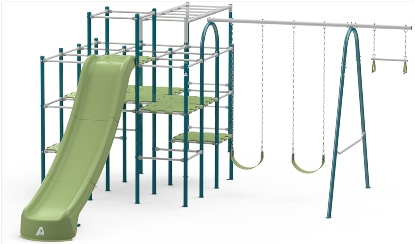
Image: The complete ACTIVPLAY Modular Jungle Gym Set, Lower Kit 1, showcasing its various play elements including the jungle gym structure, slide, monkey bars, and swing set.

Welcome to the ACTIVPLAY Modular Jungle Gym Set, Lower Kit 1. This outdoor playset is designed to provide a safe, engaging, and customizable play experience for children. Featuring a robust, rust-resistant steel frame, adjustable play platforms, and safety-focused design elements like no-pinch joints, this playset encourages active play and imaginative adventures in your backyard.