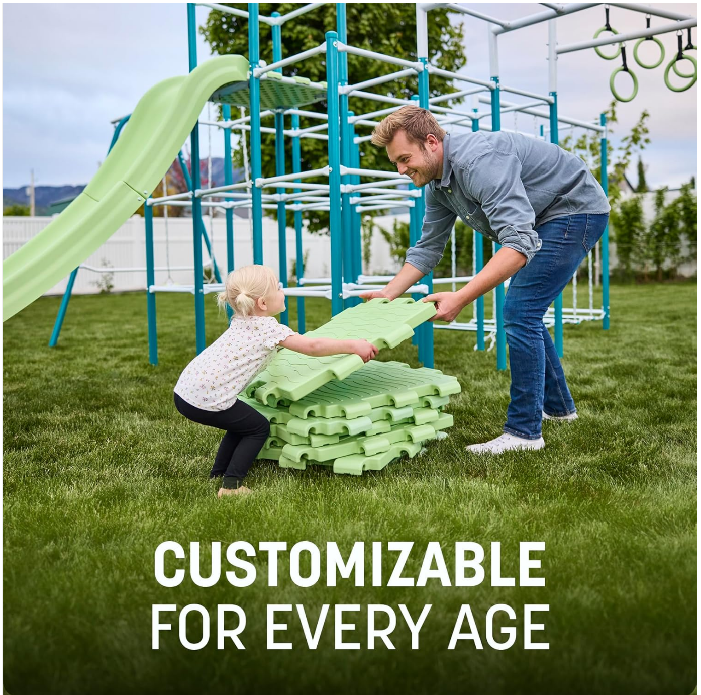
Image: An adult and child demonstrating the adjustability of the platforms, highlighting the "Customizable for Every Age" feature.