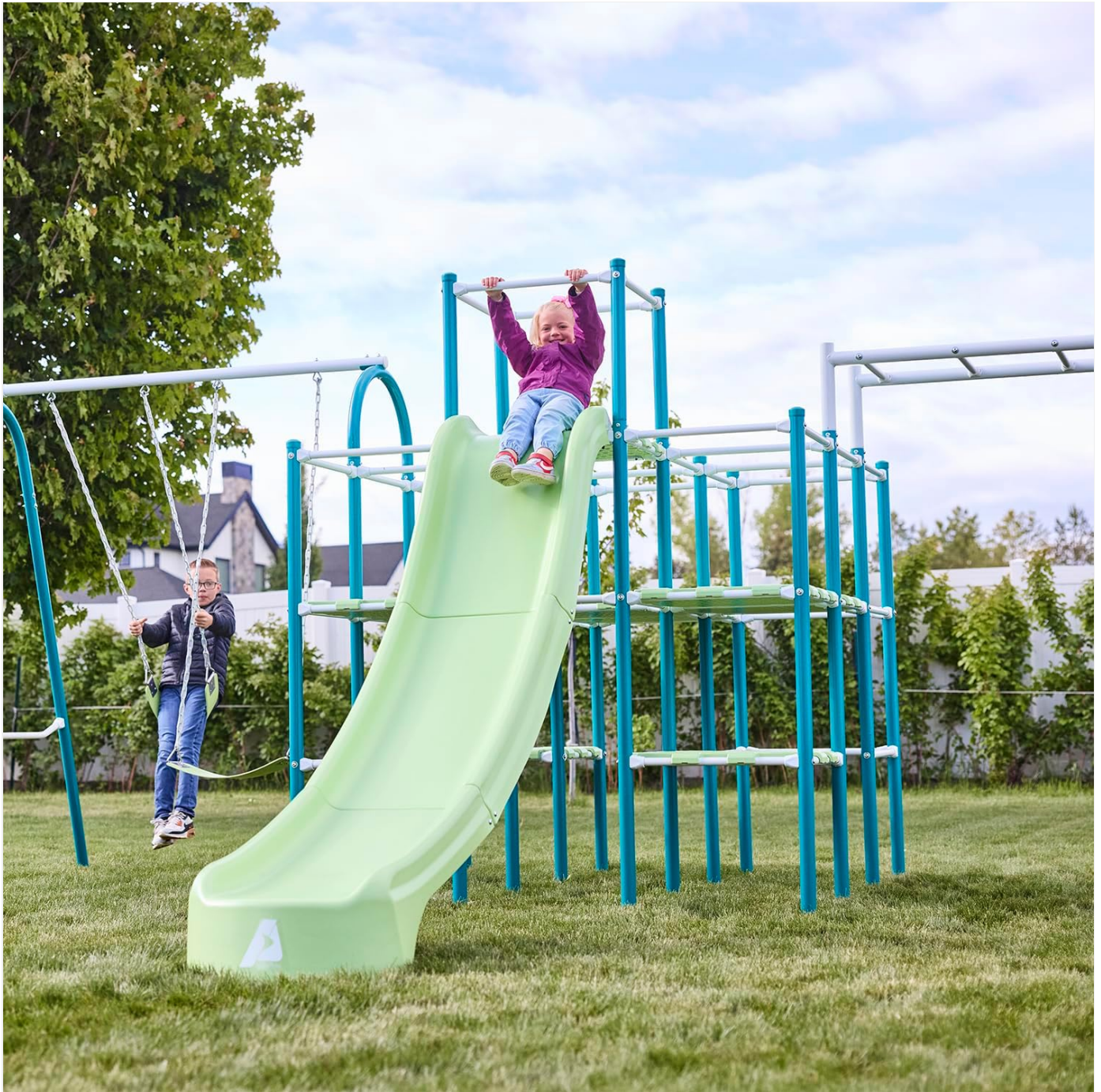
Image: Children actively using the slide and swing components of the playset.