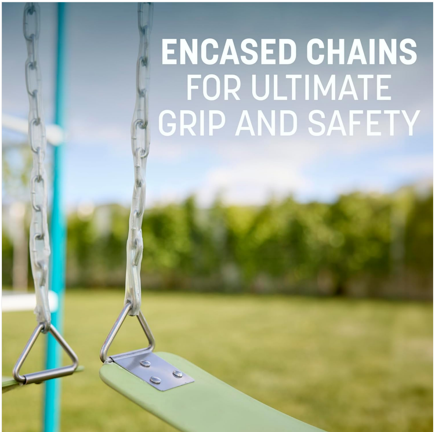
Image: Detail of the swing chains, showing the protective encasing designed for enhanced grip and safety.