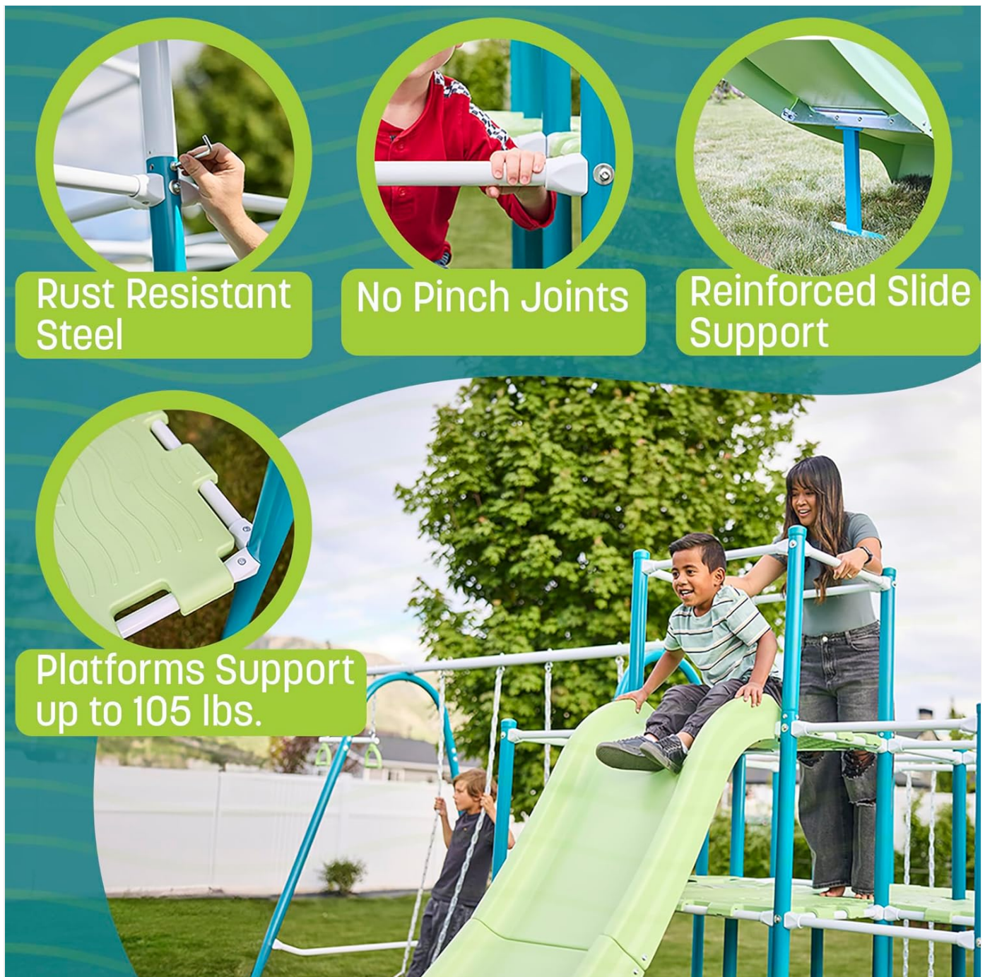
Image: Visual representation of key safety features including rust-resistant steel, no-pinch joints, reinforced slide support, and the weight capacity of the platforms.