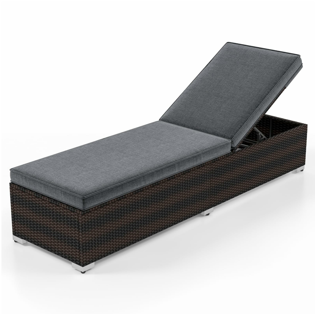
Image: The Tangkula Outdoor Chaise Lounge, featuring a brown wicker base and a gray cushion, positioned on a patio.