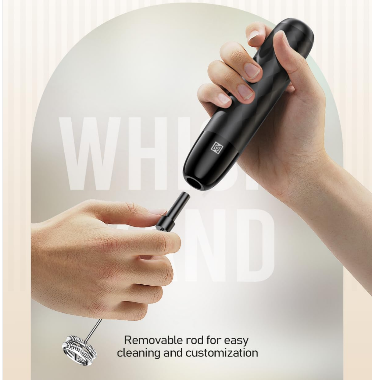
Figure 4: Frothing with ease.