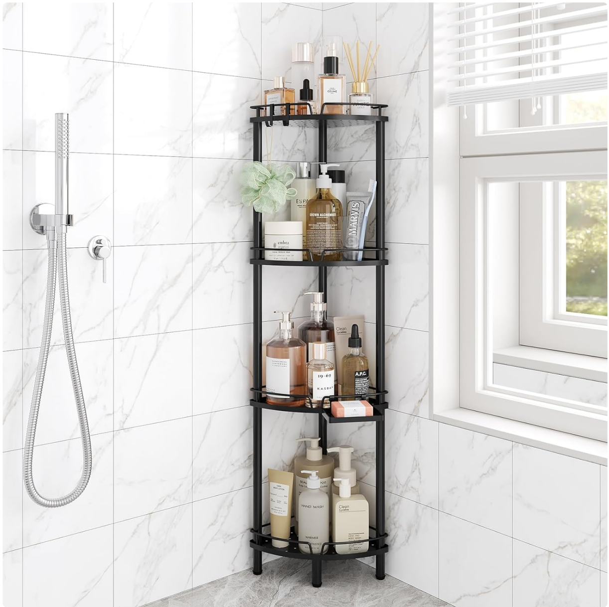
Image: ELYKEN 4-Tier Corner Shower Caddy in use.