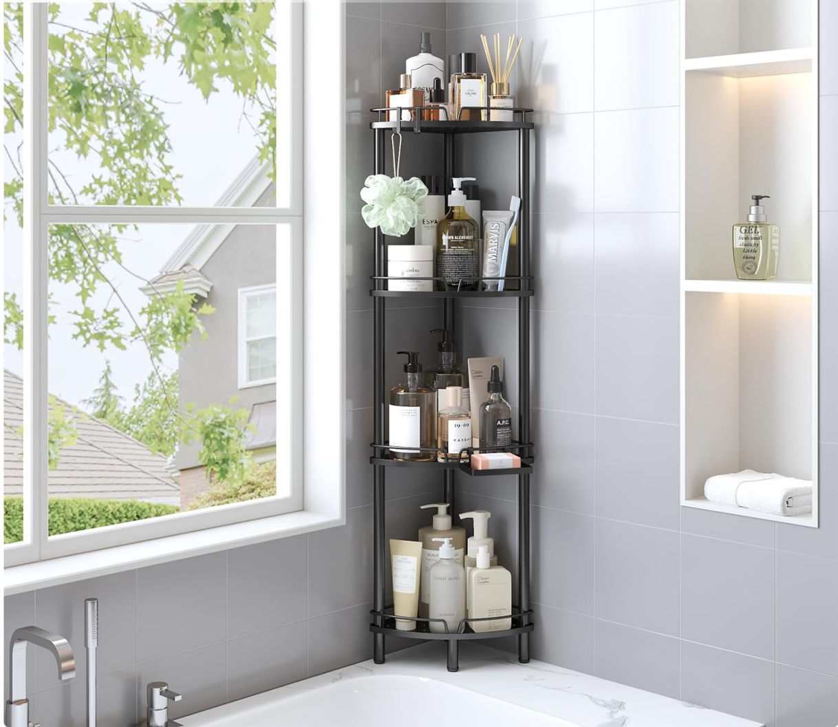
Image: Hollow design for efficient drainage.

Please verify dimensions for compatibility with smaller bathtubs