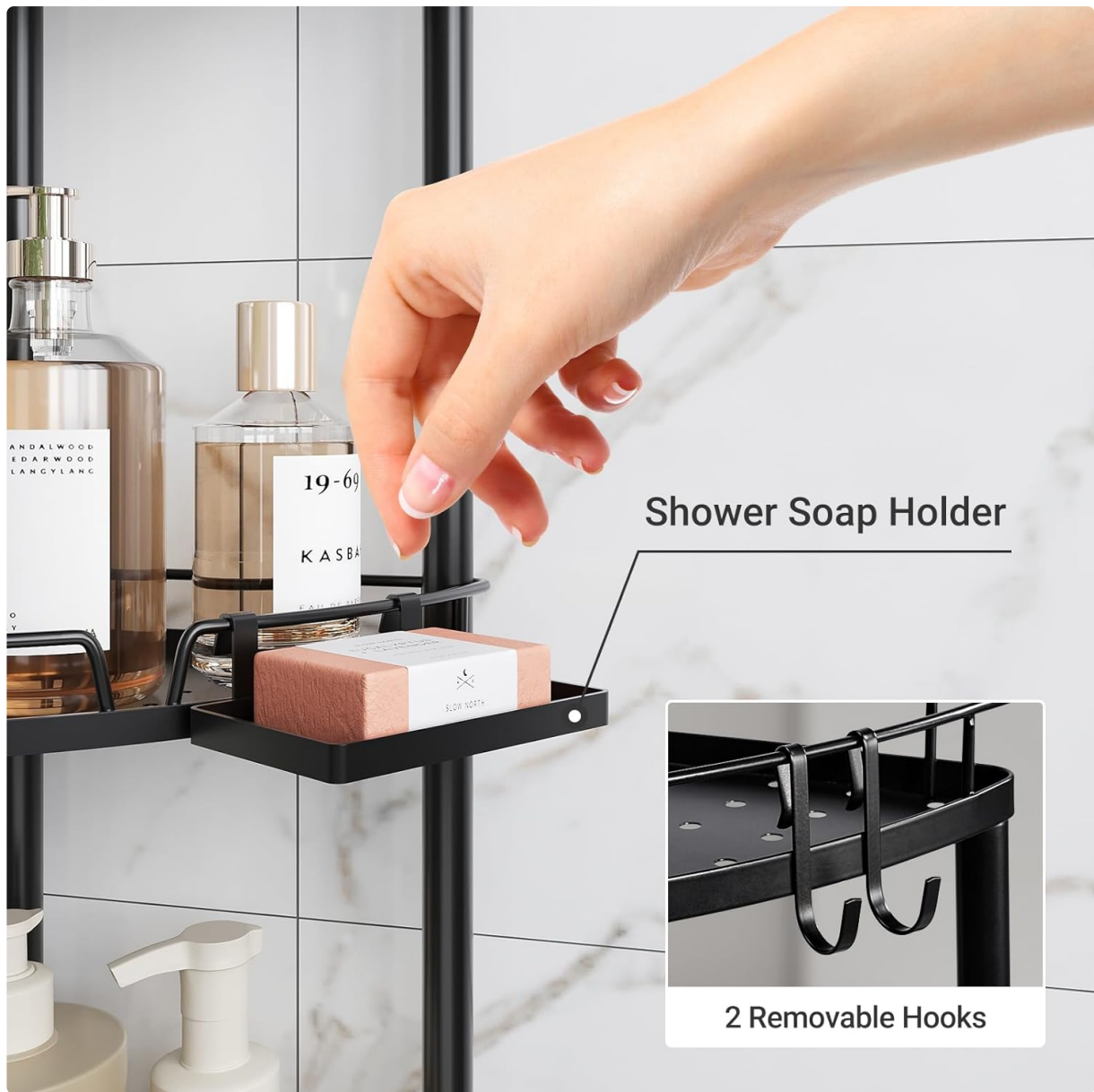
Image: Detachable soap holder and removable hooks.