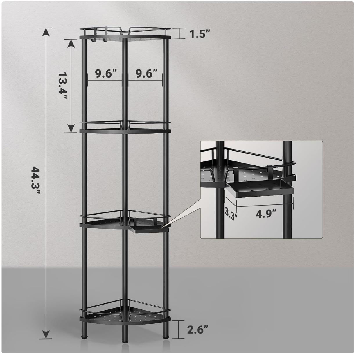
Image: Product dimensions and assembly reference.