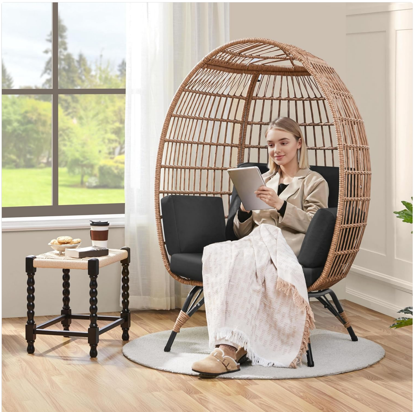
Image: A woman comfortably seated in the egg chair inside a room, highlighting its versatility for indoor use.