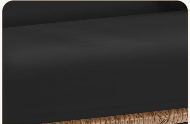
3.5" Thick Back Cushion