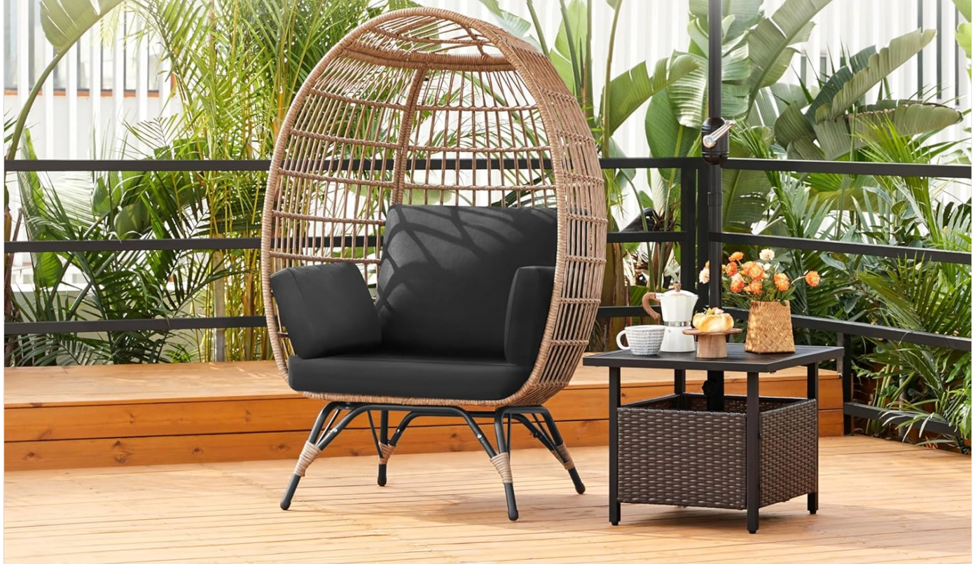
Image: The egg chair positioned in an outdoor garden, demonstrating its suitability for various outdoor living spaces.