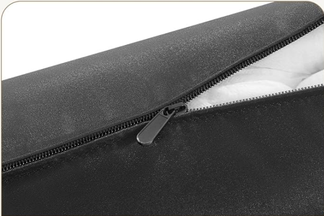
Zippers for Easy Maintenance