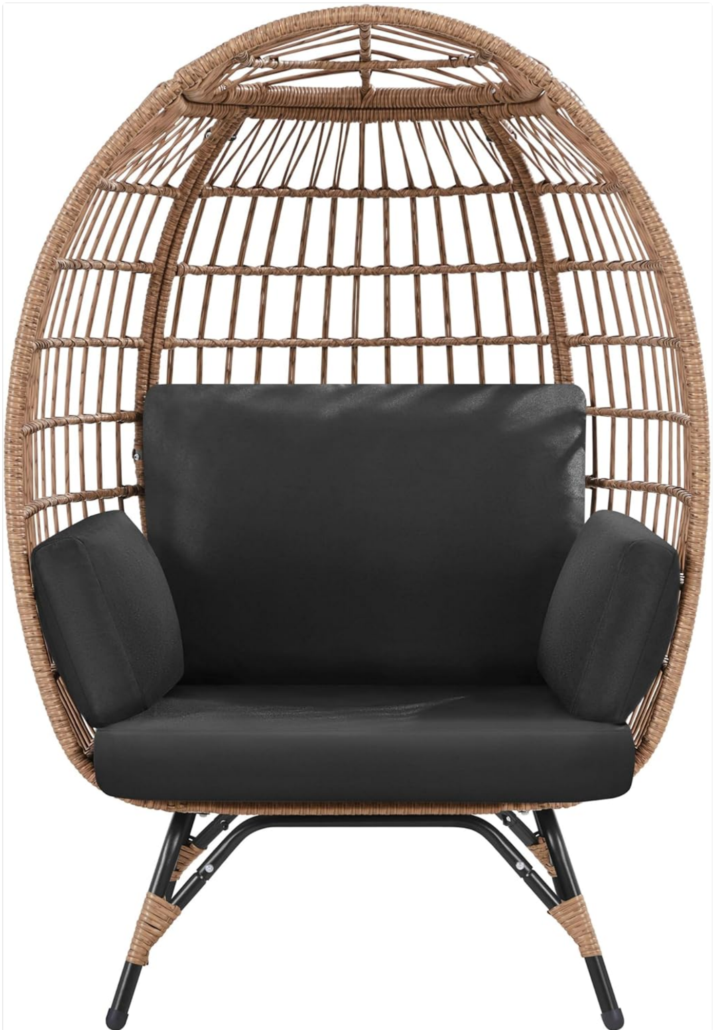
Image: Front view of the Yaheetech Egg Rattan Chair with black cushions, showcasing its unique egg shape and sturdy design.