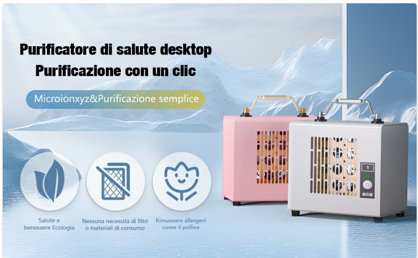
Figure 2: The Microionxyz A02 effectively targets dust, general impurities, pollen, and pet odors.