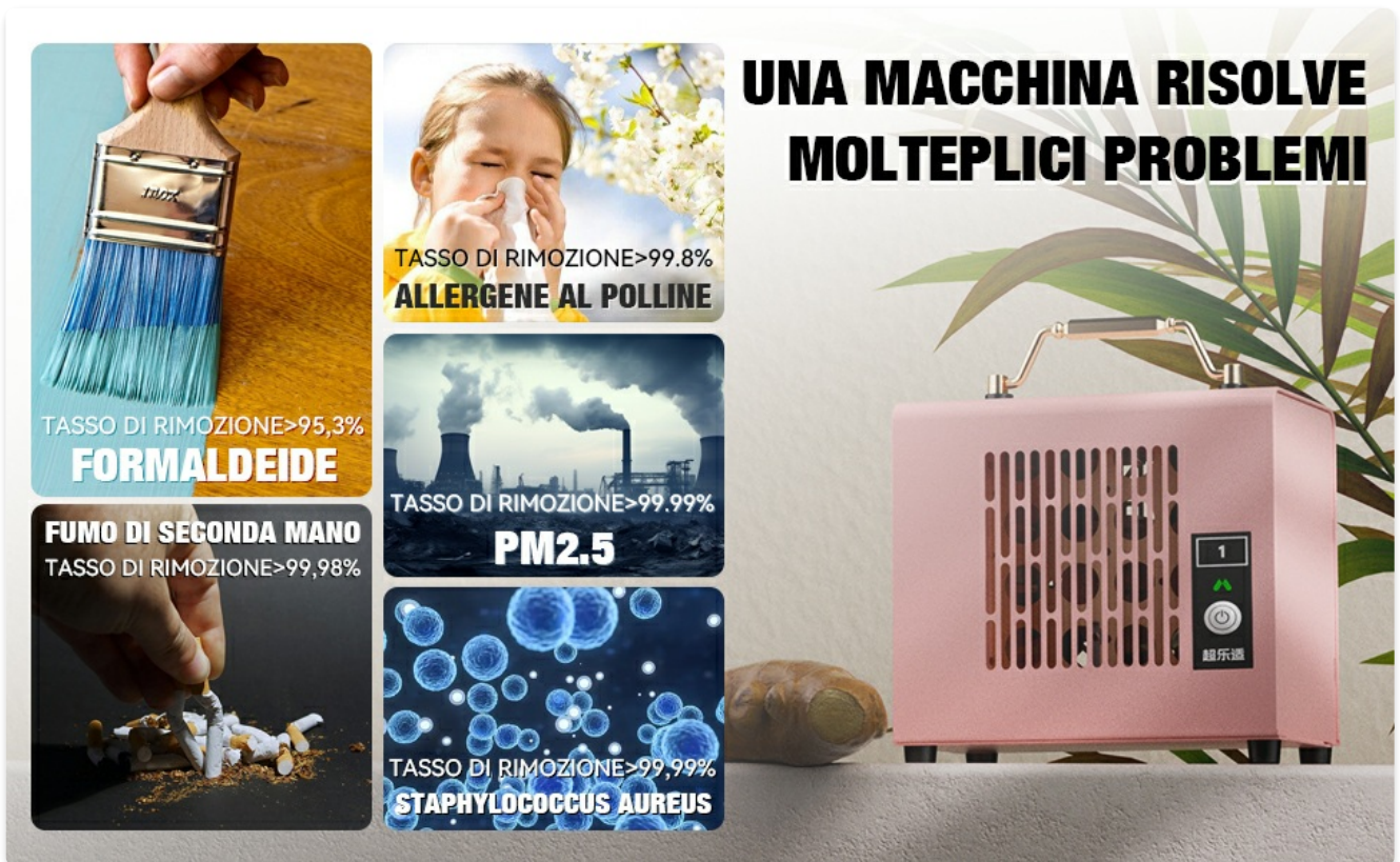
Figure 4: Illustration of how negative ions interact with and neutralize airborne pollutants for purification.