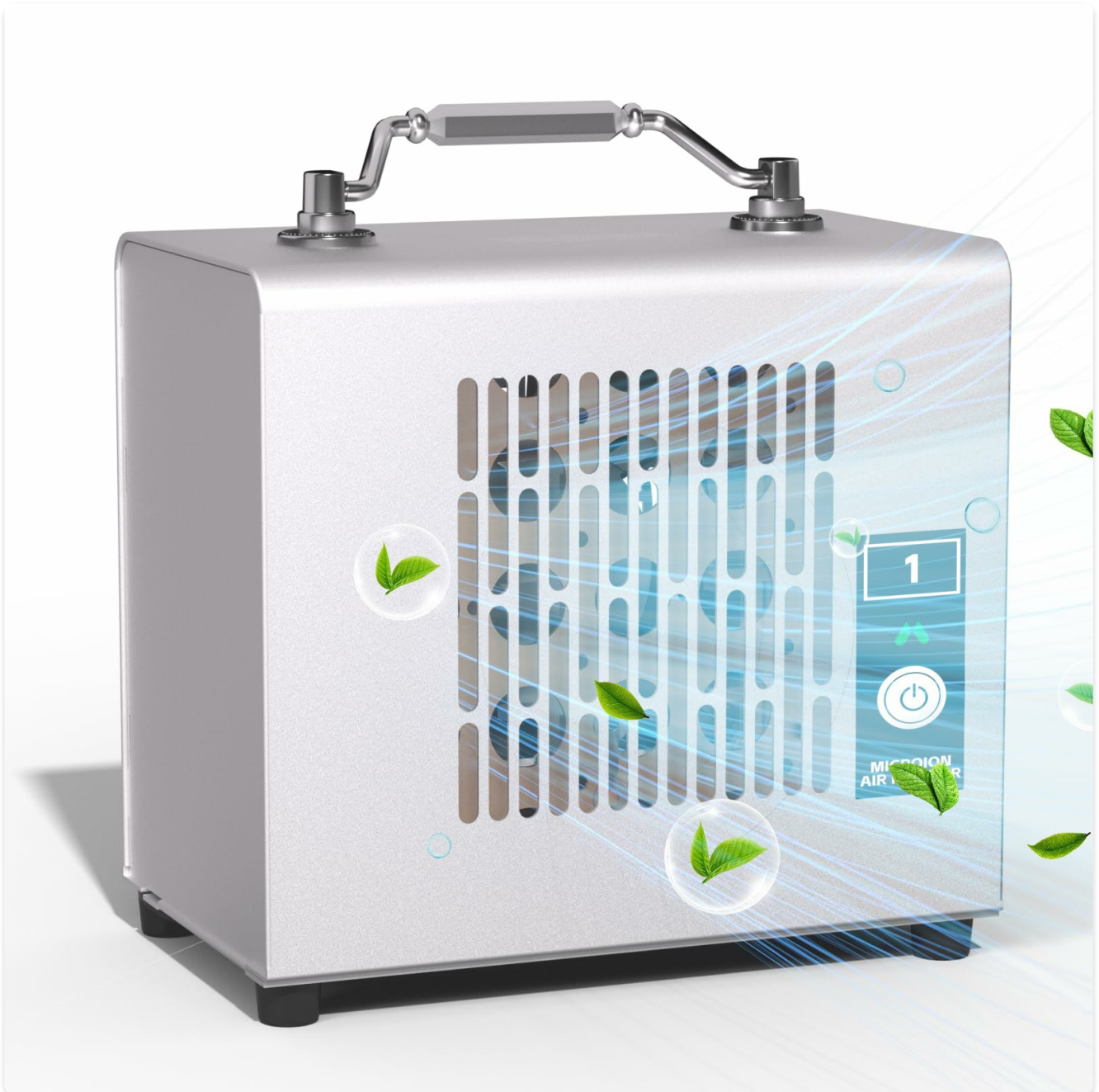
Figure 1: Microionxyz Anion Plasma 2-in-1 Air Purifier (Silver Model A02).