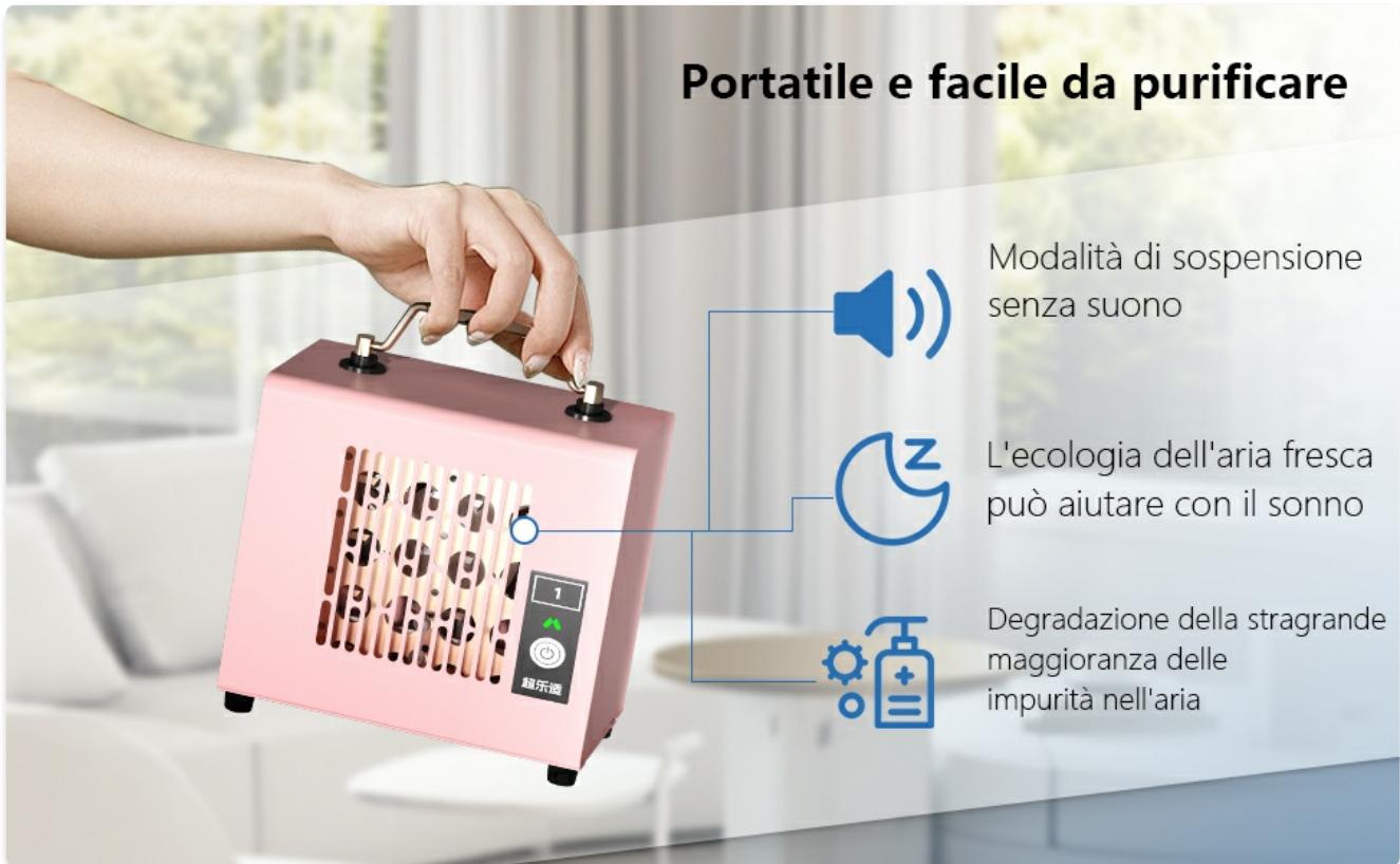
Figure 7: The Microionxyz A02 Air Purifier meets CE and FCC compliance standards.