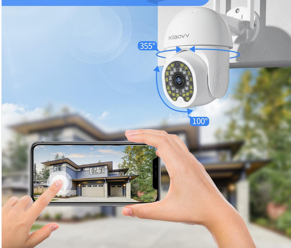
Figure 4.1: The camera mounted, demonstrating its pan (355°) and tilt (100°) range for broad coverage.

Everything is in your control, Never miss a thing