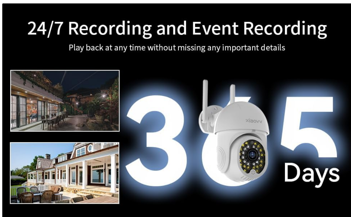
Figure 5.3: The camera supports continuous recording, ensuring constant surveillance.