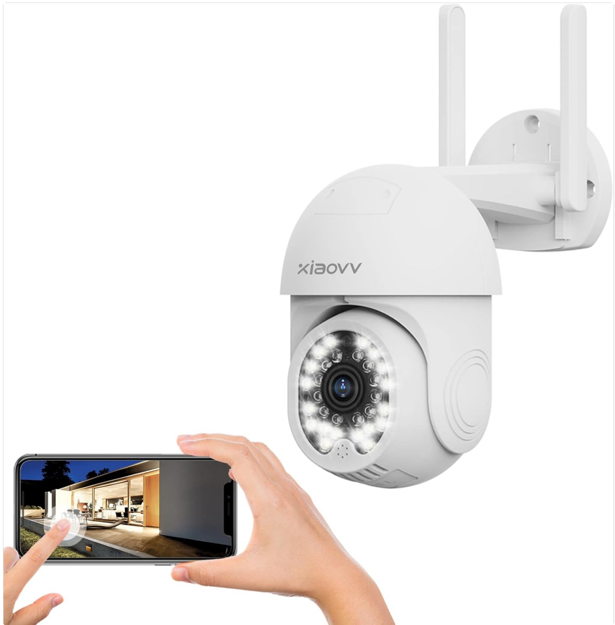
Figure 3.1: Front view of the XIAOVV 2MP Outdoor Wi-Fi Security Camera, illustrating its design and interaction with the mobile application.