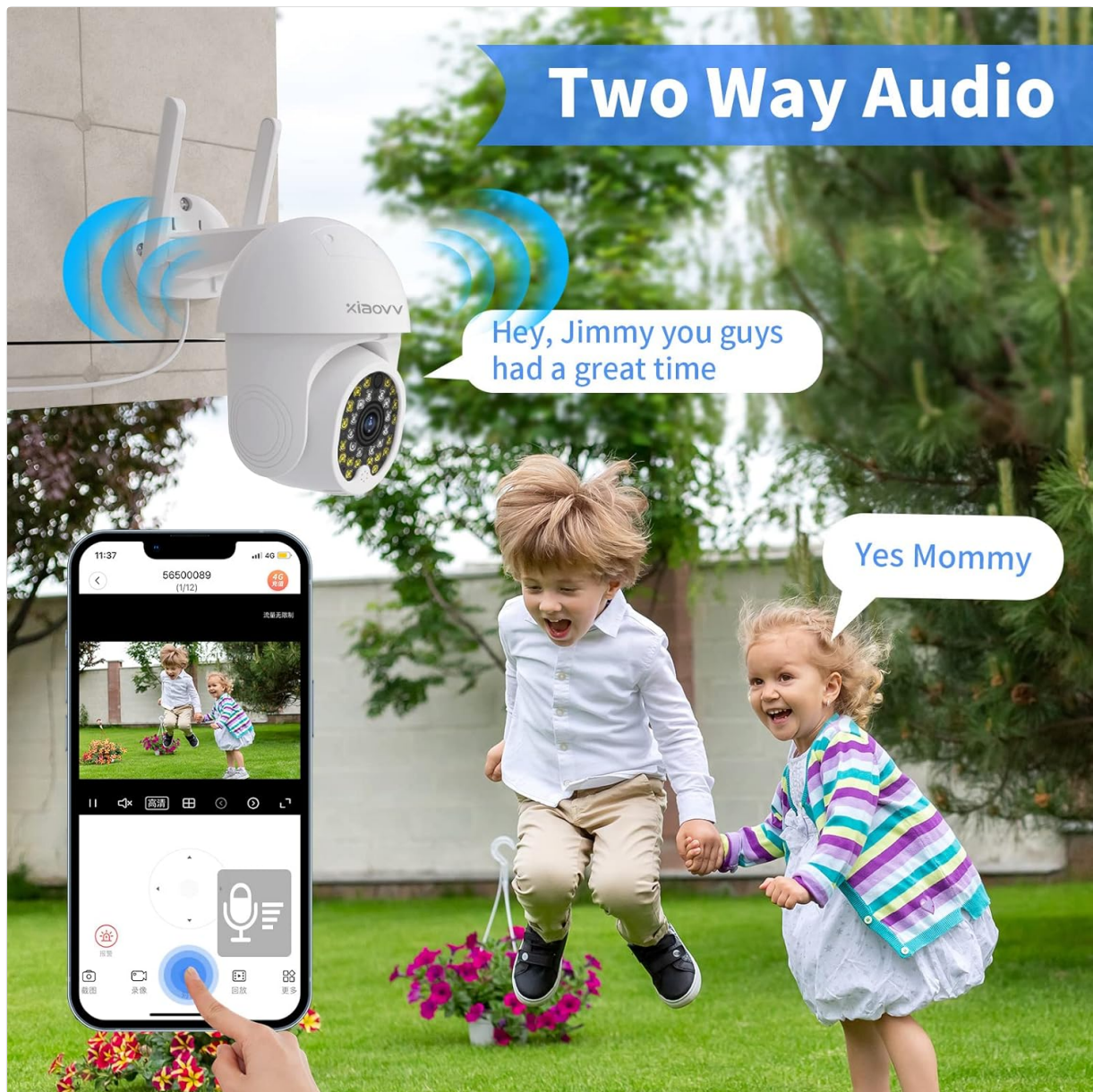
Figure 5.1: The camera's two-way audio feature in use, allowing for real-time conversation.