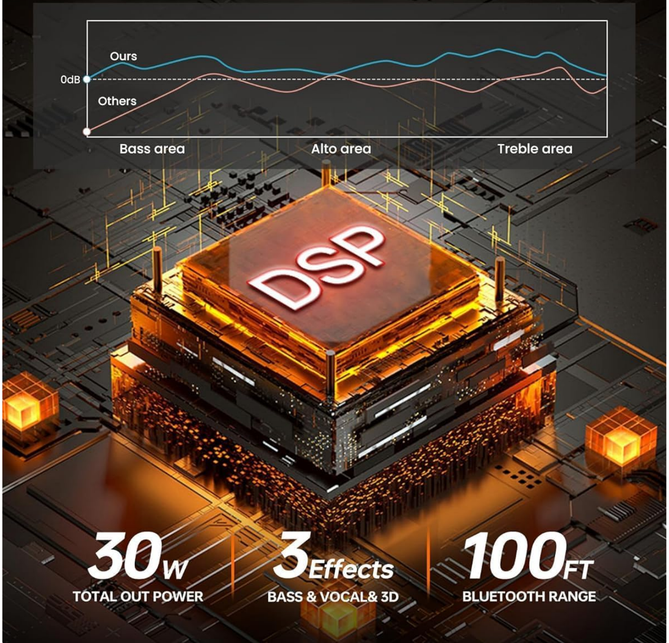
Figure 2: Advanced DSP chip for superior sound quality.