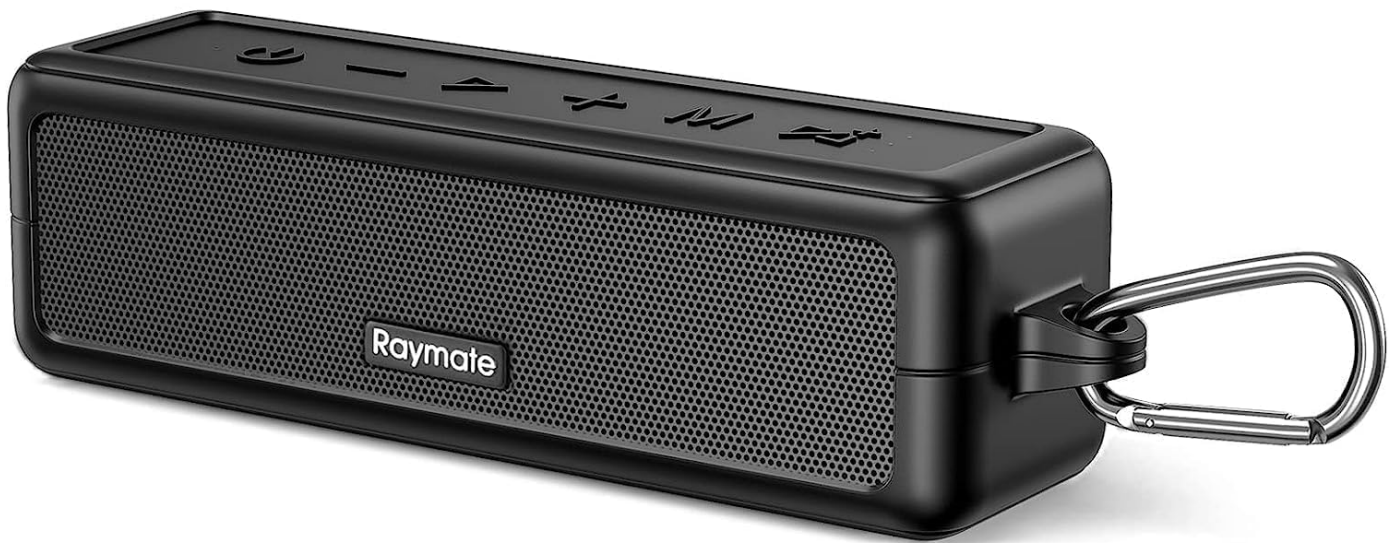
Figure 1: Raymate R5 Pro Bluetooth Speaker