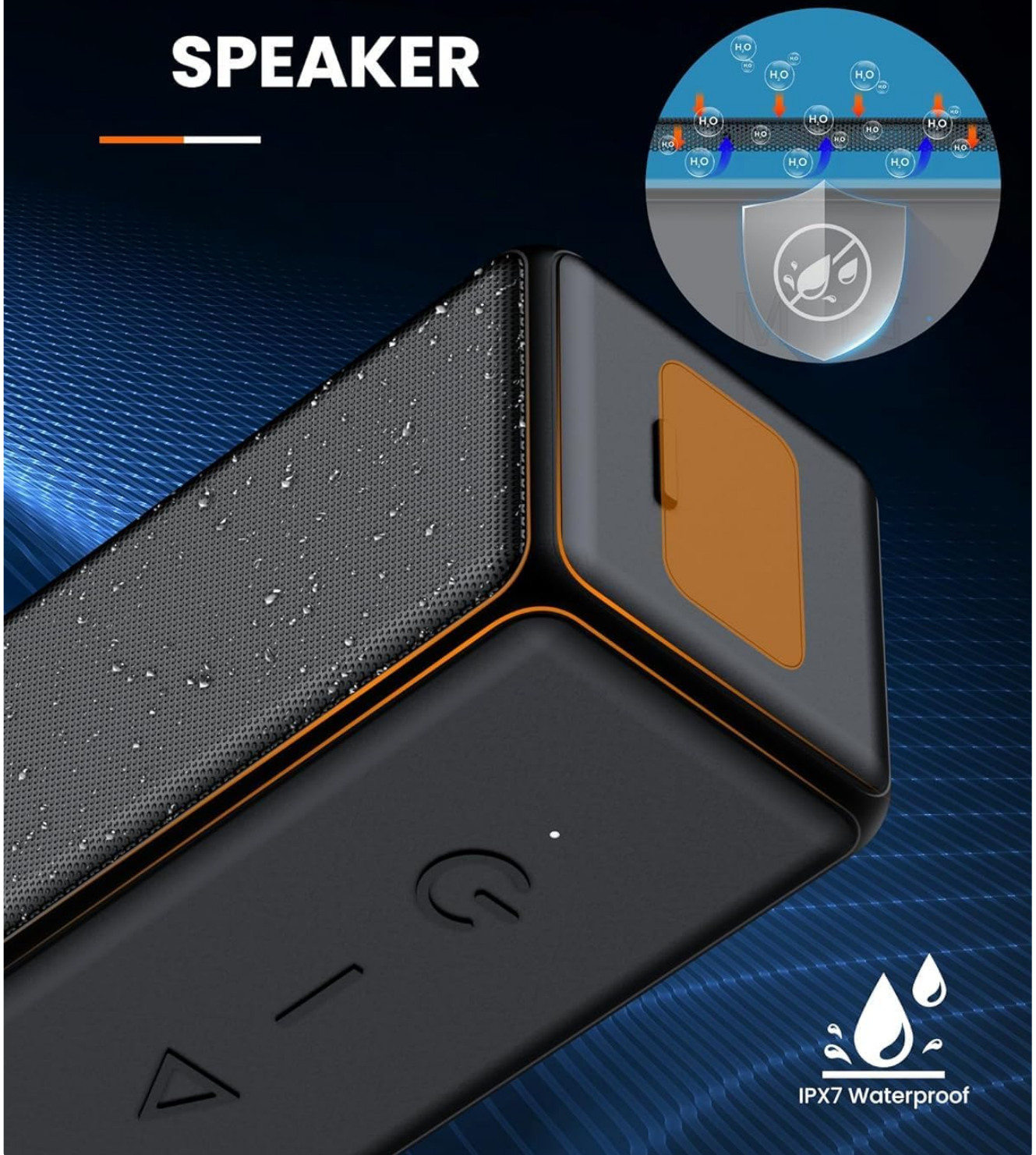
Figure 3: IPX7 waterproof design for outdoor and wet environments.