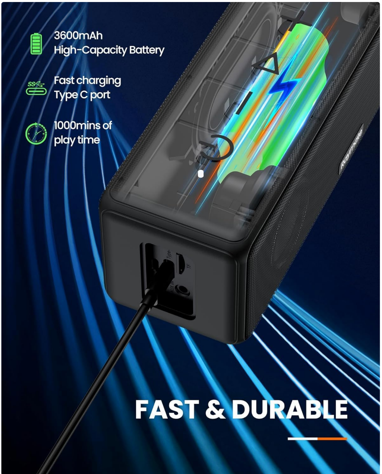
Figure 4: Long-lasting battery and convenient Type-C charging.