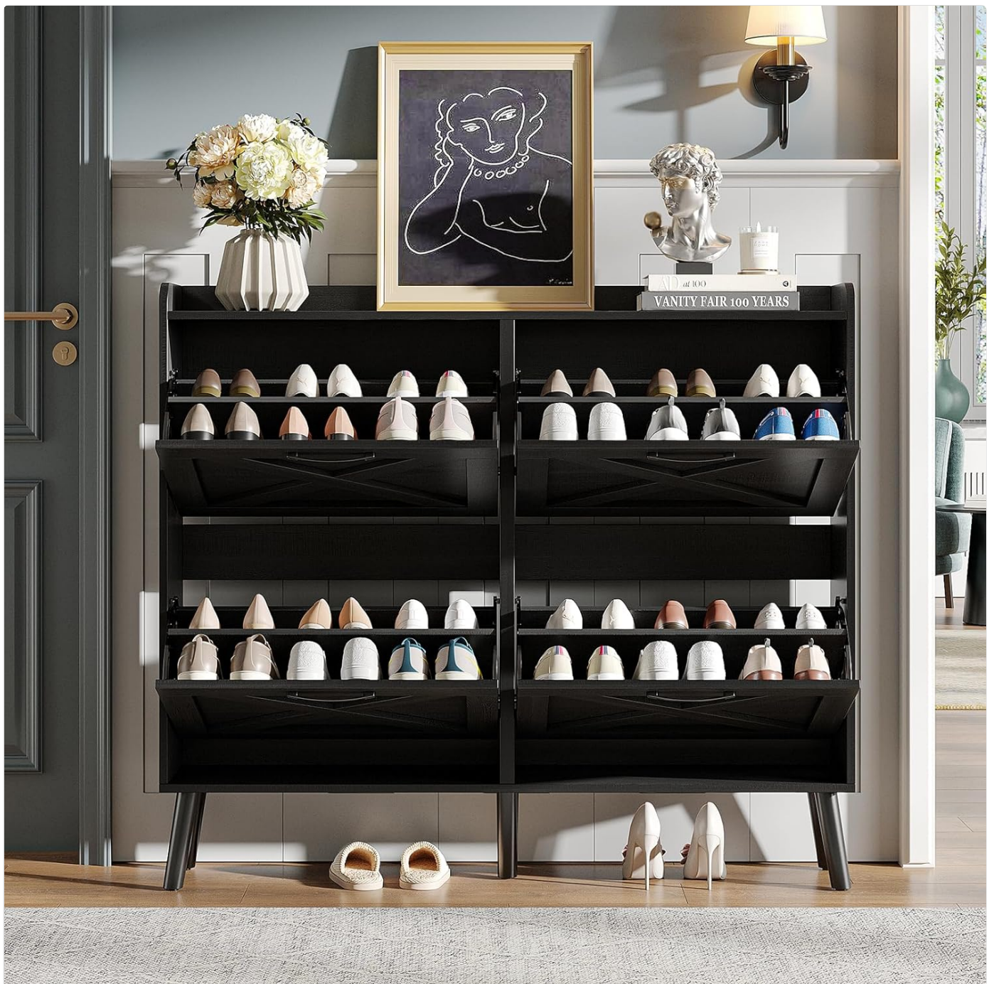
Figure 4: The shoe cabinet with its flip drawers open, showcasing the internal storage and the functional top surface.