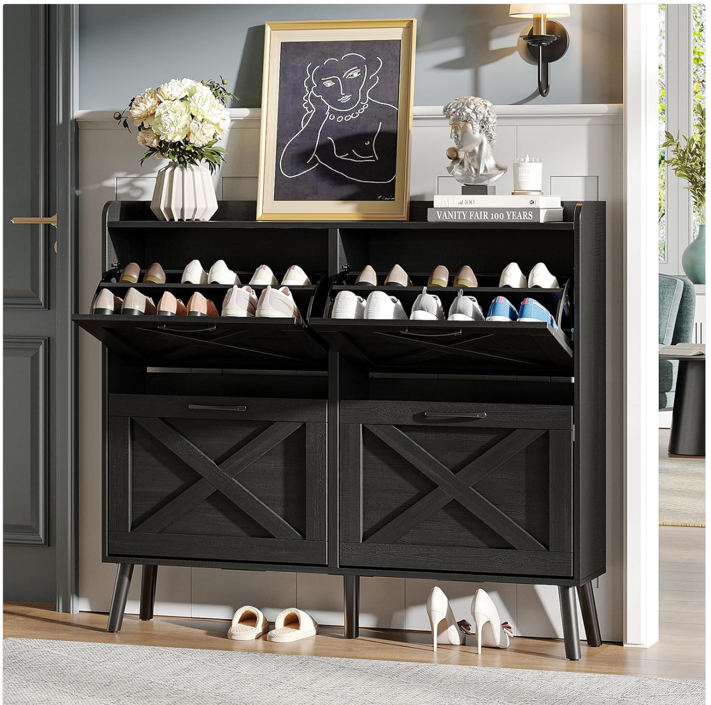
Figure 1: Fully assembled Maupvit Large Shoe Storage Cabinet, demonstrating its appearance and functionality in an entryway.