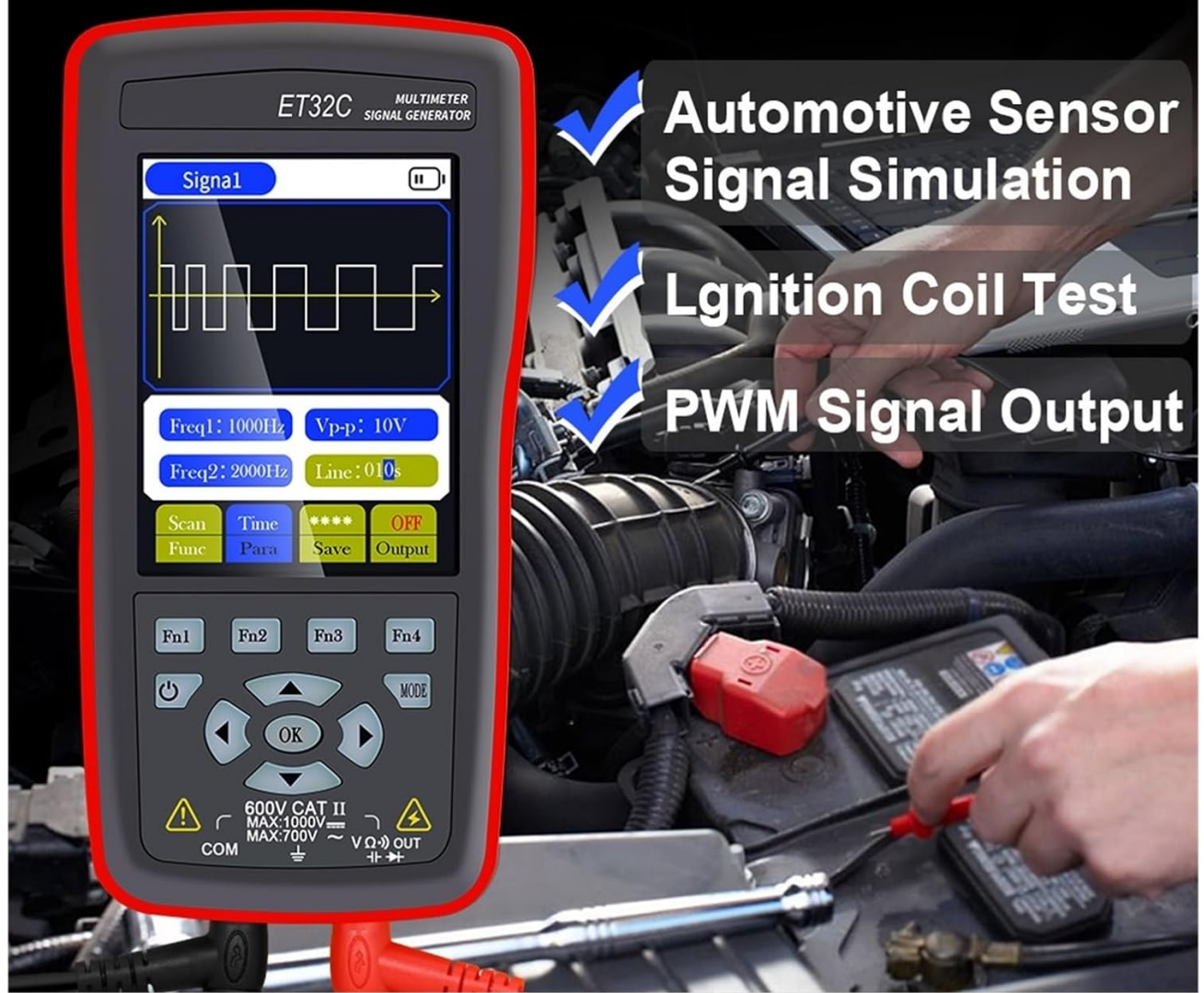
Figure 2: The device in use for automotive sensor signal simulation and ignition coil testing.