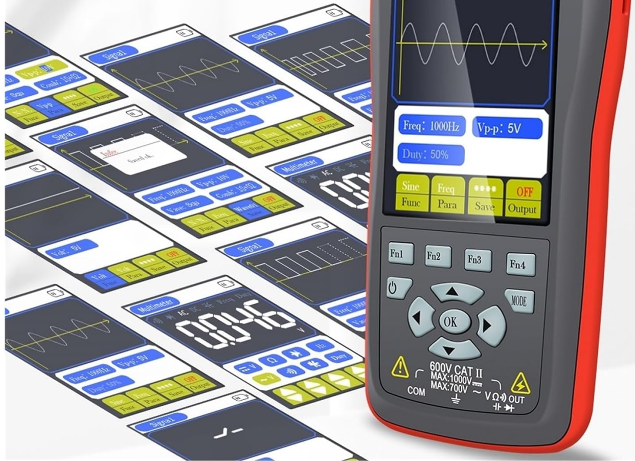
Figure 4: The device's waveform storage feature, allowing up to 50 sets of parameters to be saved.