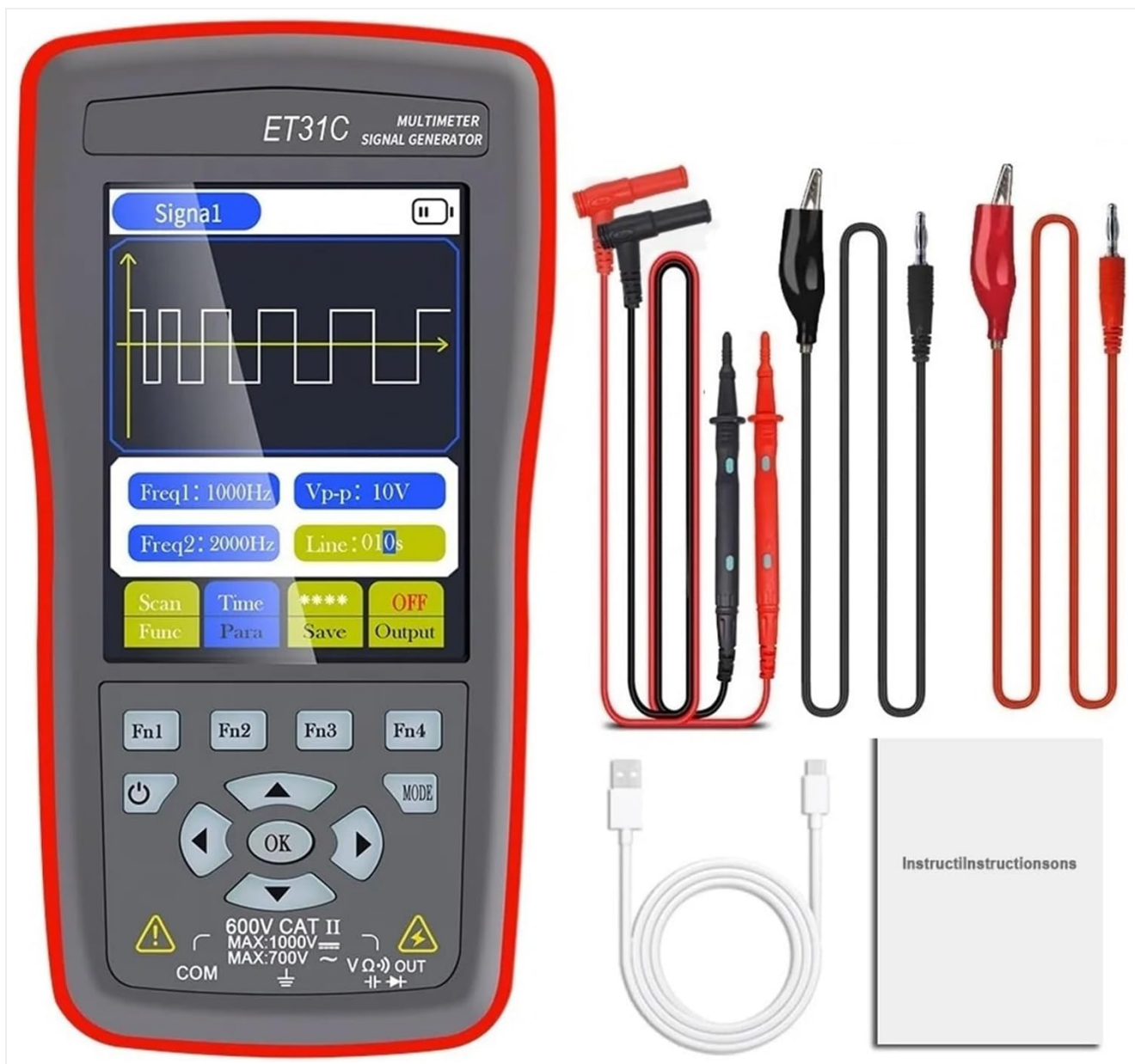
Figure 1: WLLKIY ET31C/ET32C Automotive Signal Generator Multimeter and included accessories.