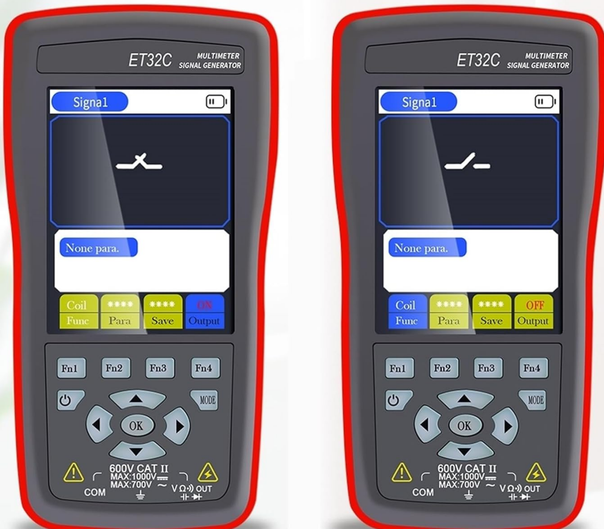
Figure 6: Screen showing the ignition coil test function, used to verify normal operation of coils, solenoid valves, and relays.

Check if the ignition coil is normal, support ignition coil control, solenoid valve control, relay control ( 30V/1A and below coil control)