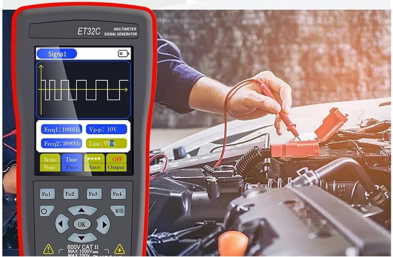
Figure 5: The device functioning as a vehicle maintenance signal source, simulating sensor outputs.