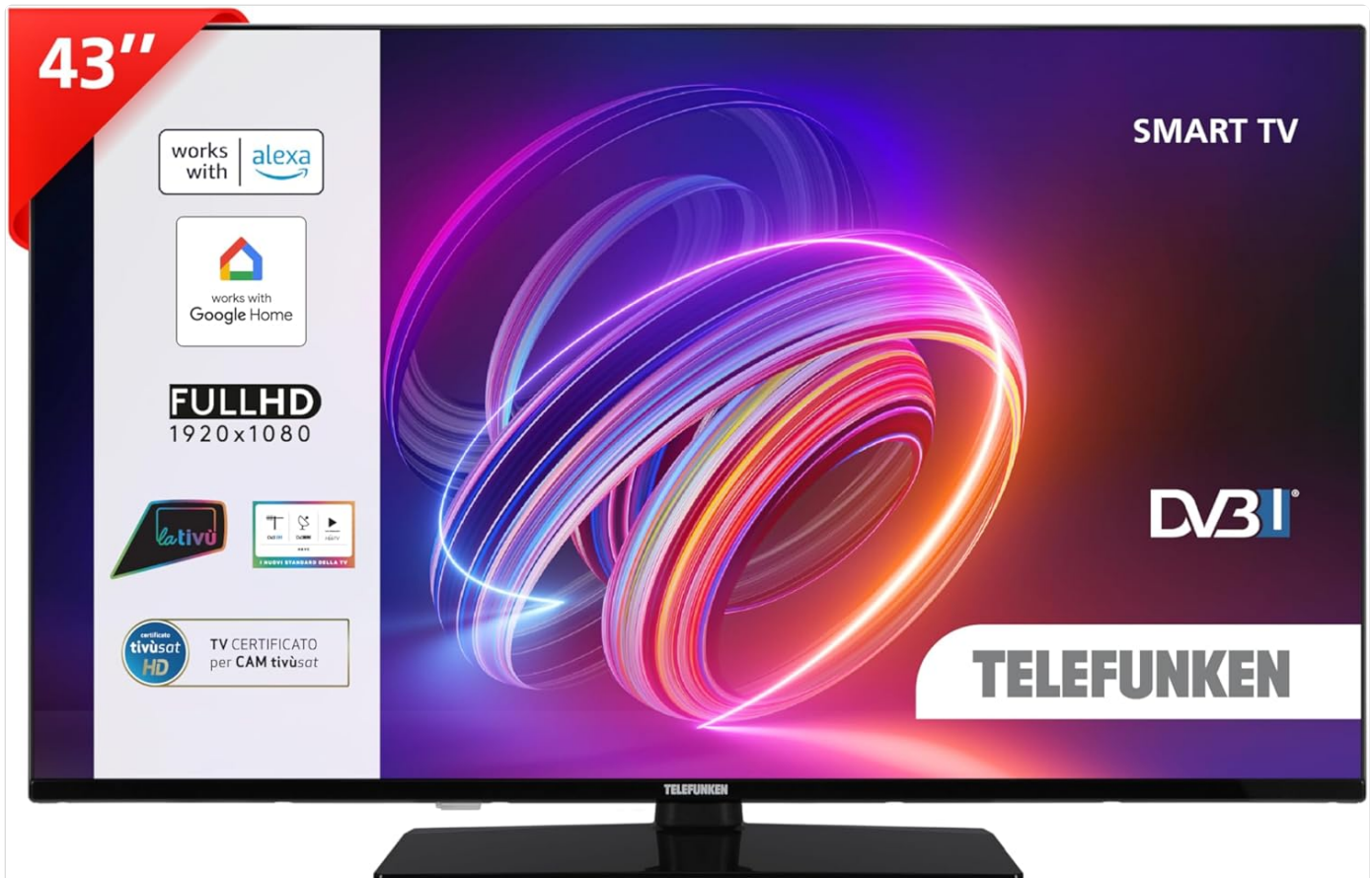
Figure 1: Front view of the TELEFUNKEN 43-inch Smart TV, showcasing its slim bezel design and central stand.

The TELEFUNKEN TE43750B45I2KZ is a 43-inch Full HD Smart TV designed to provide an immersive viewing experience. It integrates modern features such as Smart TV capabilities, voice control compatibility, and advanced audio-visual technologies.