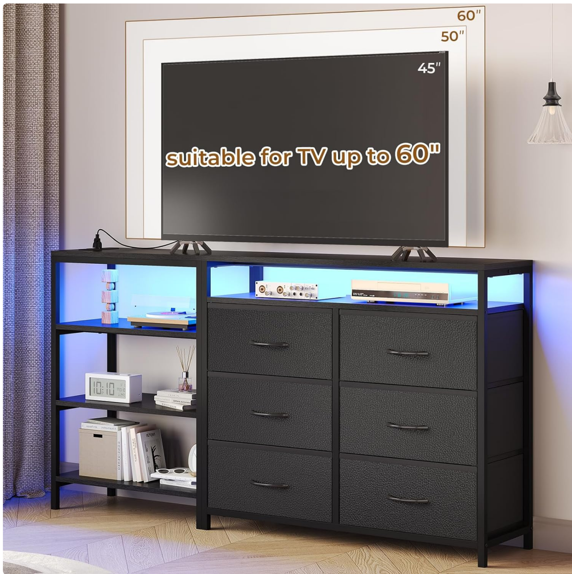
Image: The BTHFST DT005 TV Stand with a television placed on top, demonstrating its capacity to hold TVs up to 60 inches.