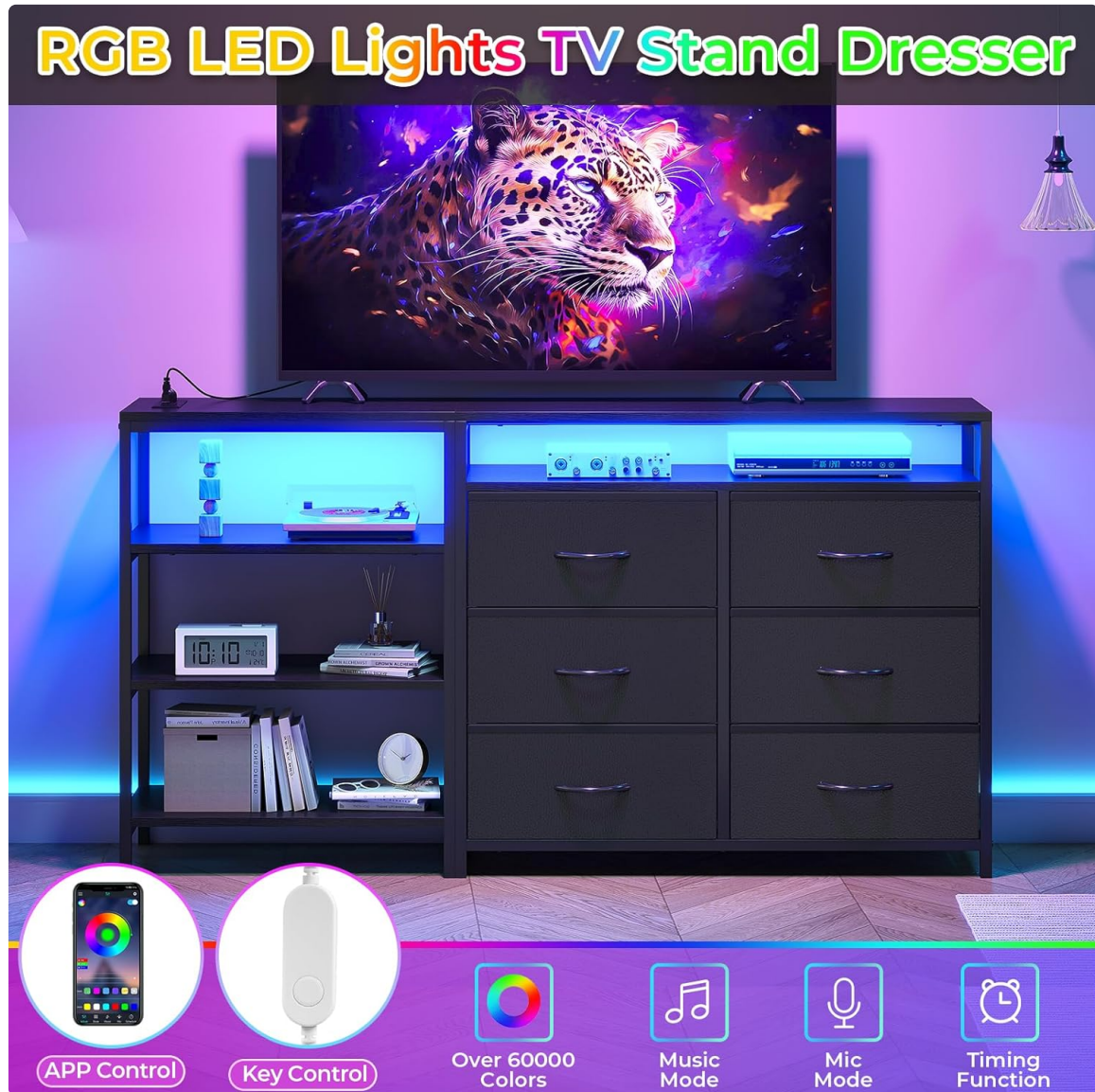
Image: The BTHFST DT005 TV Stand showcasing its RGB LED lights in a living room setting. The image illustrates the various color options and control methods (APP Control, Key Control, Dynamic Modes, Music Mode, Timing Function).

The entertainment center includes smart RGB LED lights. These lights can be controlled via a dedicated mobile application or a physical key control. Users can select from over 60,000 DIY colors, dynamic modes, voice control, music mode, and a timing function to customize the lighting ambiance.