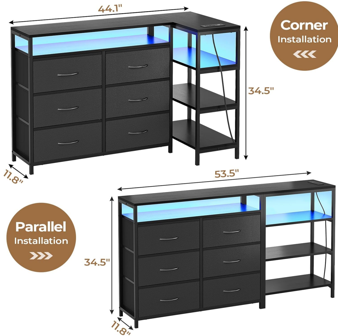
Image: The BTHFST DT005 TV Stand shown in two configurations: a corner installation (top) and a parallel installation (bottom). Dimensions are indicated for both setups, highlighting its adaptable design.