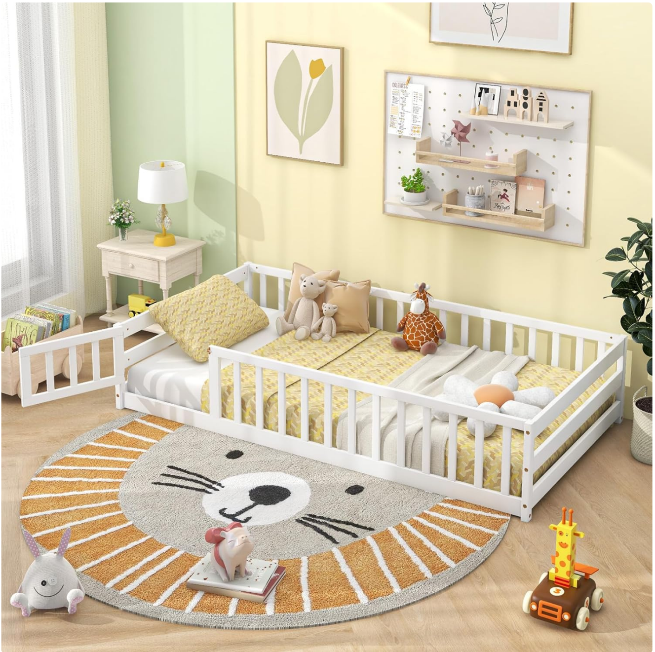
Image 1.1: The Giantex Twin Floor Bed, shown in a child's bedroom setting, highlighting its low profile and guardrails.