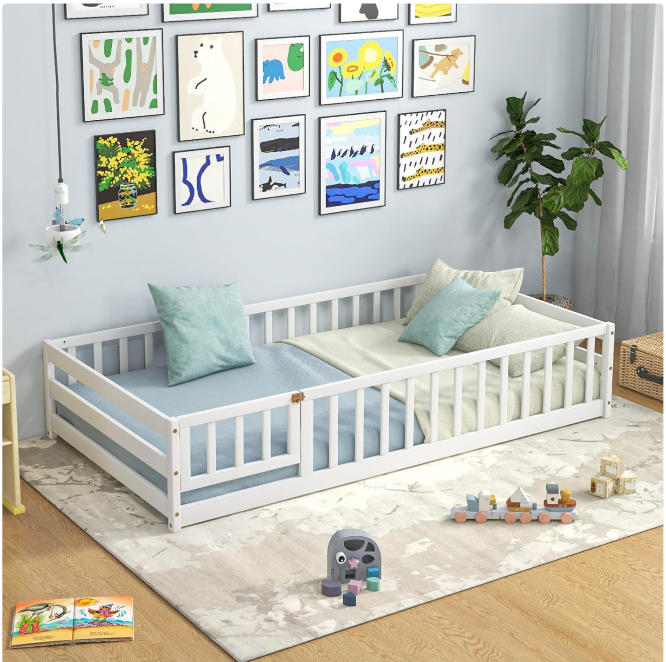
Image 5.3: The bed's versatility for sleeping, playing, and reading, promoting a child's independence and development.