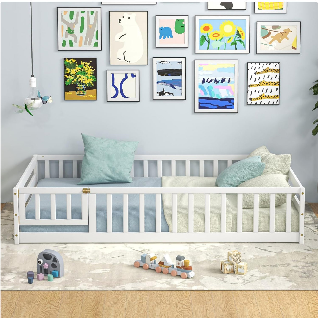
Image 4.1: An example of the fully assembled Giantex Twin Floor Bed in a child's room, ready for use.