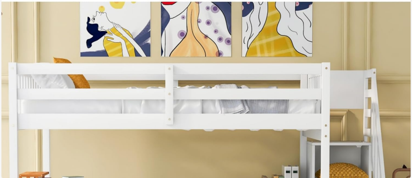
Image 3.1: Detail of the extended, full-length guardrails and bed slats, eliminating the need for a box spring.

Extended, full-length guardrails. 14 bed slats, no box spring needed.