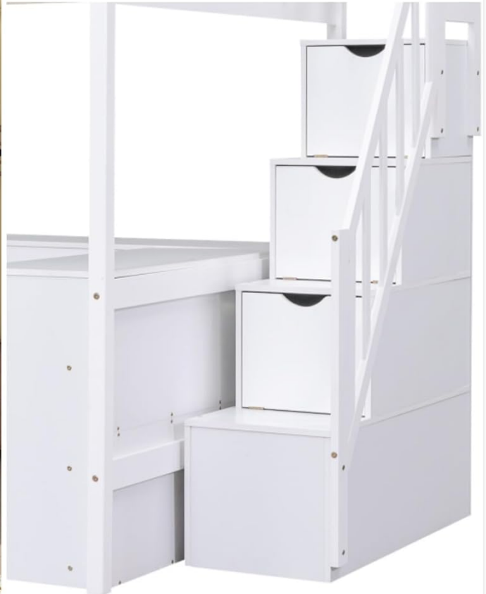
Image 3.3: The stairs of the loft bed include storage compartments with doors.

The stairs of the loft bed include storage compartments with doors.