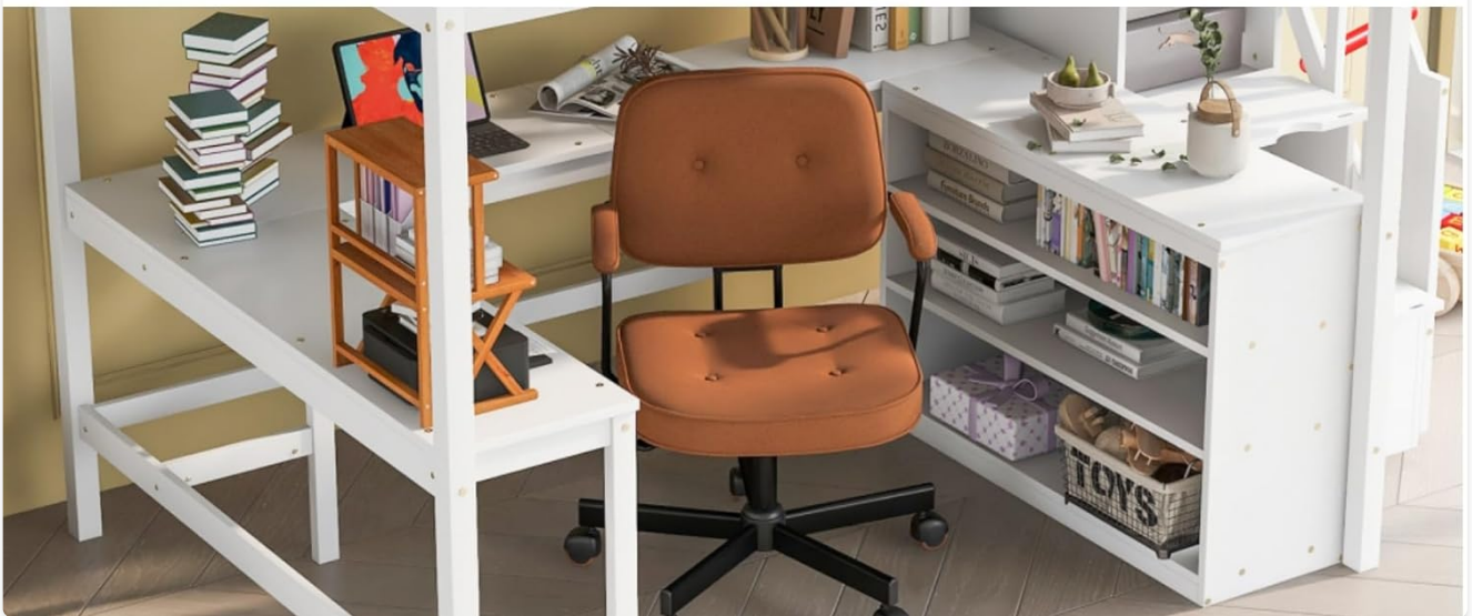
Image 3.2: Detailed view of the L-shaped desk and integrated three-tier storage shelves.