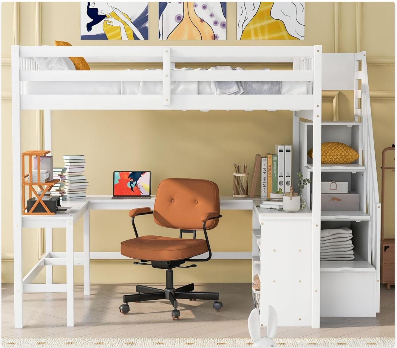
Image 1.1: Merax Full Size Loft Bed Frame with L-Shaped Desk and Storage Stairs.