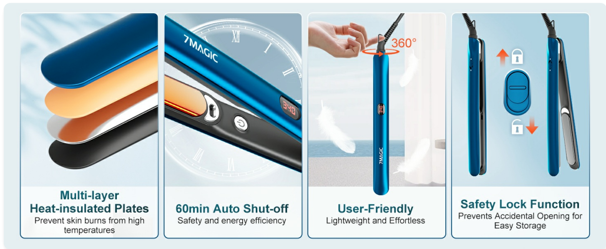
Image 4.3: Visual guide for creating perfectly straight hair and effortless beach waves.