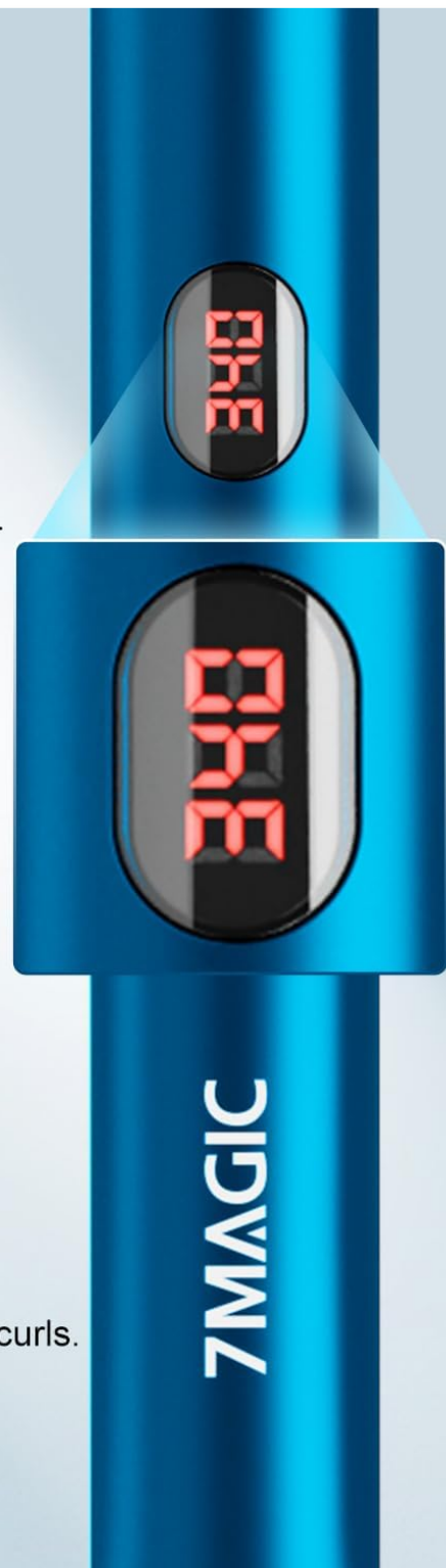
Image 4.1: The LCD display and temperature controls, illustrating recommended settings for different hair types.