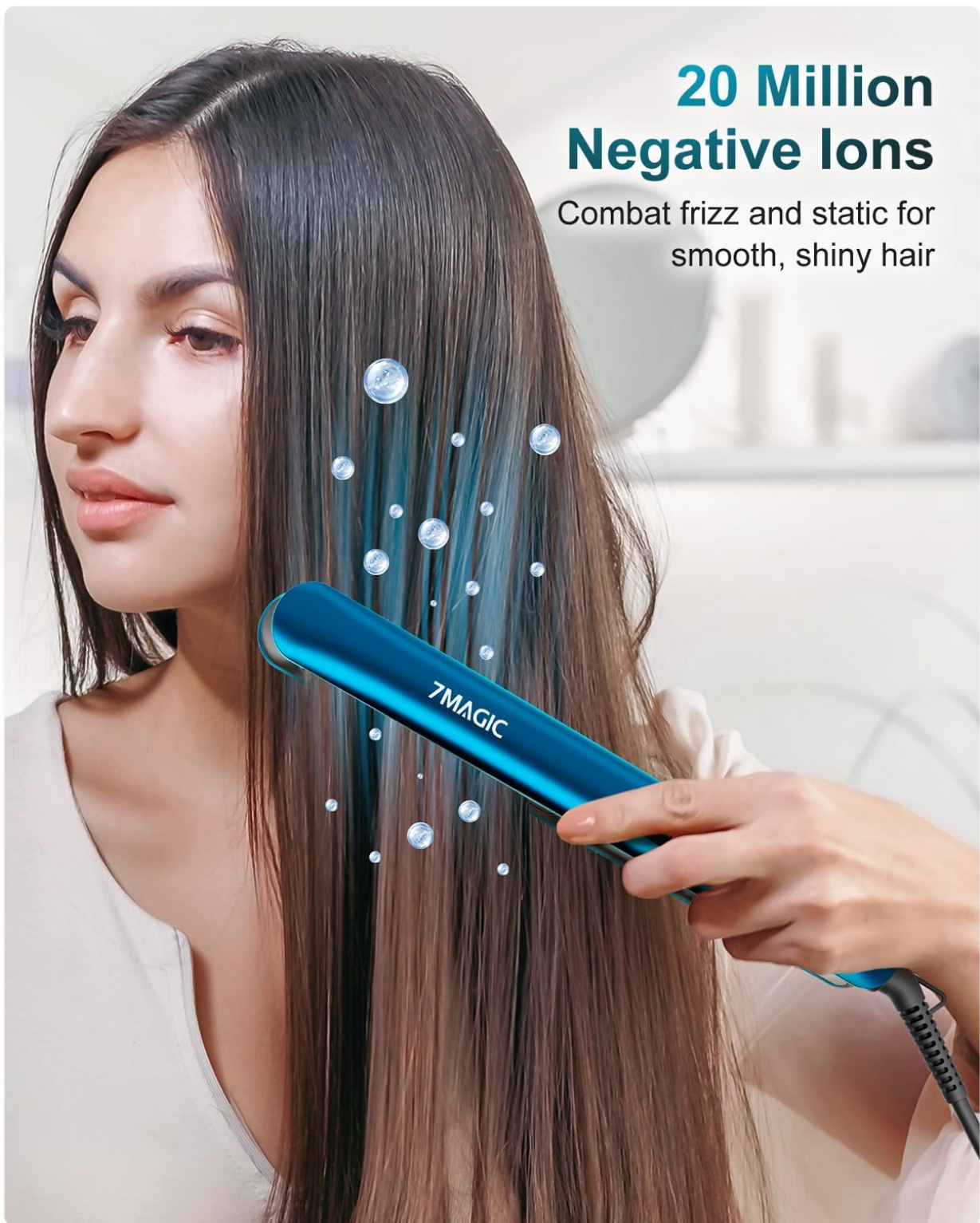
Image 4.4: Illustration of negative ions combating frizz and static for smooth, shiny hair.