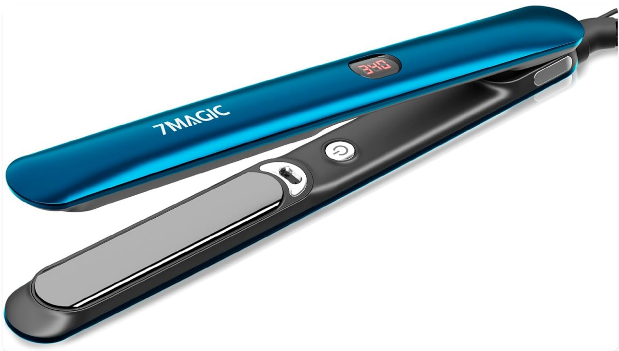
Image 2.1: The 7MAGIC Ceramic Hair Straightener in Midnight Blue, showcasing its sleek design and LCD display.