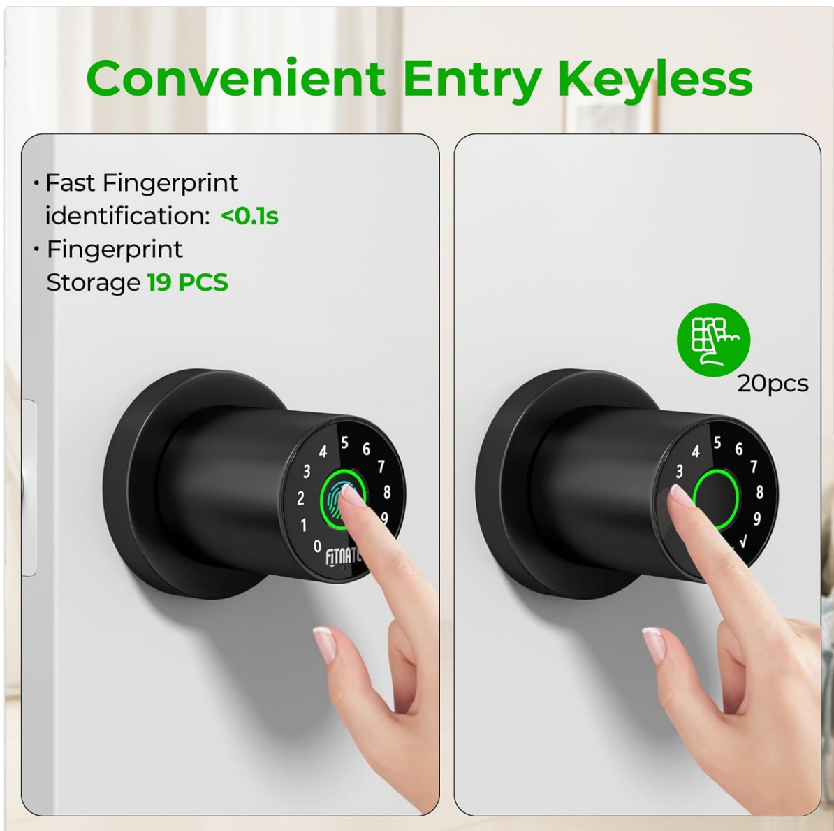
Image: Fingerprint recognition for keyless entry.