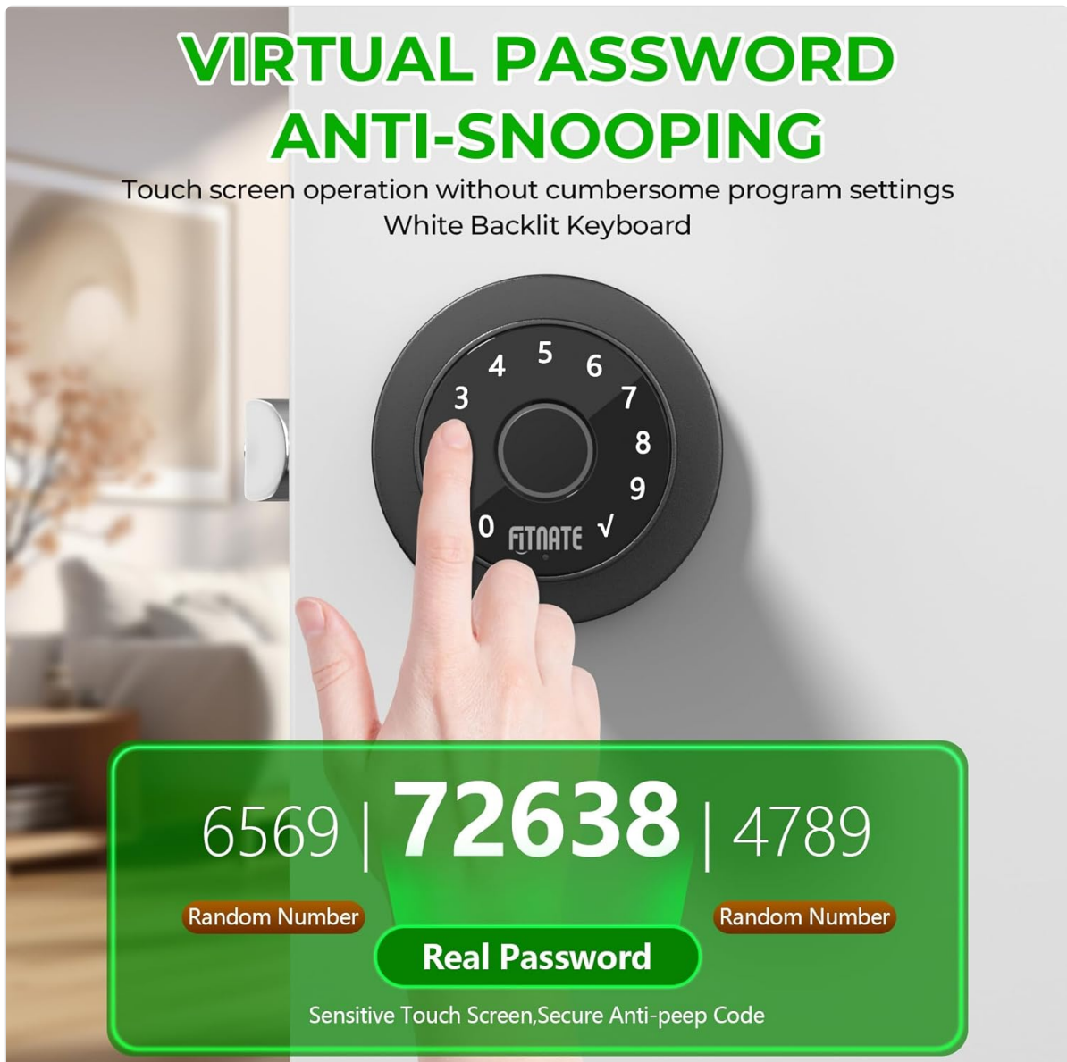
Virtual password entry on the keypad.