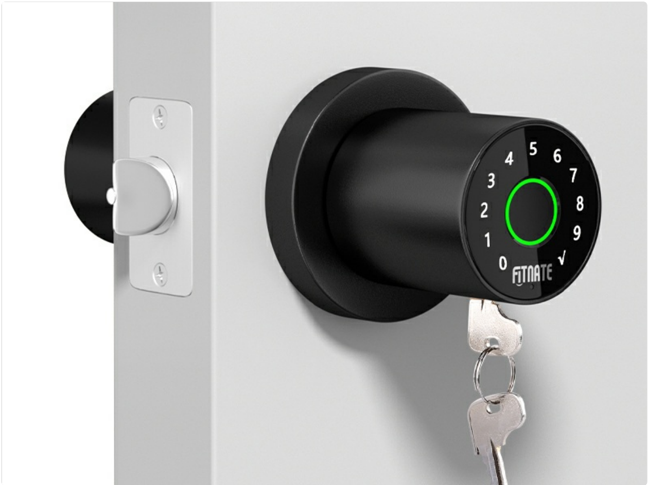
Image: Unlocking the door knob with a mechanical key.

In case of battery depletion or other issues, the door can always be unlocked using the provided physical keys. The keyhole is located on the exterior knob.