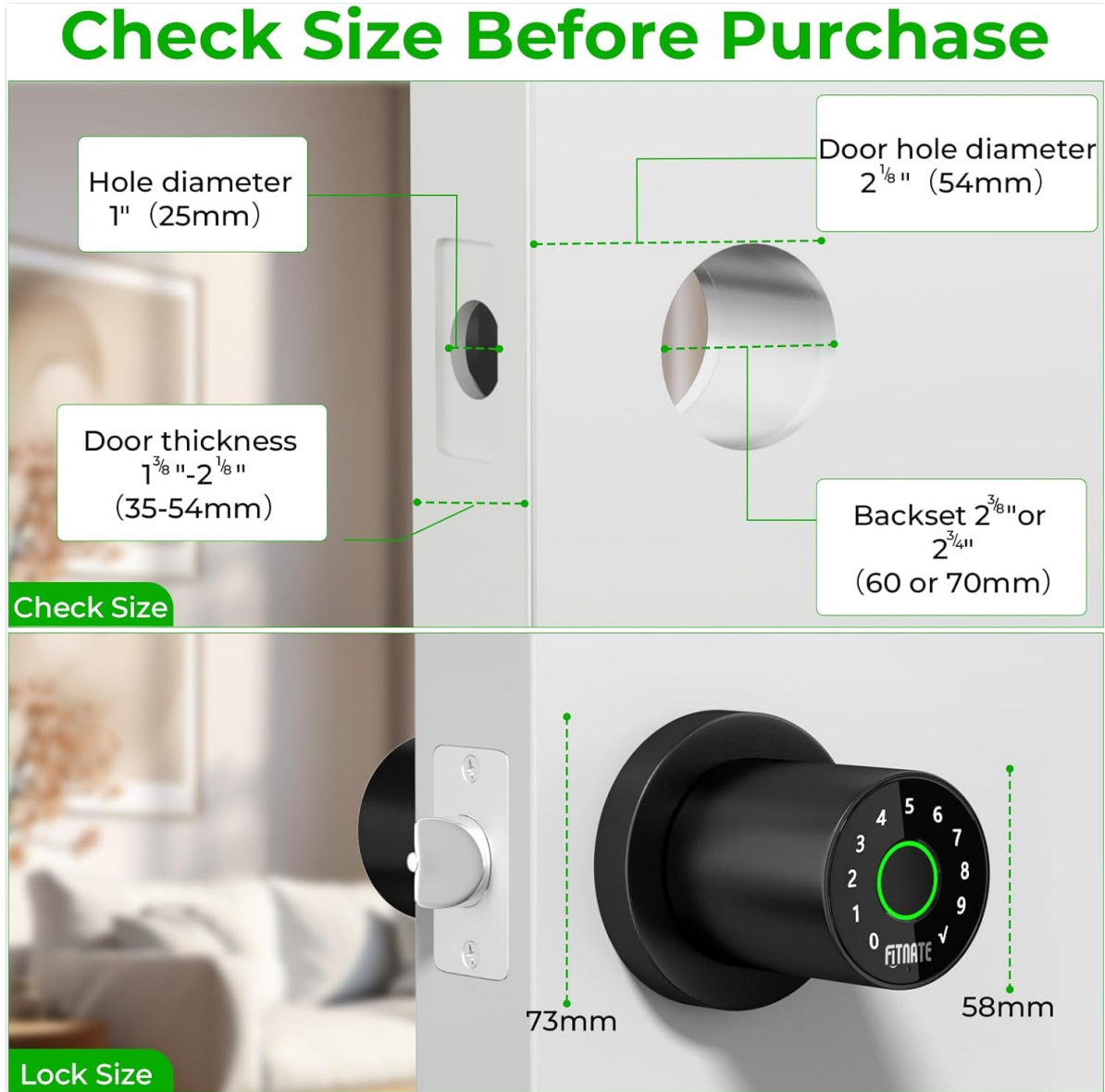
Image: Door size requirements for FITNATE HS0434 installation.