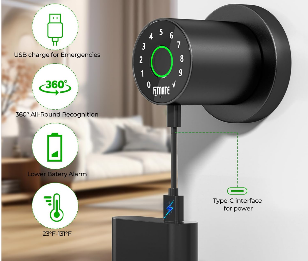
Image: USB Type-C port for emergency power.

Video: Demonstrates mechanical key unlock and USB-C emergency power (2:30-2:39).