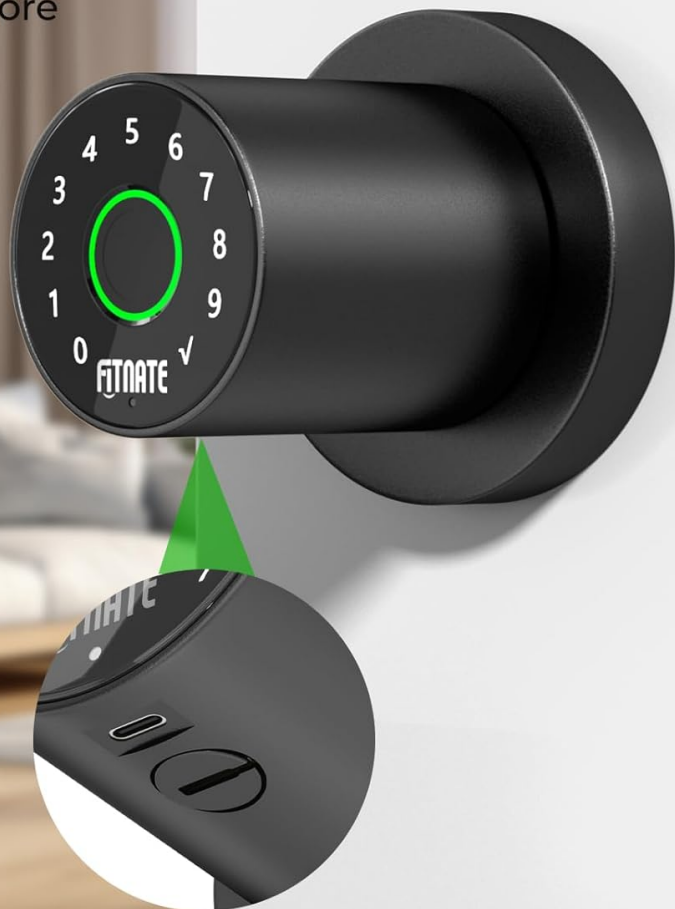
Image: Overview of the FITNATE Smart Door Knob highlighting its four unlocking methods.