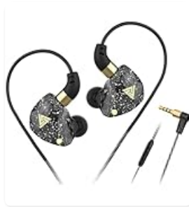
Figure 4: Step-by-step guide to wearing the AK3FILE Earbuds

Your browser does not support the video tag. Please update your browser.