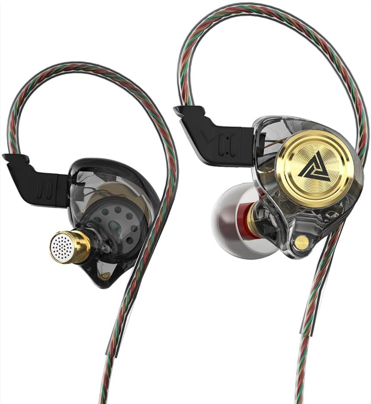
Figure 1: Yeabomy AK3FILE Wired Gaming Earbuds