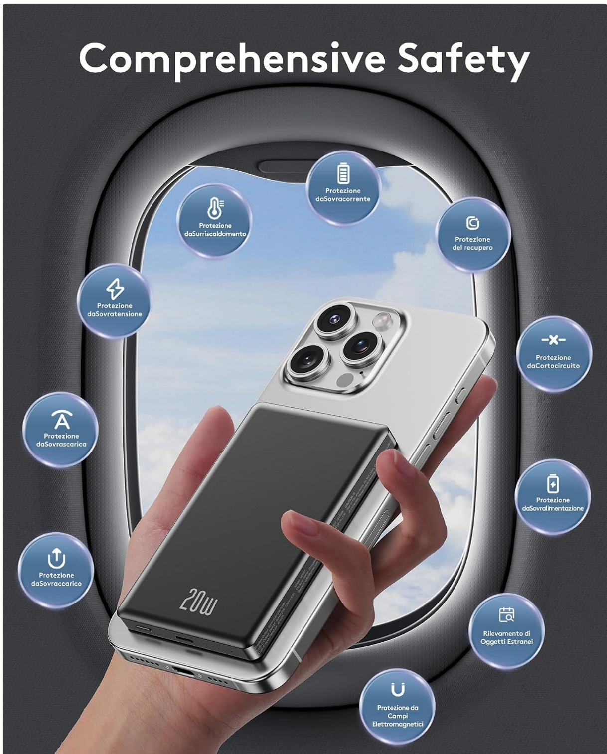
Figure 6: Comprehensive safety features of the Ntaanoo MP101, including protection against overheating, overcurrent, overvoltage, short circuits, and more.