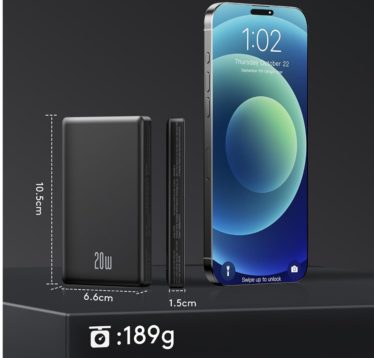
Figure 1: The Ntaanoo MP101 power bank demonstrating its small, compact, and portable design with dimensions (4.13 x 2.6 x 0.59 inches) and weight (6.7 ounces).