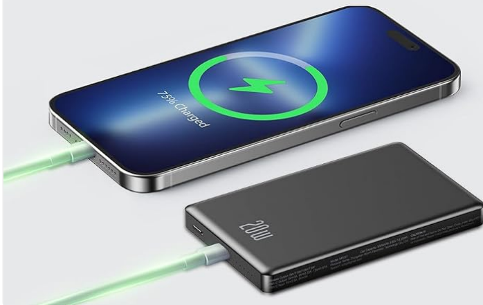
Figure 5: The Ntaanoo MP101 demonstrating two ways to charge an iPhone: wirelessly (15W) and wired (22.5W), which also represents simultaneous charging capability.