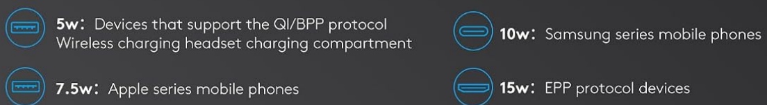
Figure 4: Wireless charging in progress, showing the power bank delivering up to 15W fast charging to a smartphone.