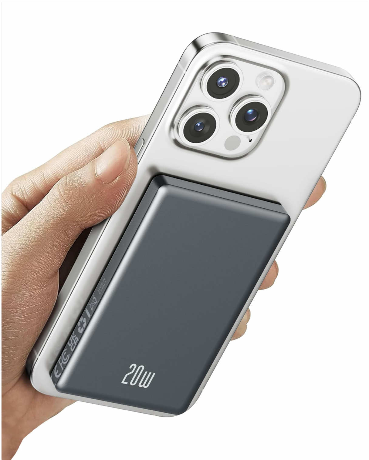
Figure 2: The Ntaanoo MP101 Magnetic Power Bank, the primary component included in the package.