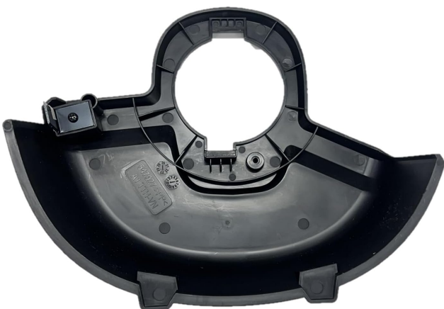
Image Description: Top view of the black plastic trimmer guard, showing the mounting points and internal structure.