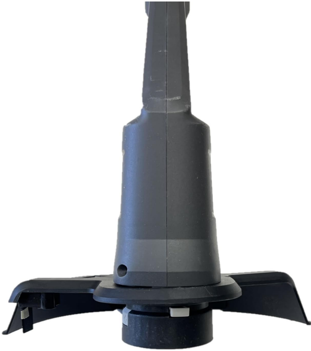
Image Description: A close-up bottom view of the trimmer head, showing the line exit point and the protective guard.

configuration, with the shaft rotated to allow vertical cutting.