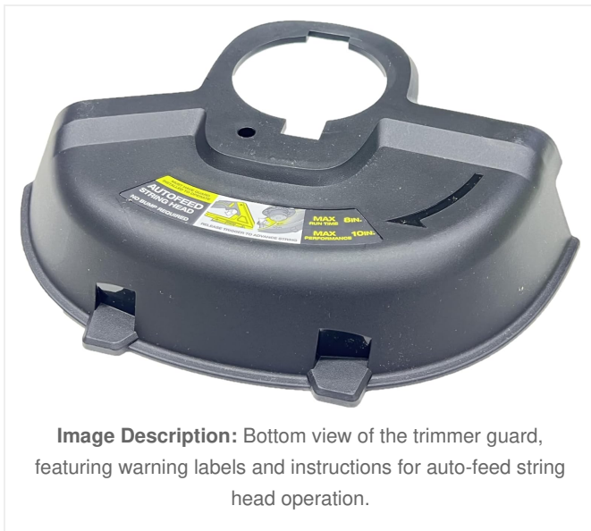
Image Description: Bottom view of the trimmer guard, featuring warning labels and instructions for auto-feed string head operation.