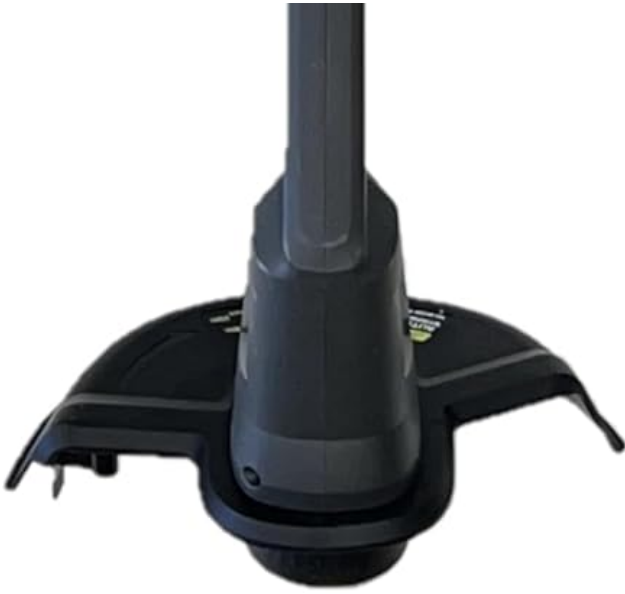
Image Description: Front view of the RYOBI ONE+ 18V 10 inch Cordless String Trimmer/Edger, showing the main shaft, handle, and trimmer head.