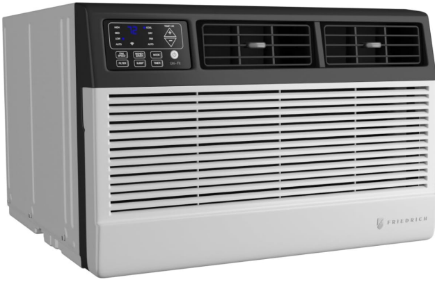
Figure 2: Angled view of the Friedrich Uni-Fit air conditioner, highlighting its compact design.