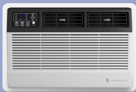
Figure 4: The Uni-Fit unit seamlessly integrated into a wall sleeve, illustrating its universal fit capability.

Uni-Fit® Series offers universal fit for easy sleeve replacement (24 ½" to 27")