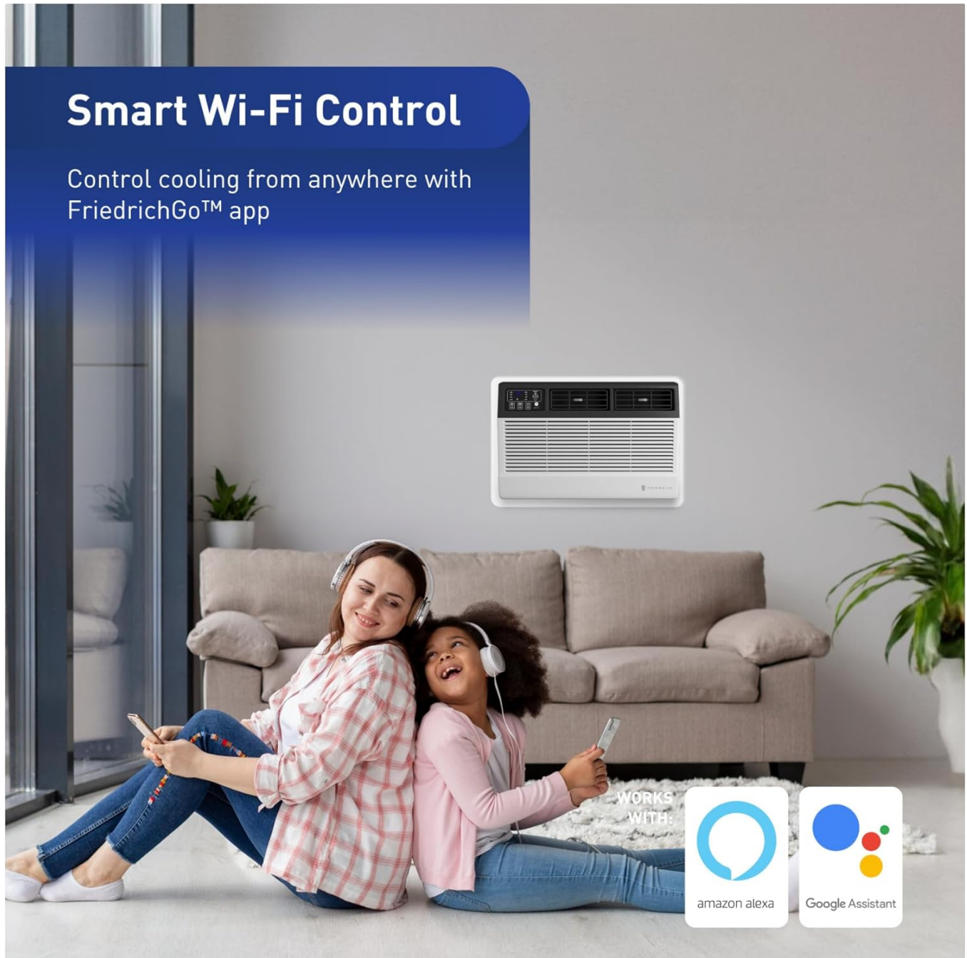
Figure 5: Control your Uni-Fit unit remotely using the FriedrichGo™ app on your smartphone.

Download the FriedrichGo™ app from your smartphone's app store. Follow the in-app instructions to connect your air conditioner to your home Wi-Fi network. This allows for remote control and scheduling.