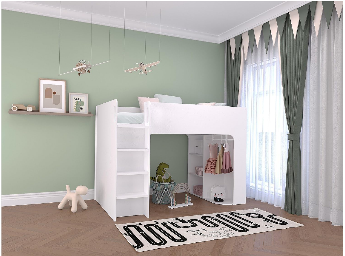
Figure 2: Vente-unique COLUMI loft bed in a child's room, showing the bed, integrated storage, and ladder. This image displays the Vente-unique COLUMI loft bed in a complete room setup, highlighting its design, the sleeping area, the integrated ladder, and the storage space underneath.