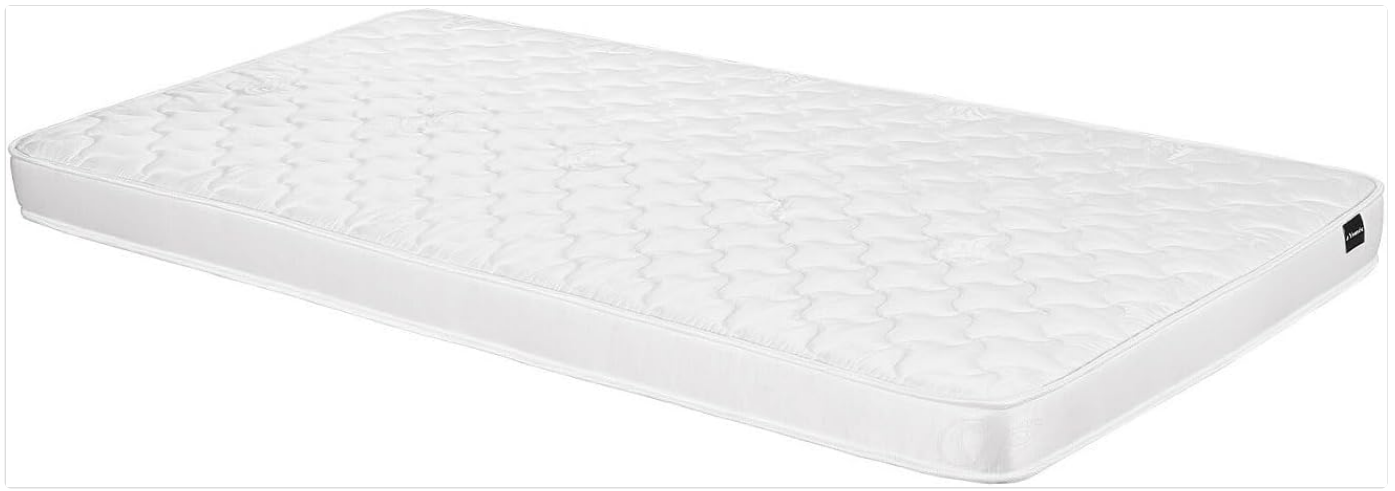
Figure 4: Vente-unique DANAED standard mattress, 90 x 190 cm, included with the loft bed. This image shows the DANAED standard mattress, designed for comfort and included with the COLUMI loft bed, measuring 90 x 190 cm.