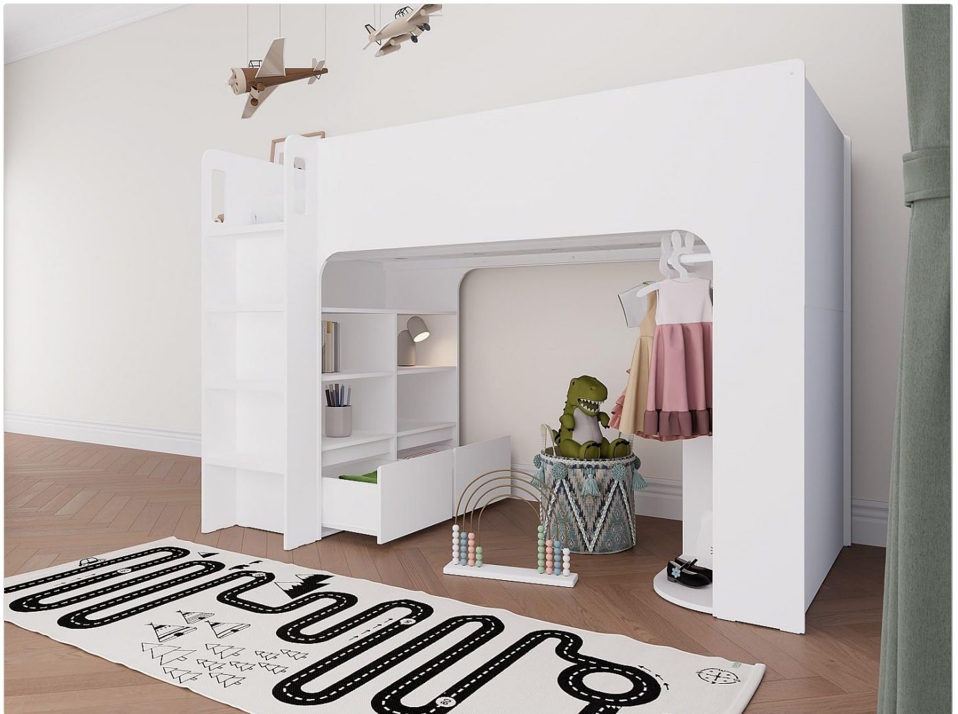
Figure 3: Vente-unique COLUMI loft bed in a child's room, with the storage area organized with clothes and toys. The COLUMI loft bed is shown in a child's room, demonstrating how the integrated storage, including the wardrobe rail and shelves, can be effectively used for clothes and toys.