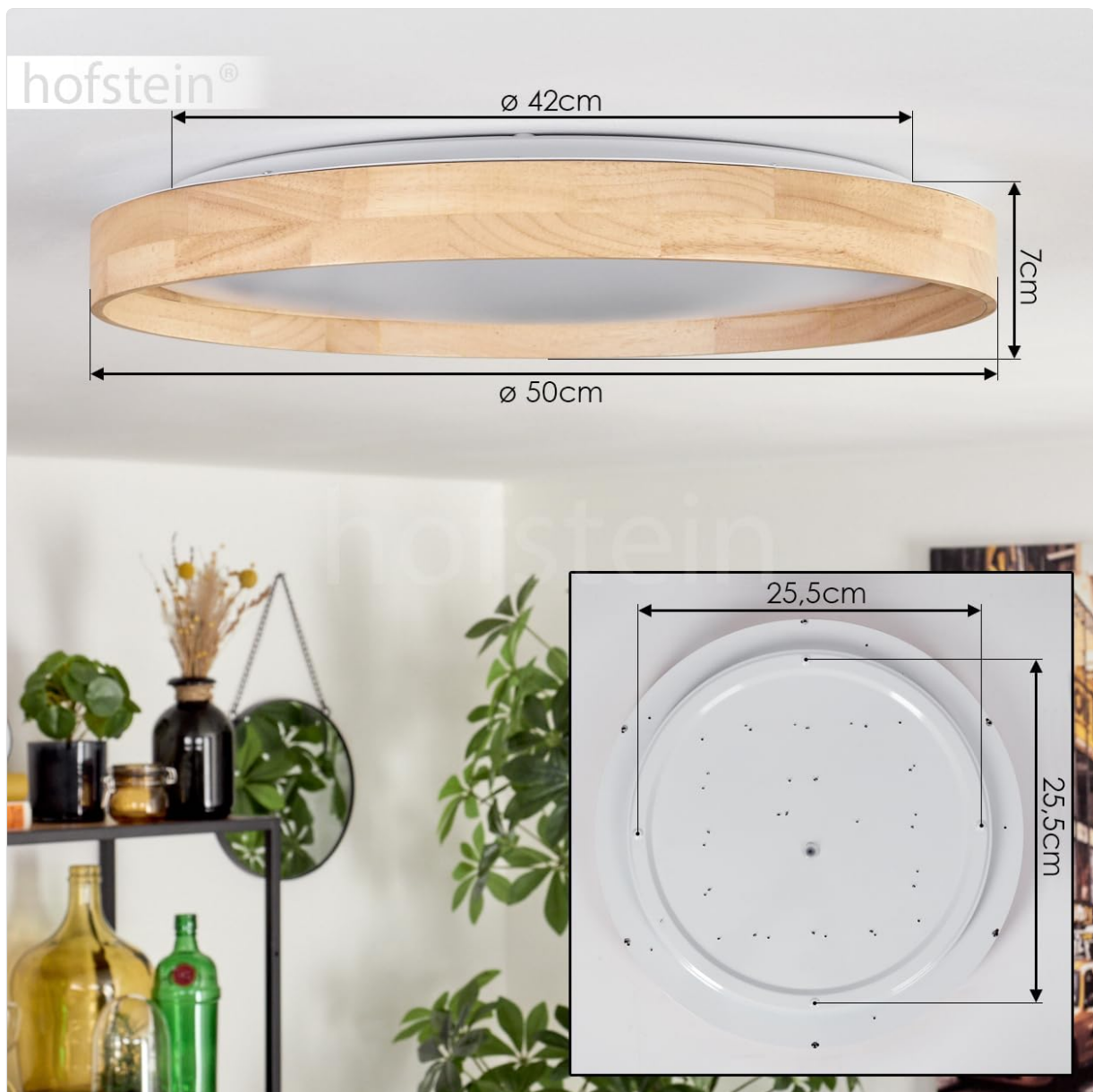
Image: Dimensional diagram of the ceiling light, indicating an outer diameter of 50 cm and a height of 7 cm, crucial for planning installation space.