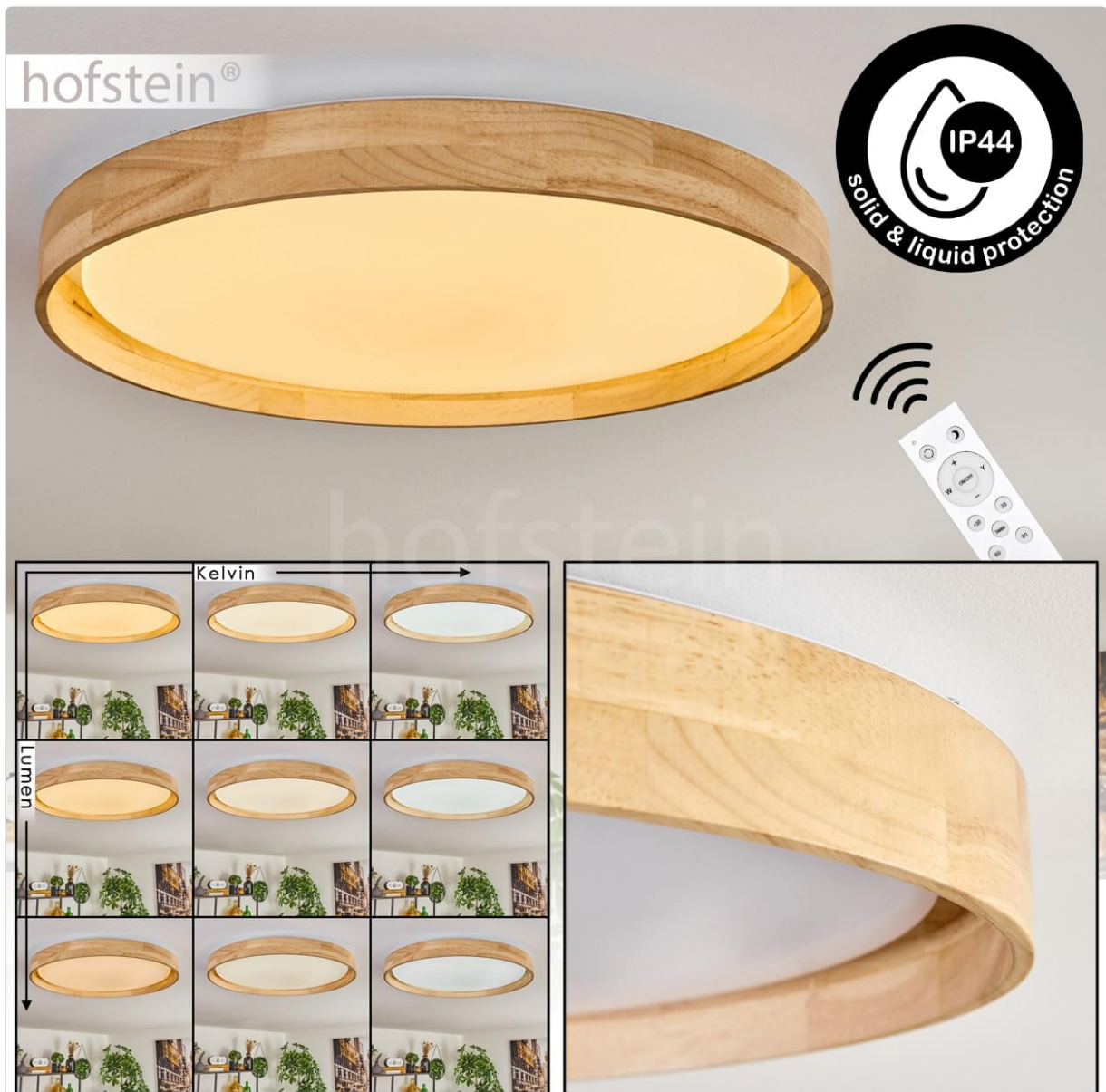
Image: The Hofstein Tabernas LED Ceiling Light, showcasing its natural wood finish, white diffuser, included remote control, and IP44 splash protection rating.