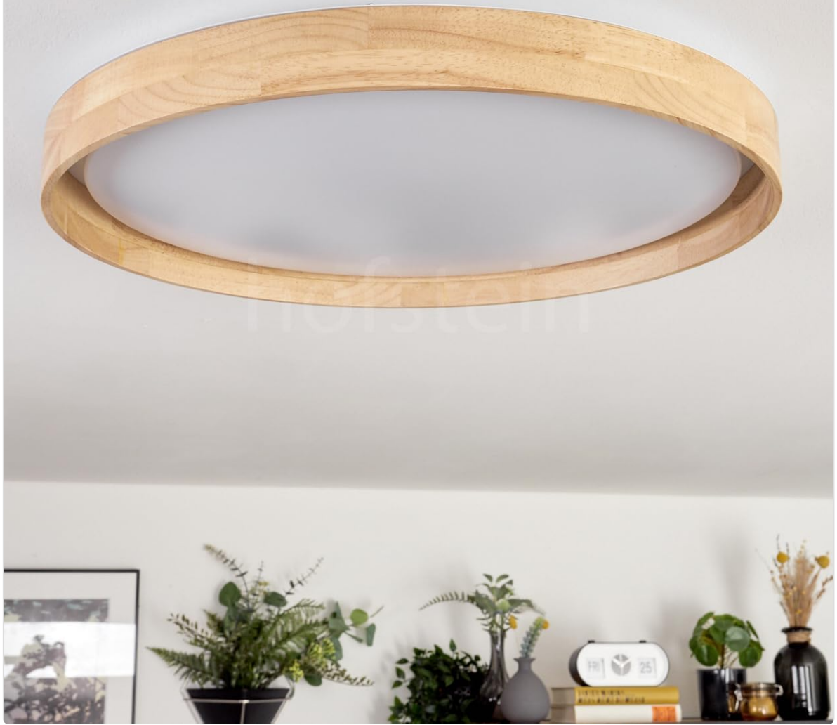
Warm White Light (approx. 2700K)