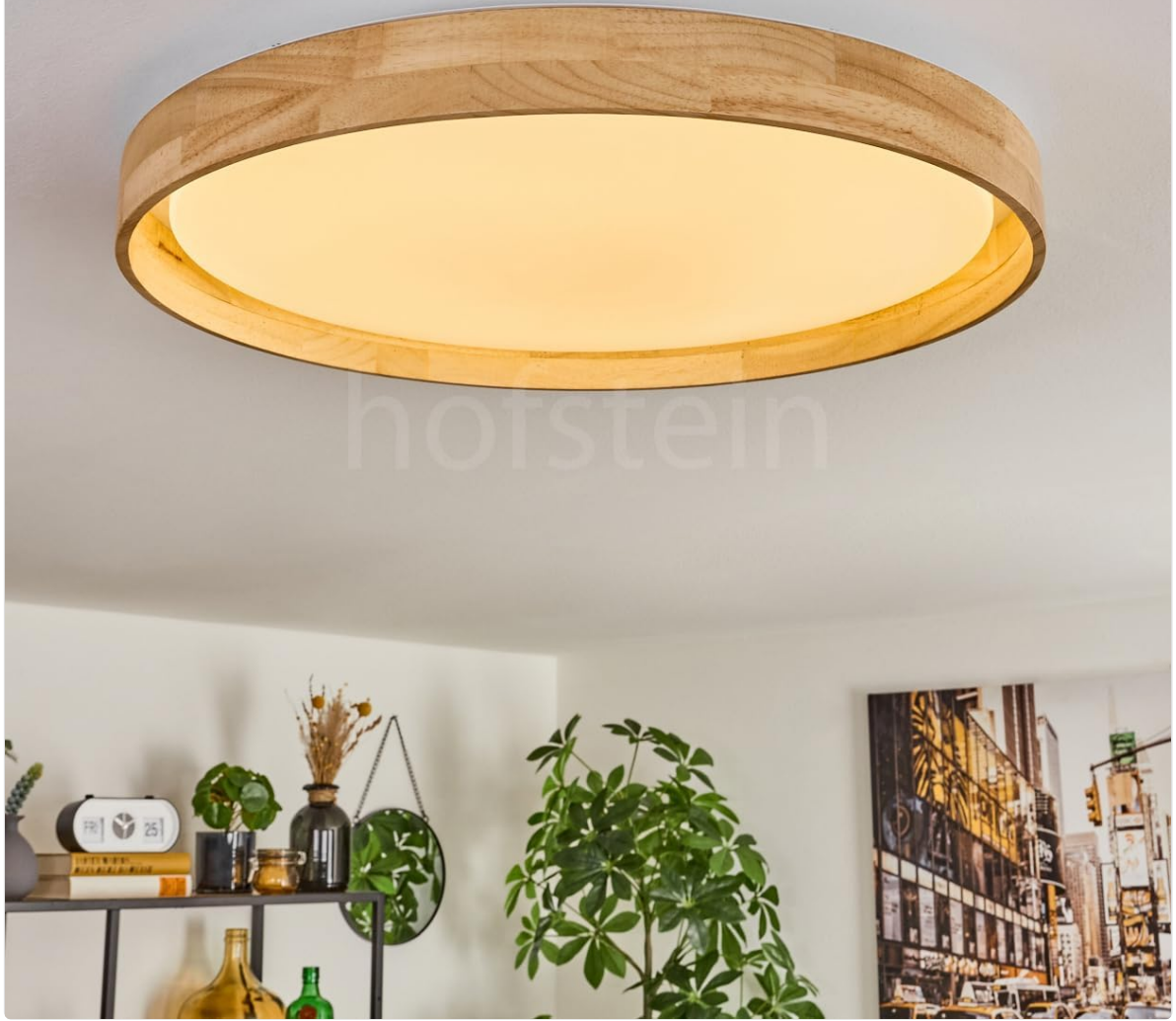
Neutral White Light (approx. 4000K)