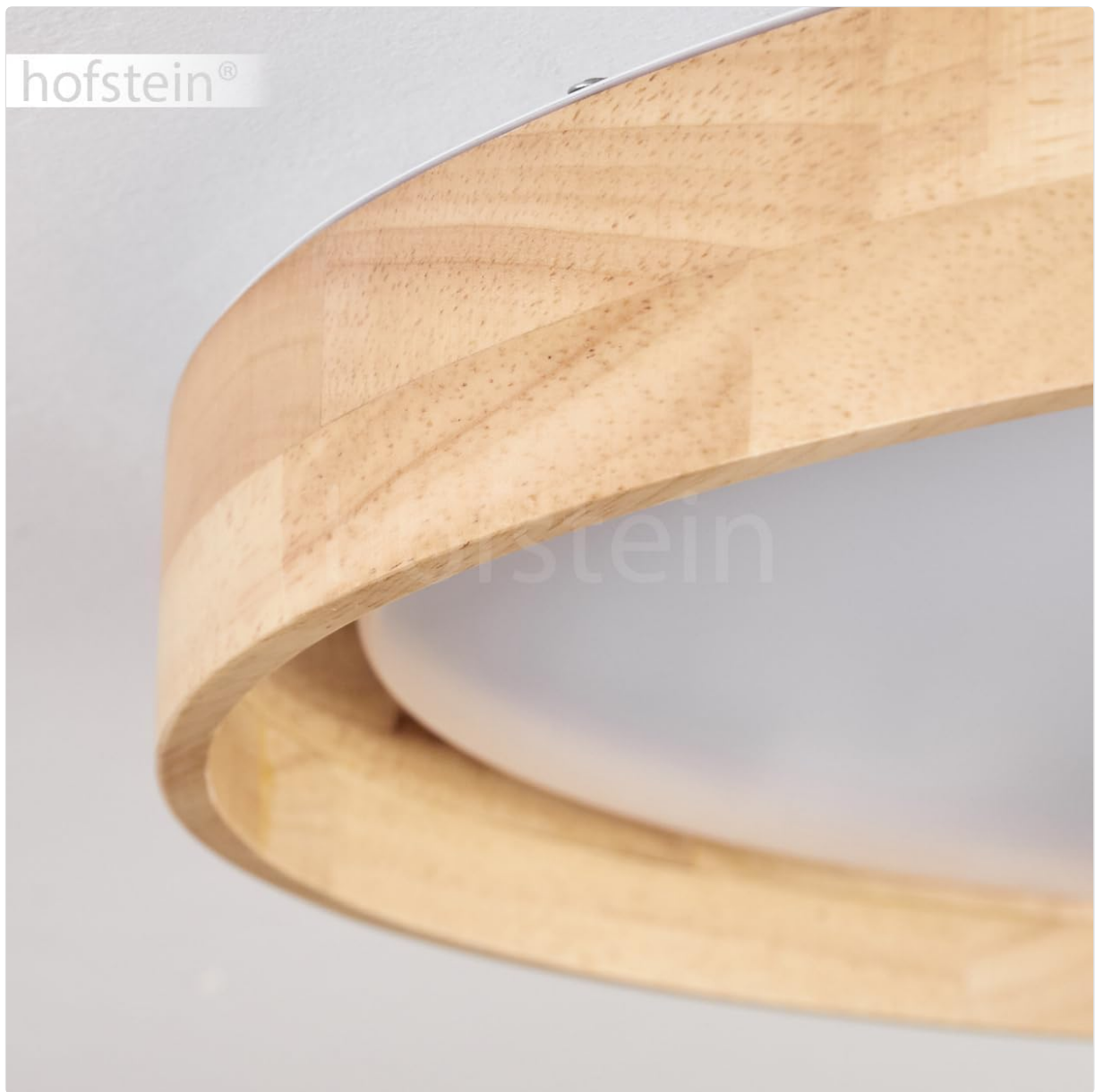
Image: A detailed close-up of the natural wood frame, illustrating the material quality and finish that should be maintained with gentle cleaning.