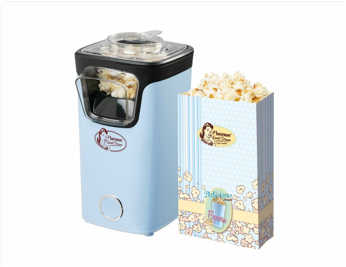
Image: The Bestron APC200B Hot Air Popcorn Machine in blue, showcasing its compact design.