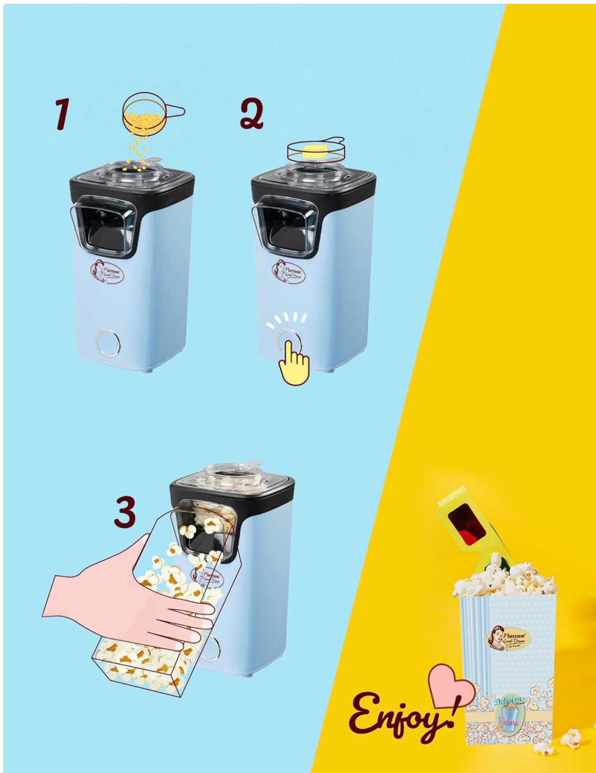
Image: A step-by-step illustration showing how to operate the popcorn machine: adding kernels, starting the machine, and collecting the freshly popped corn.